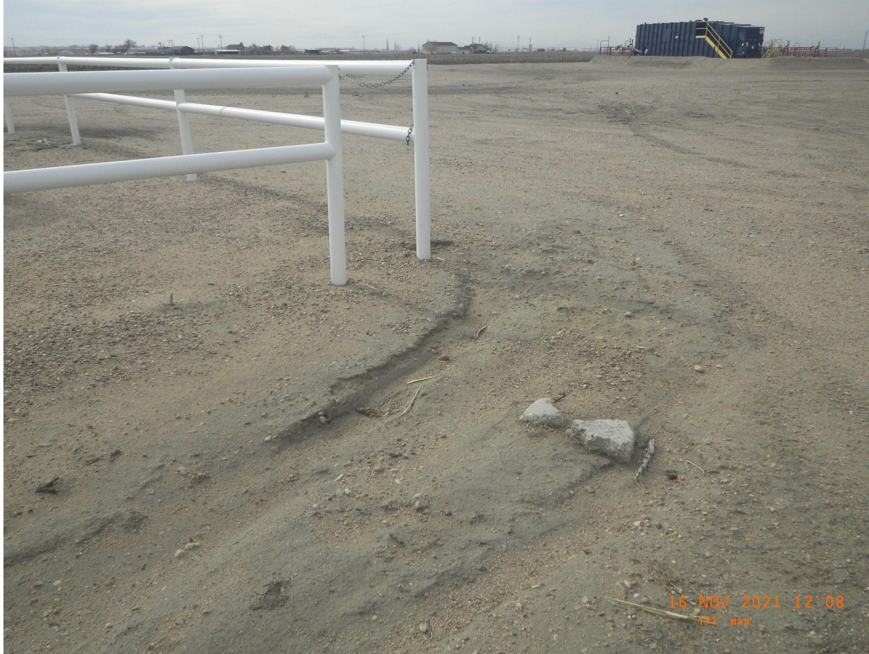
Photo 3. Rill erosion located on south eastern edge of the tank battery.