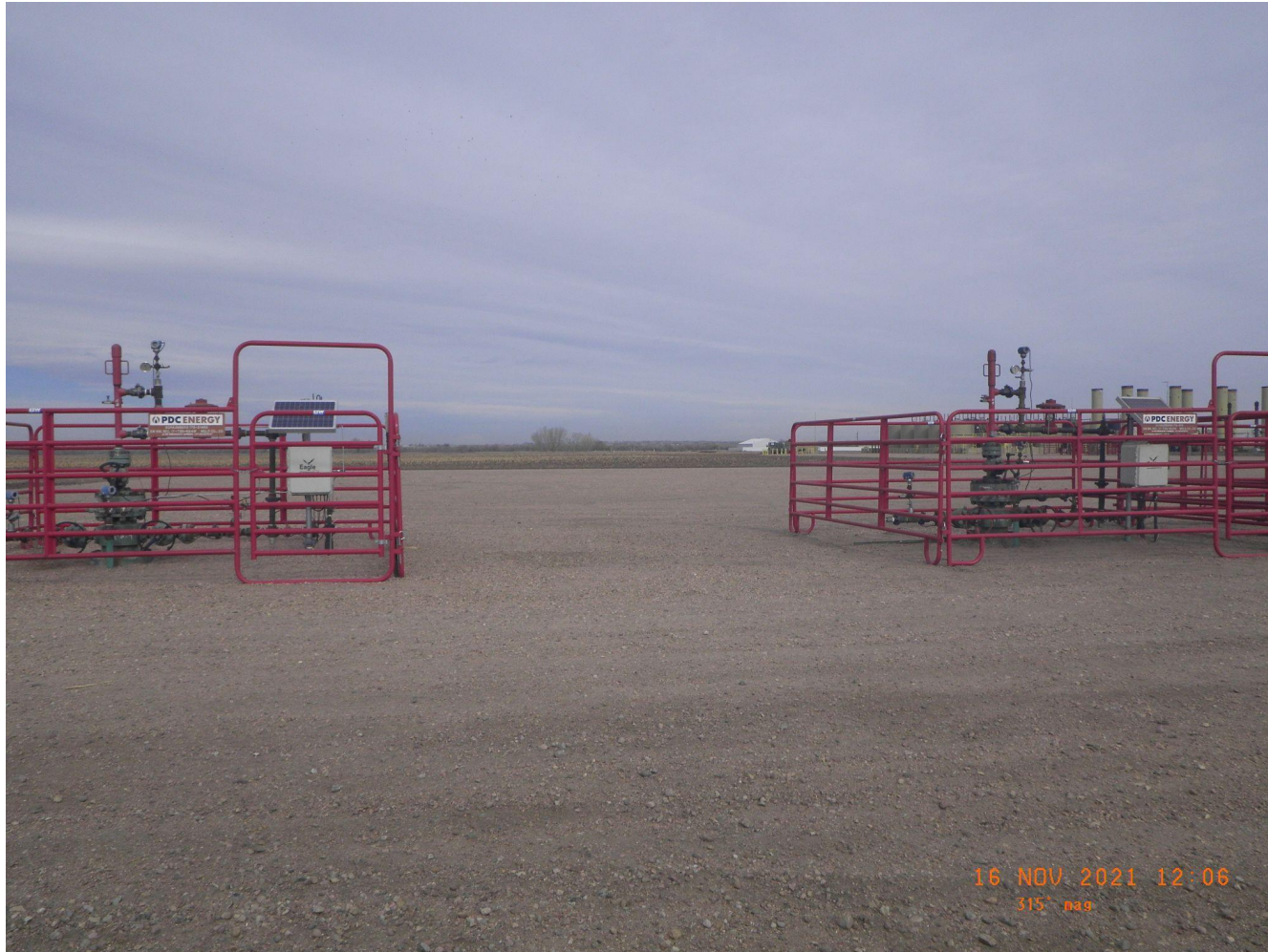
Photo 2. Overview photo of the reclaimed well taken at ground level from the southern edge of the well looking north. Note: the reclaimed well sits between two producing wells on site.