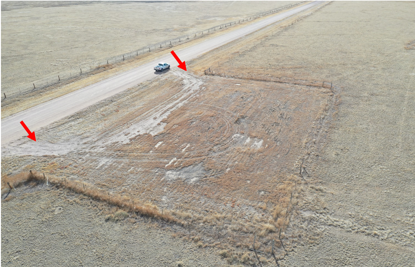
Photo 2. Drone aerial image facing southeast toward the associated abandoned facility. The access points shown at red arrows need to be reclaimed. The fence will need to be put back to the original position.