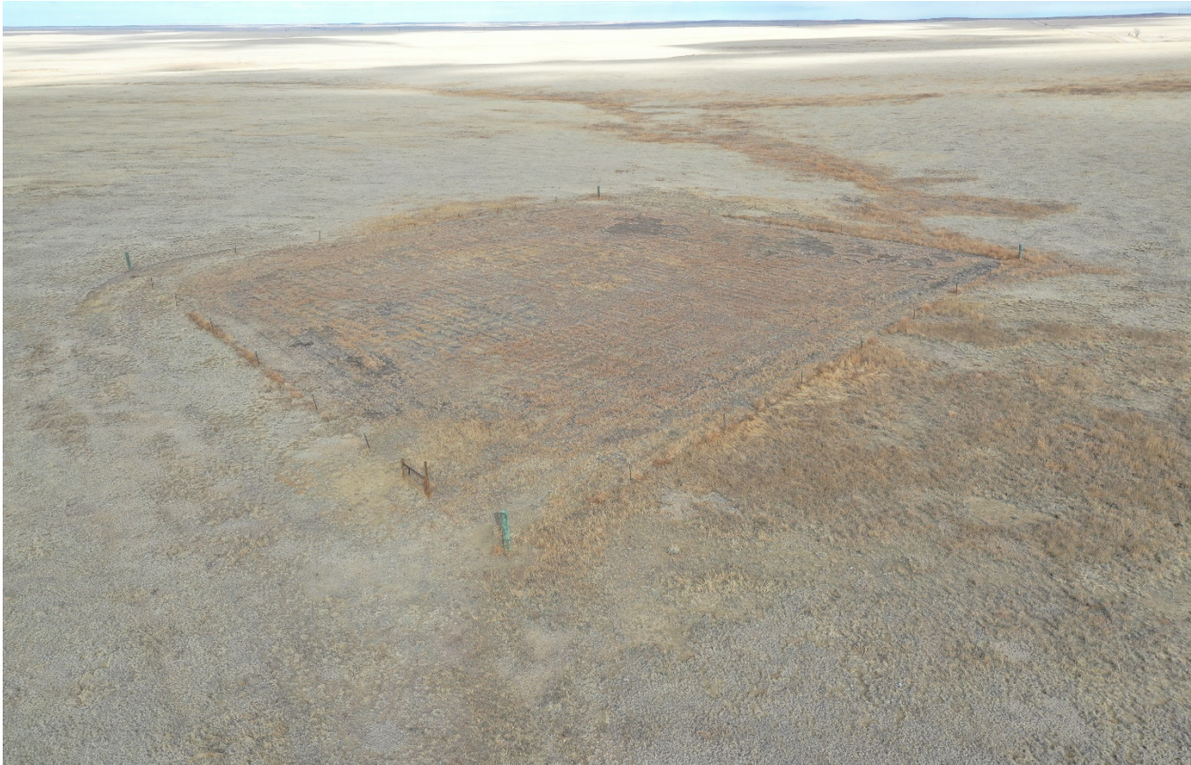
Photo 4. Drone aerial photo facing northwest toward the fenced location. The brown vegetation color at the location is undesirable weeds (Kochia).