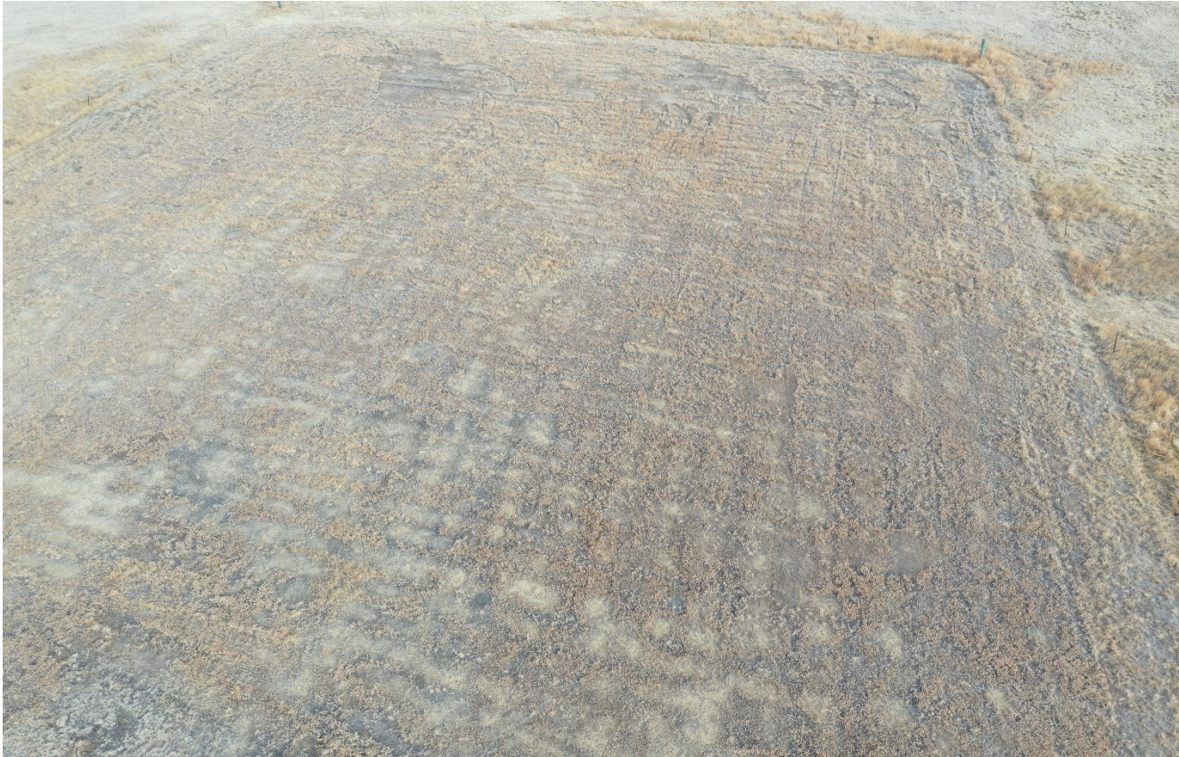
Photo 5. Facing down toward the location. It appears the weeds at the location had been mowed since previous inspection.