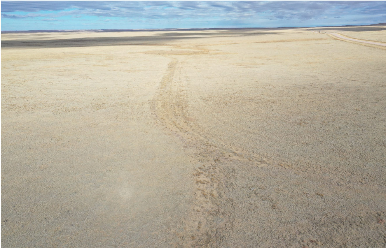
Photo 3. Drone aerial photo facing northwest toward the access road.