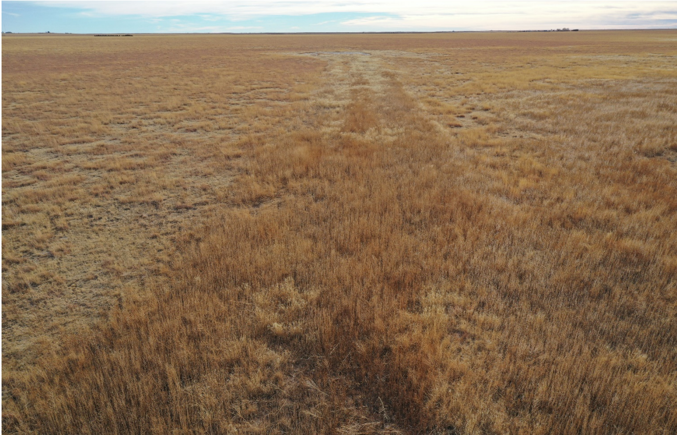
Photo 1. Drone aerial photo facing southwest toward the former access road. There is mostly undesirable weeds (Kochia) at the beginning portion of the road.