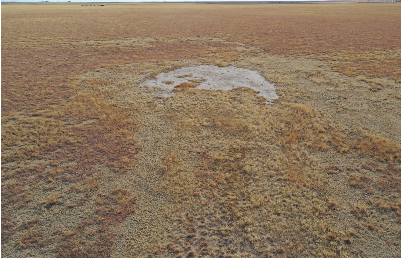
Photo 2. Drone aerial photo facing southwest toward the abandoned well site. The site still remains bare of vegetation.