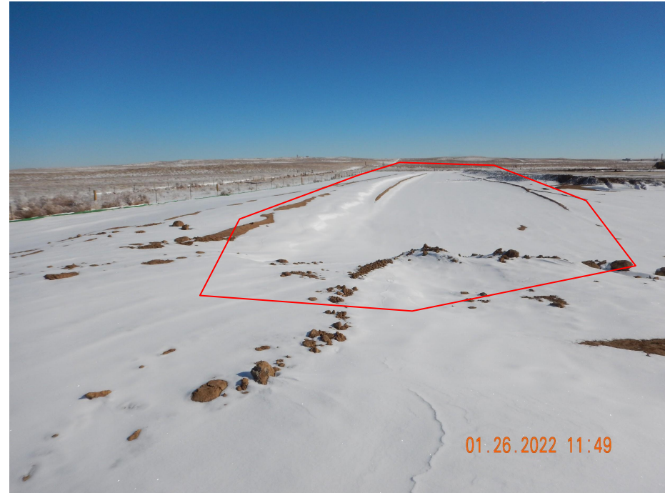
Photo 5. Photo taken from the northern location, facing East. Photo illustrates the approximate area for the detention pond being constructed per Weld County requirements.