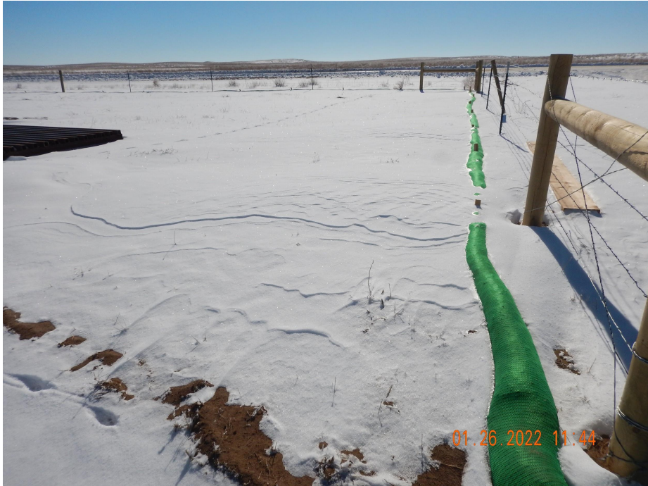
Photo 2. Photo taken from the entrance of location, facing South. Photo illustrates temporarily BMPs have been installed around the perimeter of location. Frozen soil conditions were observed at the time of this inspection.