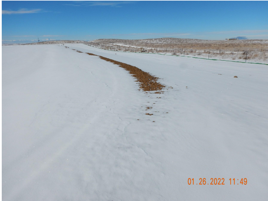
Photo 4. Photo taken from the northern location, facing West. See comments under Photo 2.