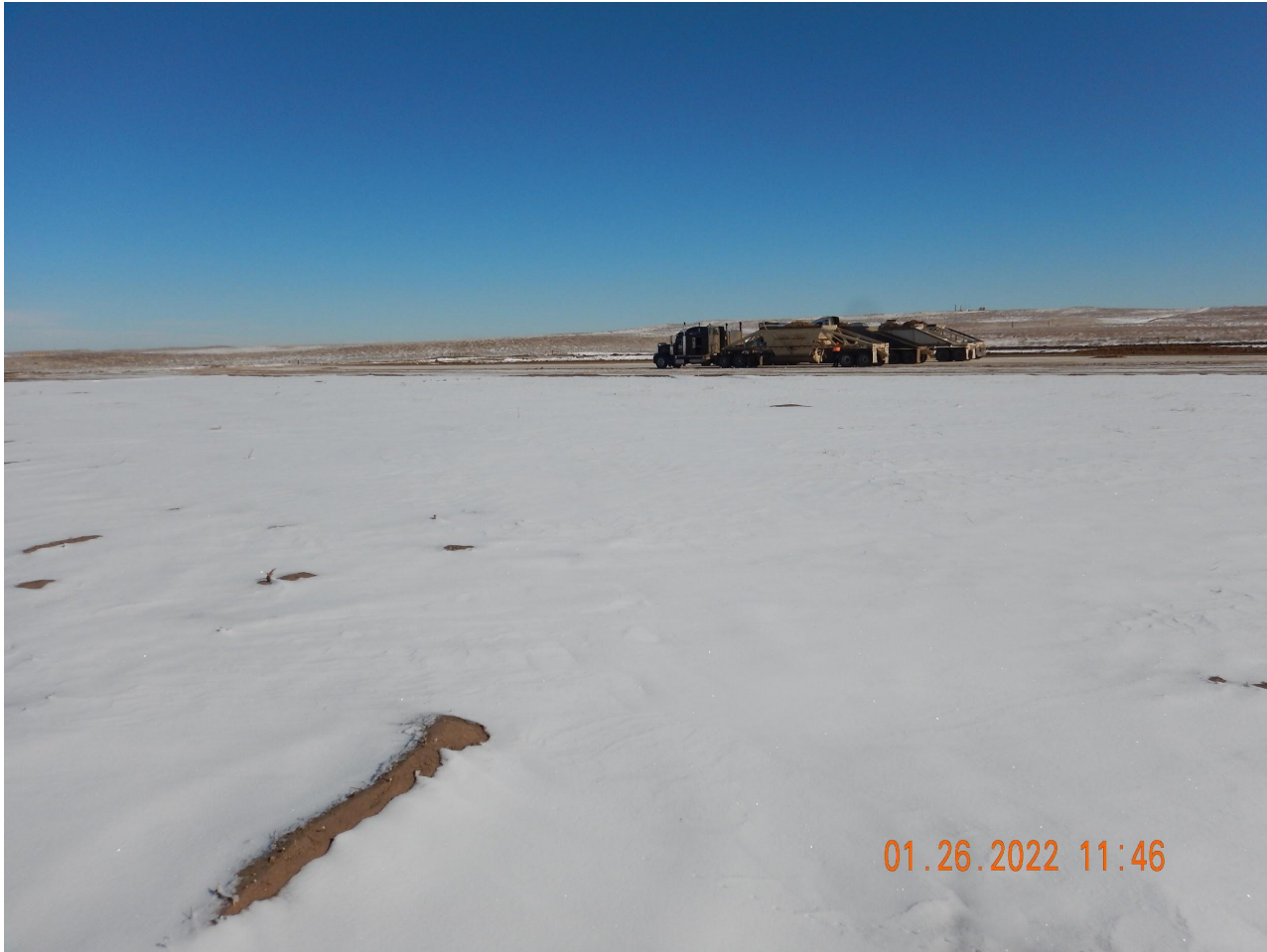
Photo 6. Photo taken from the western facility pad, facing East. Photo illustrates Operator has is importing fill material to the location.