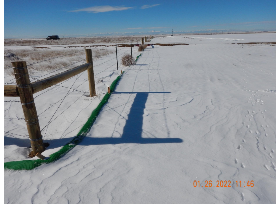
Photo 3. Photo taken from the southern location, facing West. See comments under Photo 2.