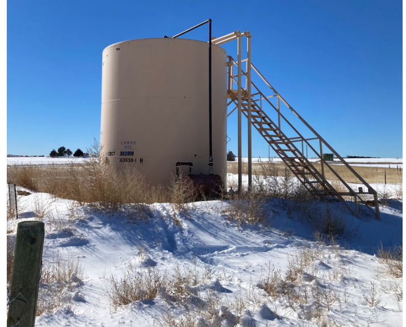
Looking SW 300 BBL Crude tank