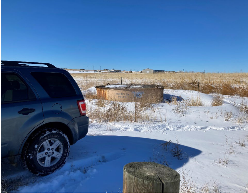
Location looking west Note: PW tank

Location Name: Painted Pegasus Petroleum – PAN AM 60 E Lease SESE Section 3 – Township 1 South - Range 64 West; Facility 481581 Adams County