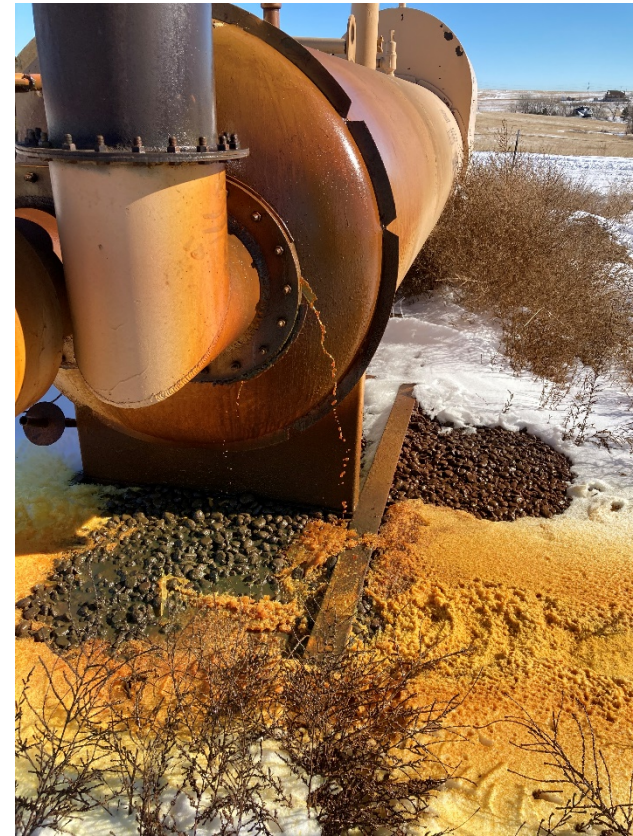
Leaking separator Looking east

Note: fluid in berm containment; separator and emission control device in background