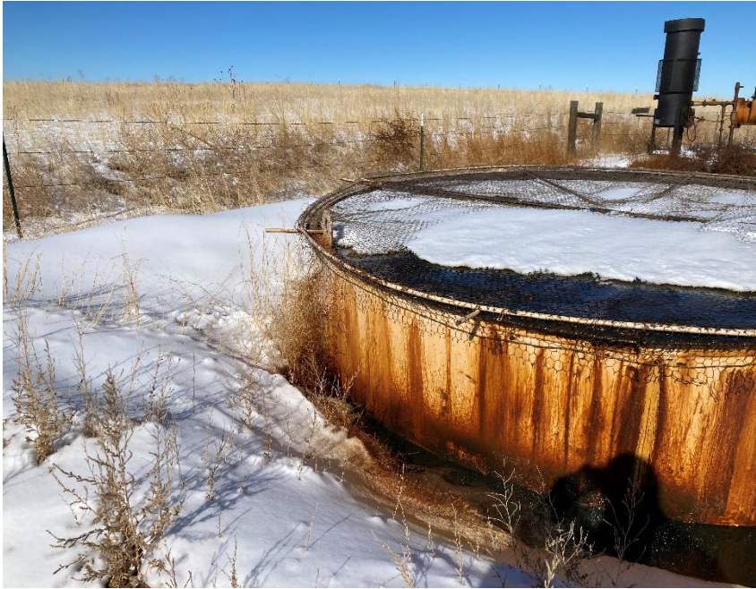
Screened PW Pit

Location Name: Painted Pegasus Petroleum – PAN AM 60 E Lease SESE Section 3 – Township 1 South - Range 64 West; Facility 481581 Adams County