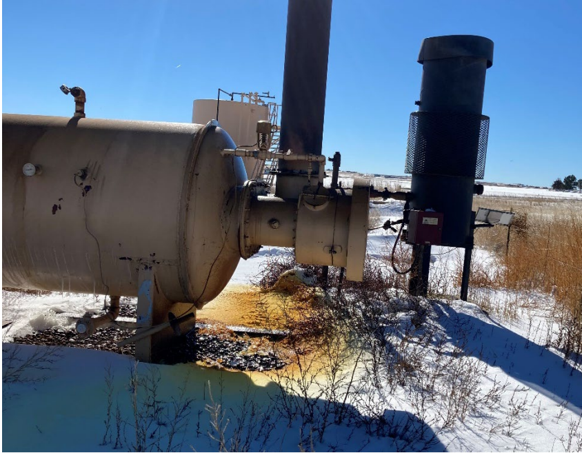
Separator with tank in background. View looking south. Note stained surface..

Location Name: Painted Pegasus Petroleum – PAN AM 60 E Lease SESE Section 3 – Township 1 South - Range 64 West; Facility 481581 Adams County