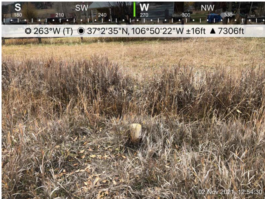
Photo 1: Underwood Ditch (OWP) #2 prior to plugging. Wellbore fluid sample collected from within casing, 11/2/2021.