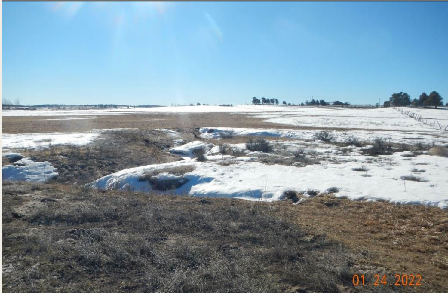
Photo 5. View of reference area vegetation comprised of grasses such as irrigated grass field, with timothy, tall fescue, and meadow brome.