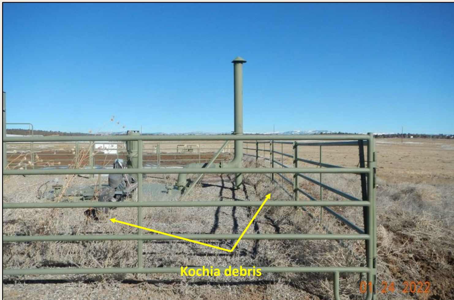
Photo 4. View of more kochia debris observed around fired equipment and within the outer edges of the working area.