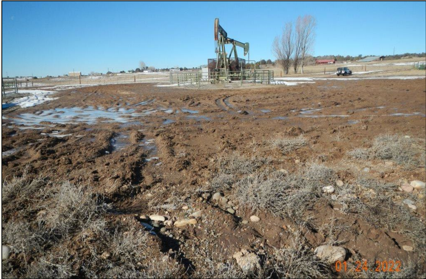
Photo 1. View of project area from the southeastern corner facing center.