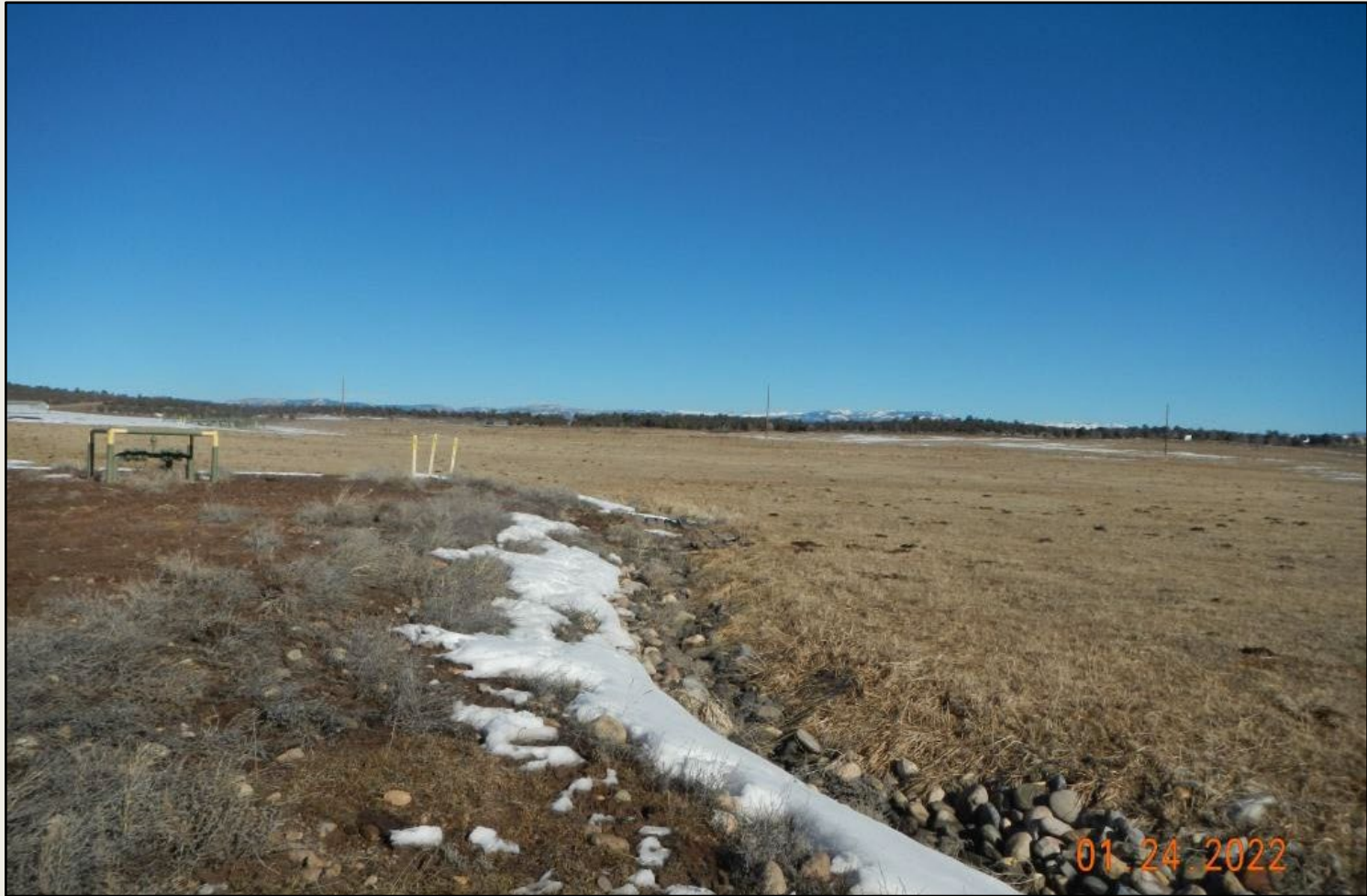
Photo 2. View of the eastern project area from the southeastern project area facing northward. Revegetation is progressing with irrigated grasses such as tall fescue and timothy.