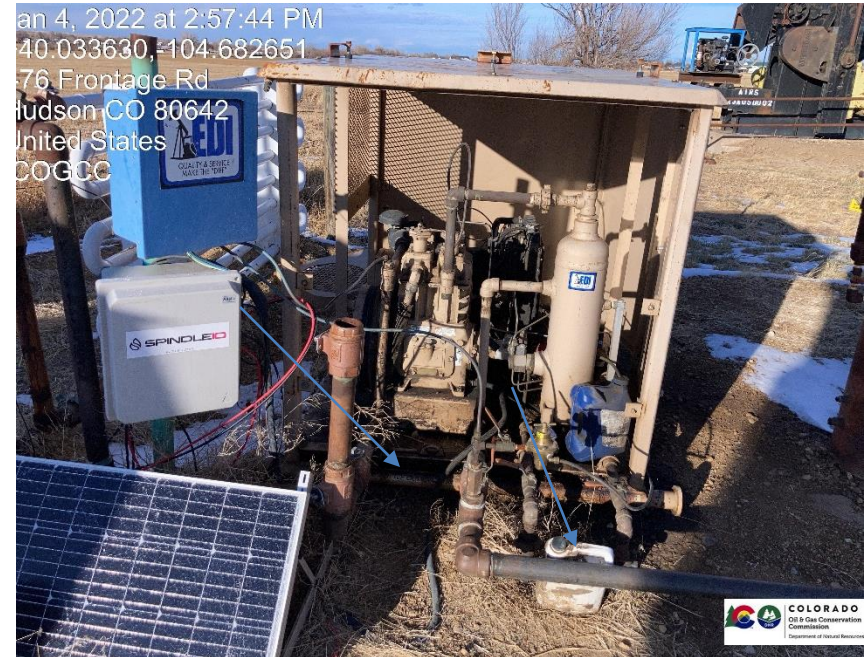
Pic 6 Stained soil and trash by motor