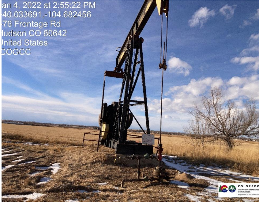
Pic 1 wellhead / pump jack

Jan 4, 2022 at 2:55:22 PM 40.033691,-104.682456 76 Frontage Rd Hudson CO 80642 United States COGCC