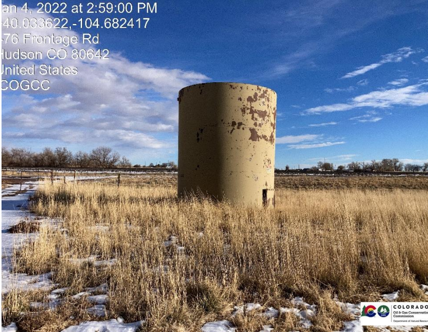
Pic 9 unused tank on location needs to be removed.

Jan 4, 2022 at 2:59:00 PM 40.033622,-104.682417 76 Frontage Rd Hudson CO 80642 United States COGCC