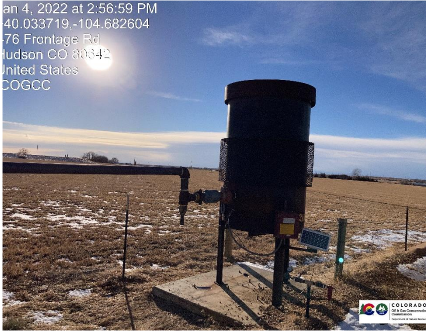
Pic 3 ECD

Jan 4, 2022 at 2:56:59 PM 40.033719,-104.682604 76 Frontage Rd Hudson CO 80642 United States COGCC