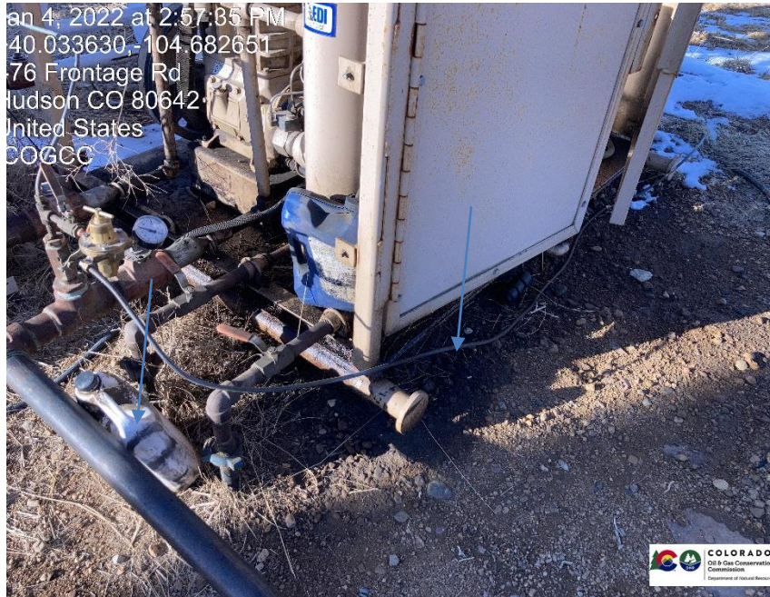
Pic 5 stained soil and trash by motor