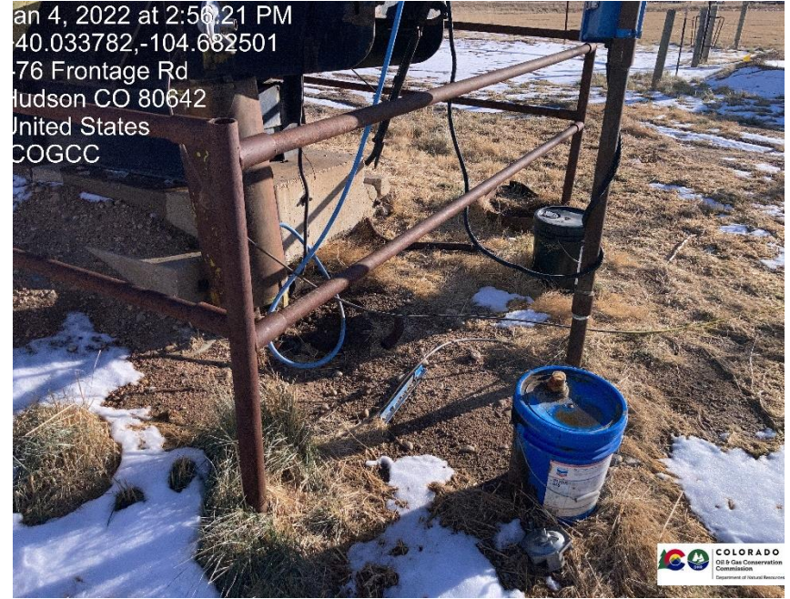
Pic 2 stained soil and trash by pumping unit motor

Jan 4, 2022 at 2:56:21 PM 40.033782,-104.682501 76 Frontage Rd Hudson CO 80642 United States COGCC