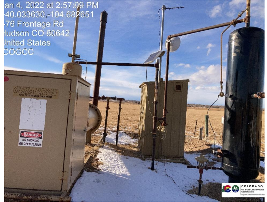
Pic 4 gas meter run, vertical separator, horizontal separator

Jan 4, 2022 at 2:57:09 PM 40.033630,-104.682651 76 Frontage Rd Hudson CO 80642 United States COGCC