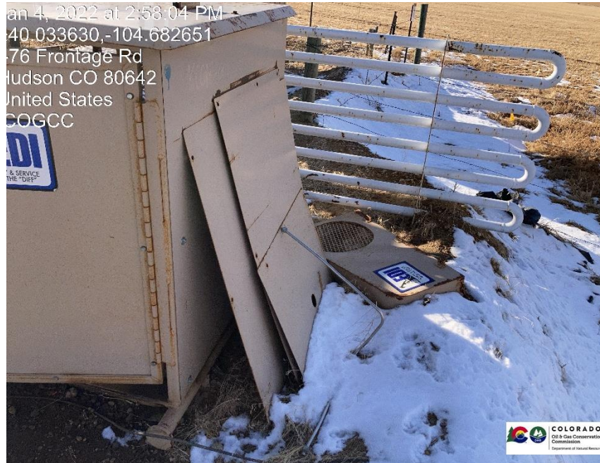
Pic 7 unused equipment on side of motor house