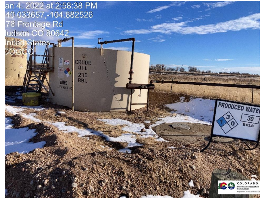
Pic 8 tanks