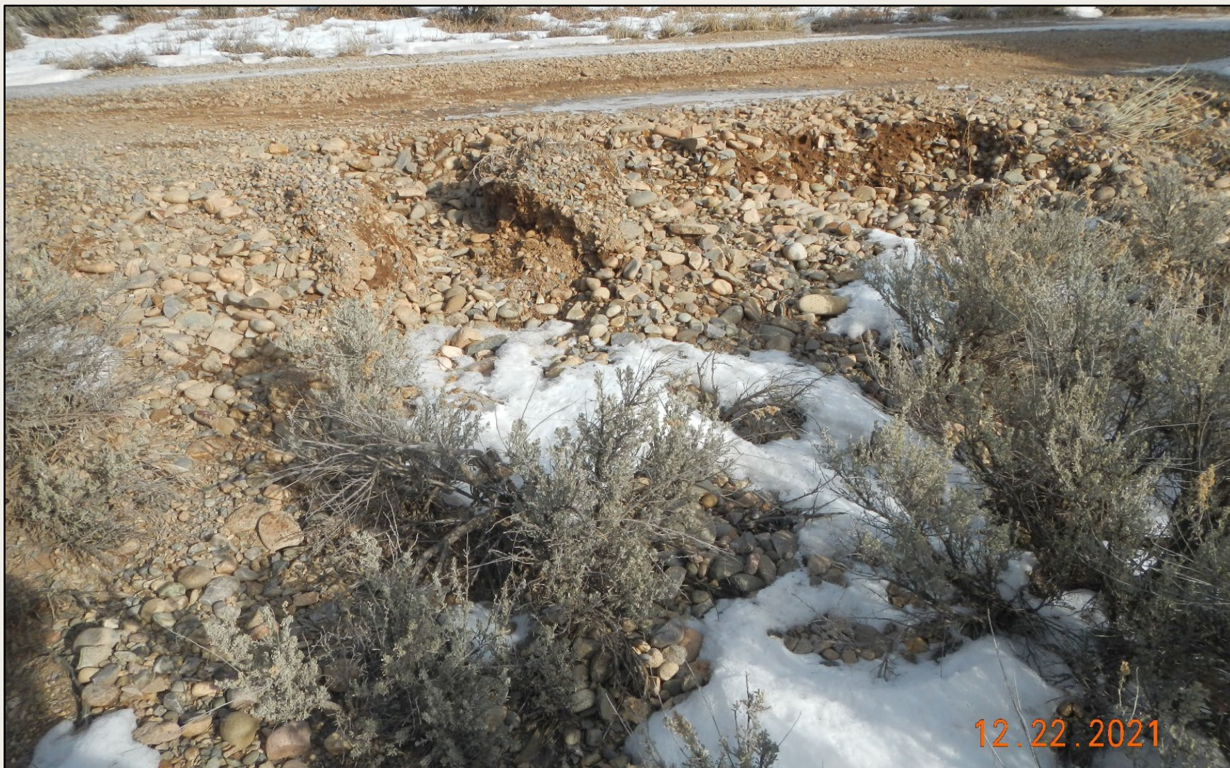
Photo 5. View of area along access road (approx. 10 -15 feet long) where stormwater flows over the access road and is eroding the edges of the road. Cobble and gravel from the road observed washed down-slope. Drainage and road need stabilization here.