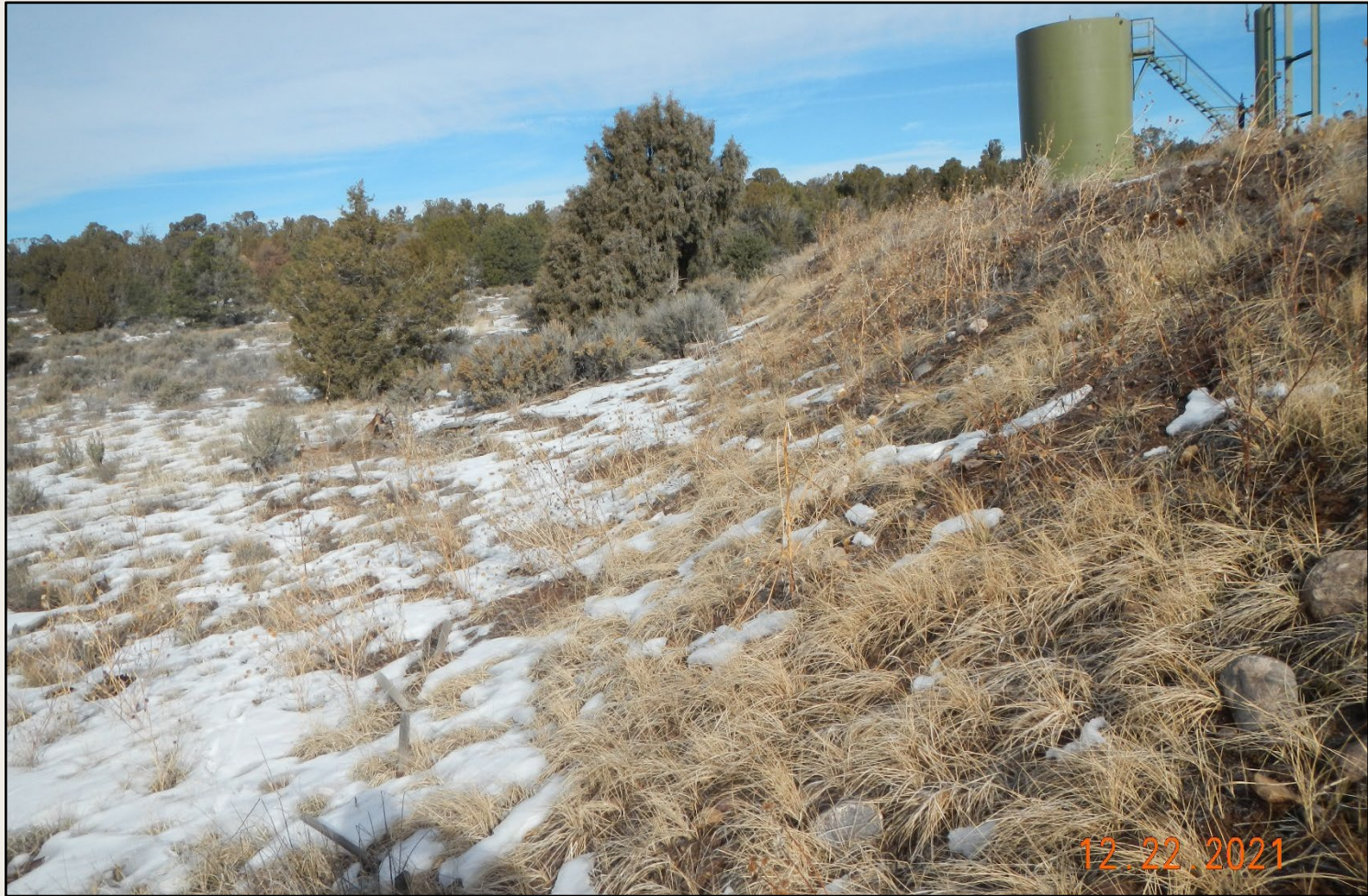
Photo 2. View of the western fill slope from the southwestern corner facing northward.