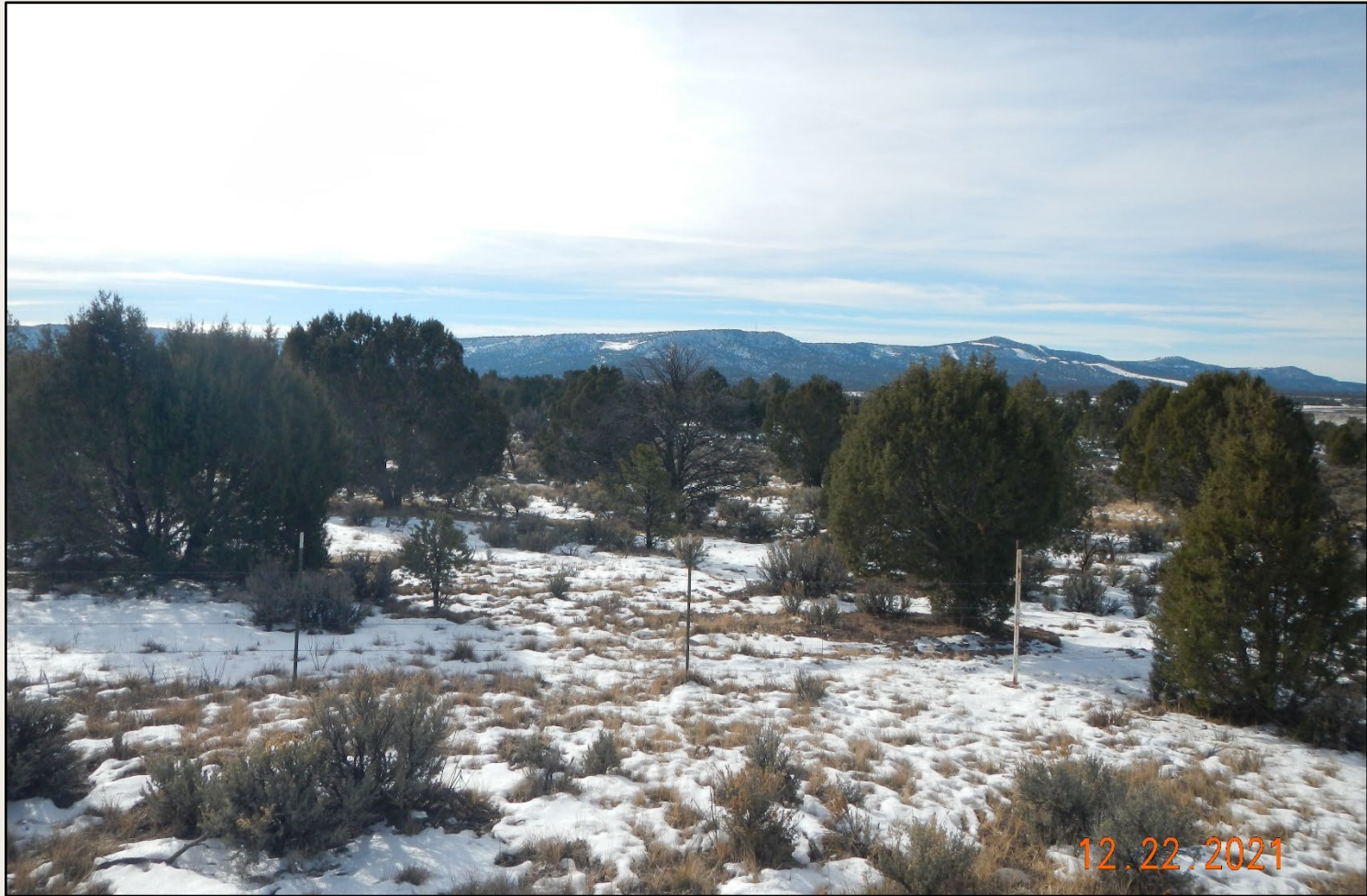
Photo 6. View of the reference area comprised of pinyon and juniper woodland with sagebrush, James galleta, purple threeawn, and Indian ricegrass.