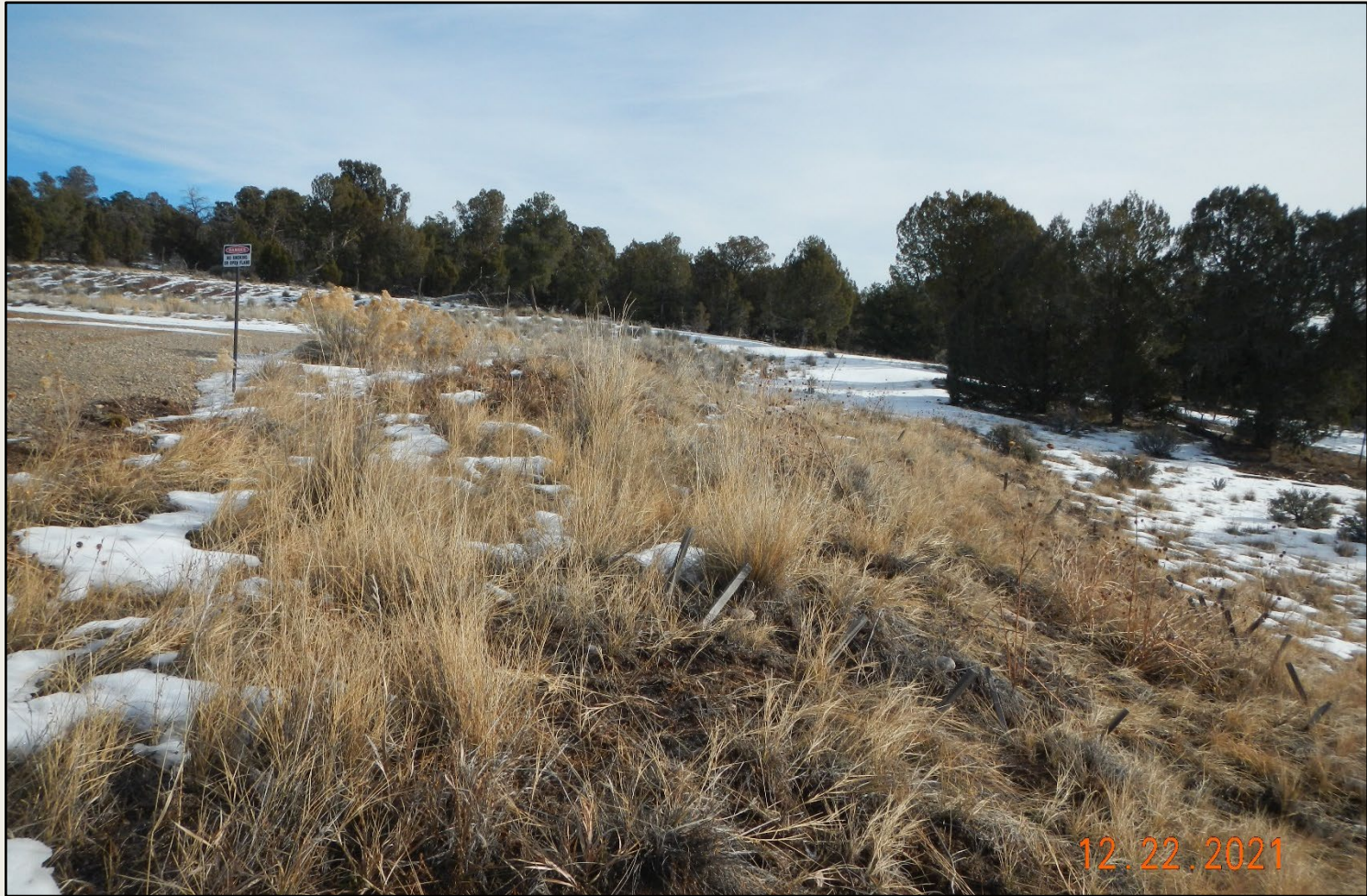
Photo 1. View of the southern project area from the southwestern corner facing center. Revegetation is progressing with western wheatgrass, smooth brome, and intermediate wheatgrass. Revegetation at final reclamation needs to be representative of the surrounding reference area.