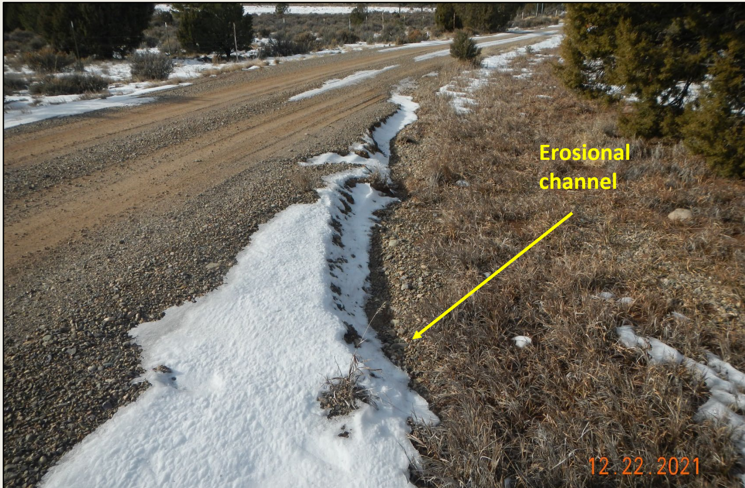
Photo 3. View of erosional channel approximately 12-15 inches wide and deep, flowing off of the well pad and down/across the access road.