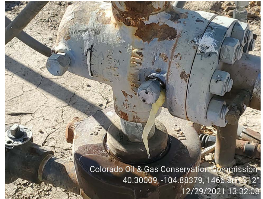
Master valve leak