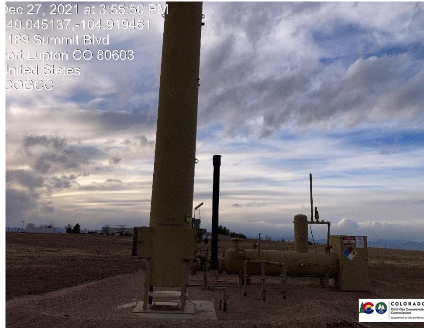
Pic 1 ECD, horizontal separator