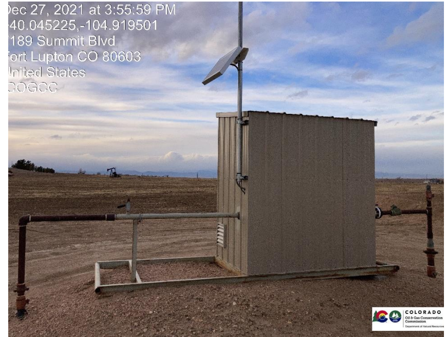
Pic 2 gas meter run