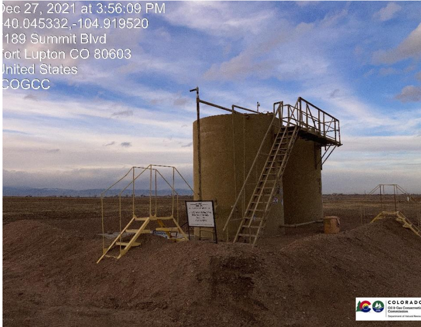
Pic 3 tanks

Dec 27, 2021 at 3:56:09 PM 40.045332,-104.919520 189 Summit Blvd Fort Lupton CO 80603 United States COGCC