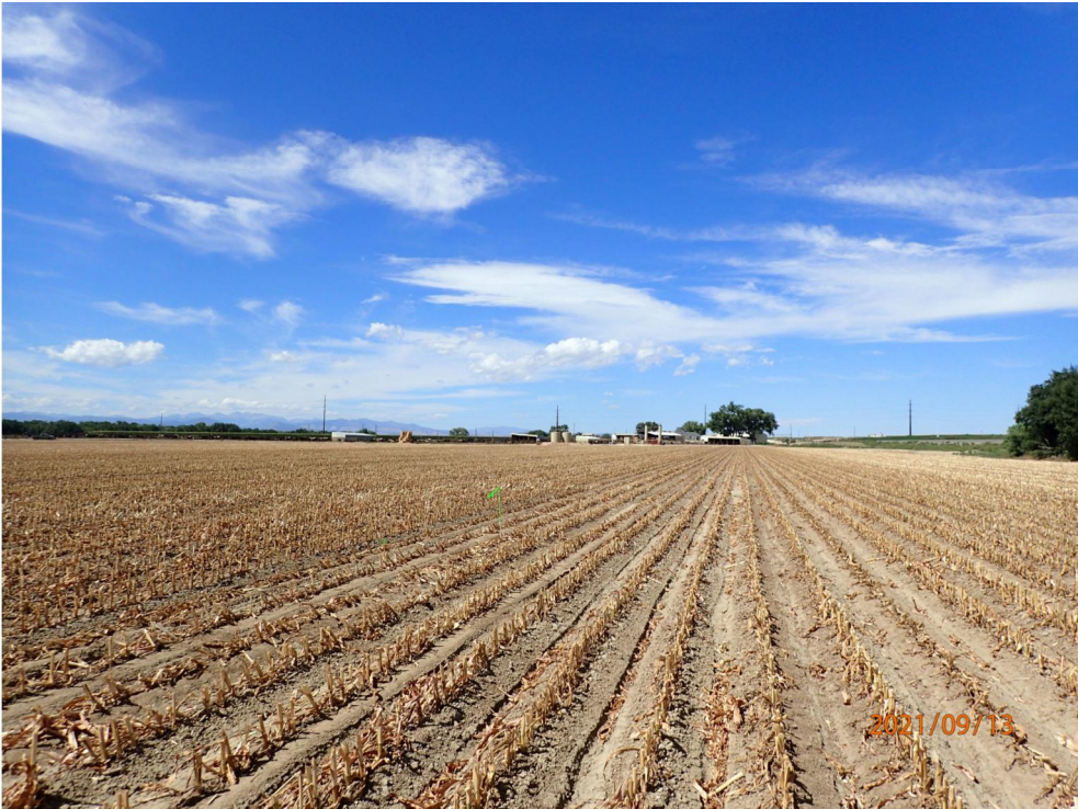
LOCATION PICTURE OF CHARLENE NELSON 12-34HZ FACILITY PAD - CAMERA VIEW WEST

K:\ANADARKO\2020\2020_112_CHARLENE NELSON_TSN_R67W_SEC_34\DWG\CHARLENE NELSON_TSN_R67W_SEC_34.dwg, 11/16/2021 11:36:05 AM, seven