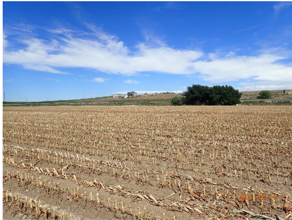
LOCATION PICTURE OF CHARLENE NELSON 12-34HZ WELL PAD - CAMERA VIEW NORTH

SECTION 34, TOWNSHIP 5 NORTH, RANGE 67 WEST, 6TH P.M., WELD COUNTY, COLORADO