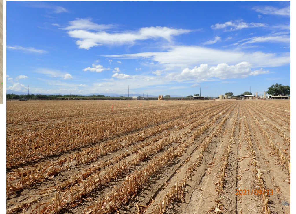
LOCATION PICTURE OF CHARLENE NELSON 12-34HZ WELL PAD - CAMERA VIEW WEST