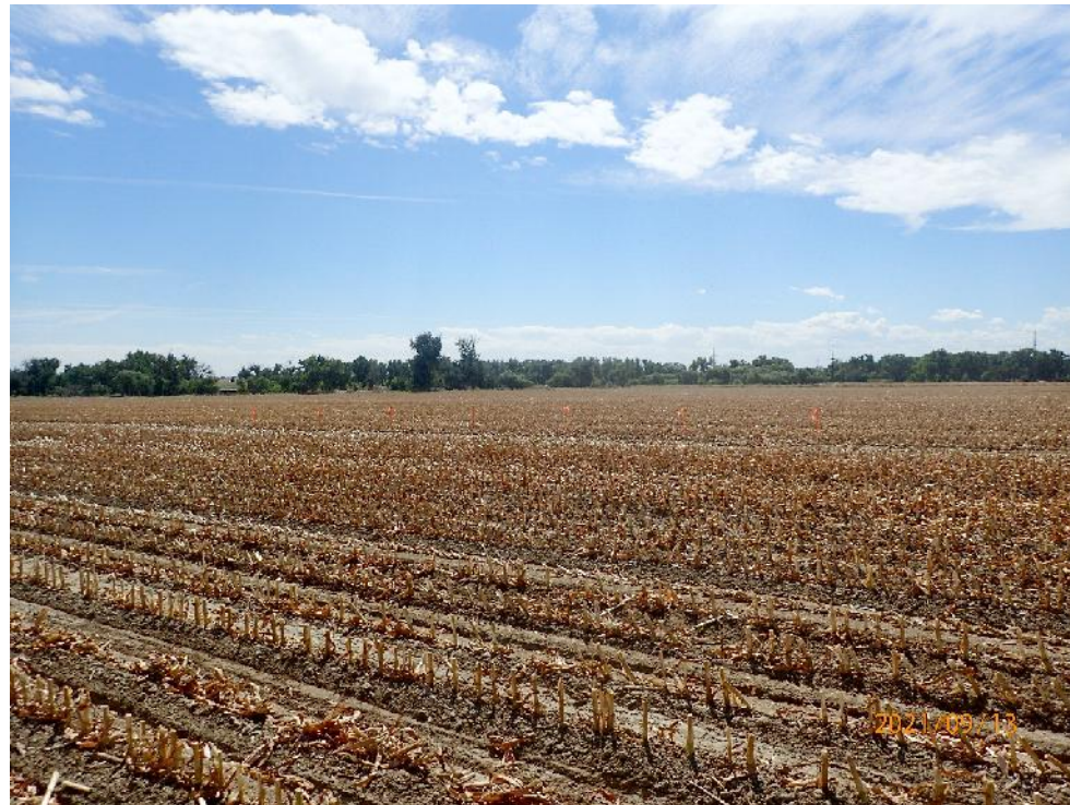
LOCATION PICTURE OF CHARLENE NELSON 12-34HZ WELL PAD - CAMERA VIEW SOUTH