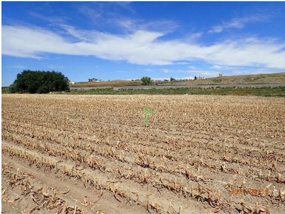
LOCATION PICTURE OF CHARLENE NELSON 12-34HZ FACILITY PAD - CAMERA VIEW NORTH