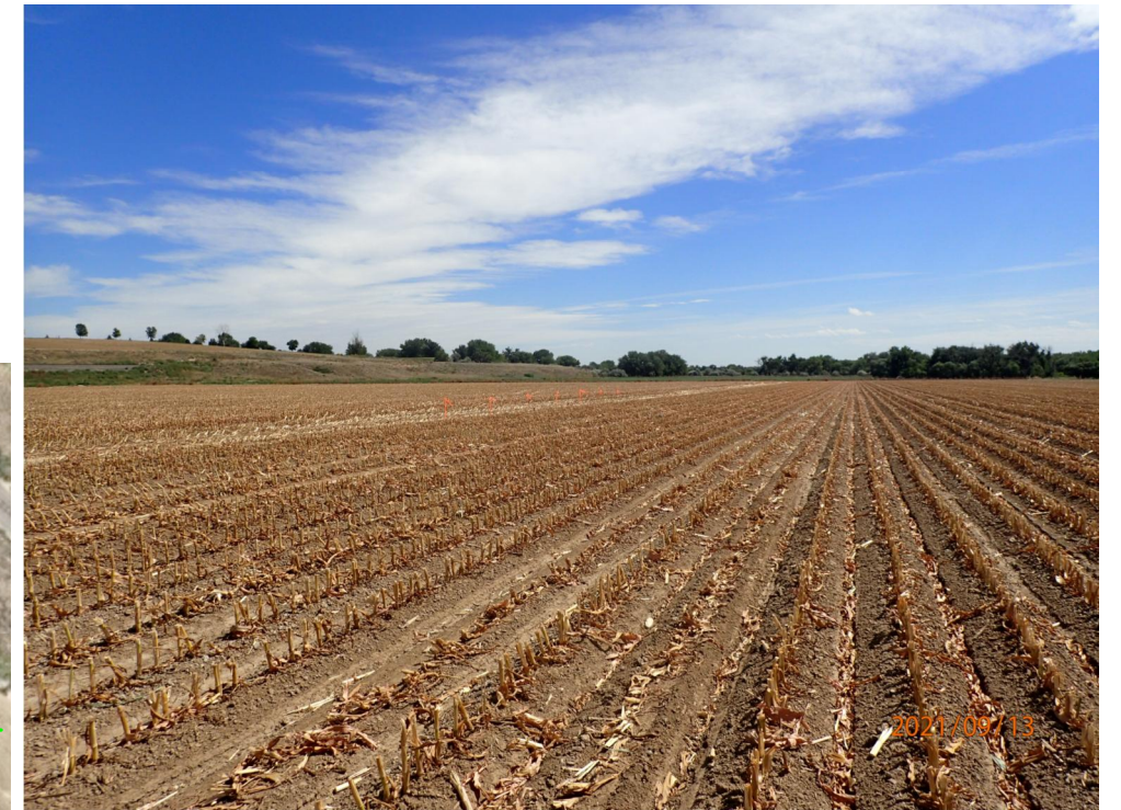
LOCATION PICTURE OF CHARLENE NELSON 12-34HZ WELL PAD - CAMERA VIEW EAST