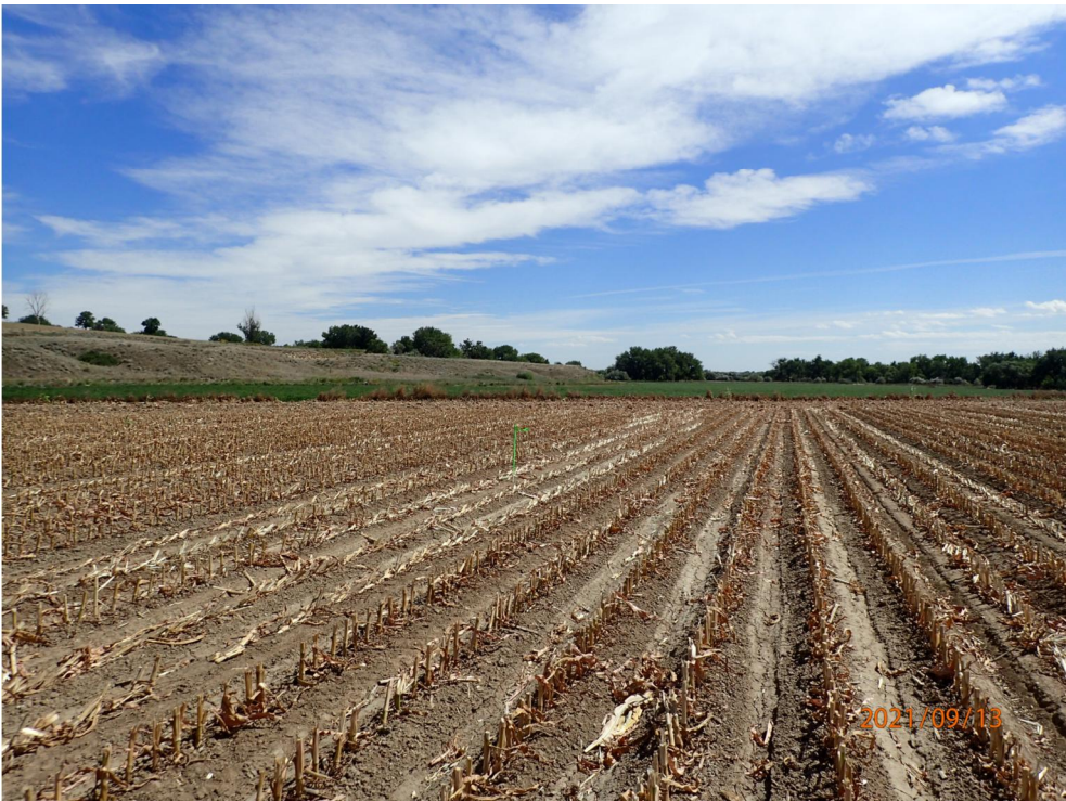
LOCATION PICTURE OF CHARLENE NELSON 12-34HZ FACILITY PAD - CAMERA VIEW EAST