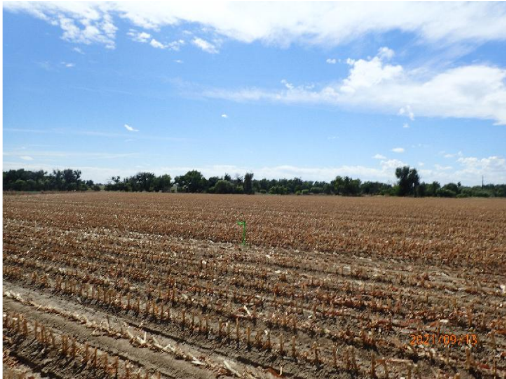
LOCATION PICTURE OF CHARLENE NELSON 12-34HZ FACILITY PAD - CAMERA VIEW SOUTH