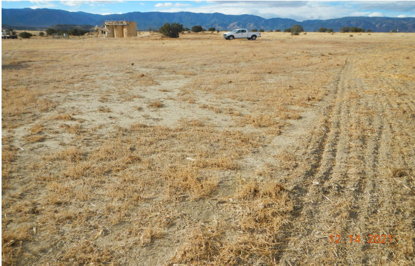
Photo 7. Facing west at the location. The southern portion of the location was not reclaimed and consists of undesirable weeds.