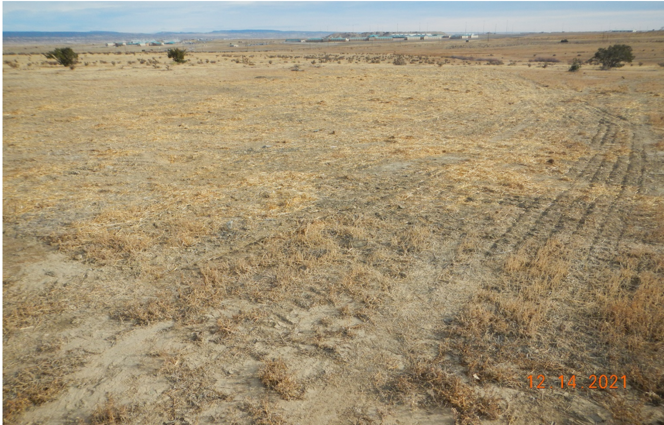
Photo 4. Facing northeast. The northern portion of the location was seeded and straw mulch. It is unknown if certified weed free straw was used.