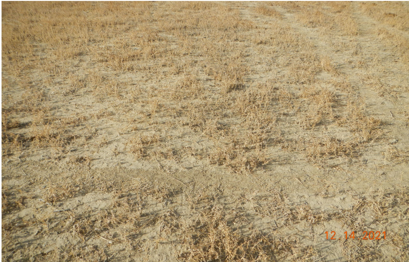
Photo 8. View of groundcover showing undesirable weeds ( Kochia sp.).