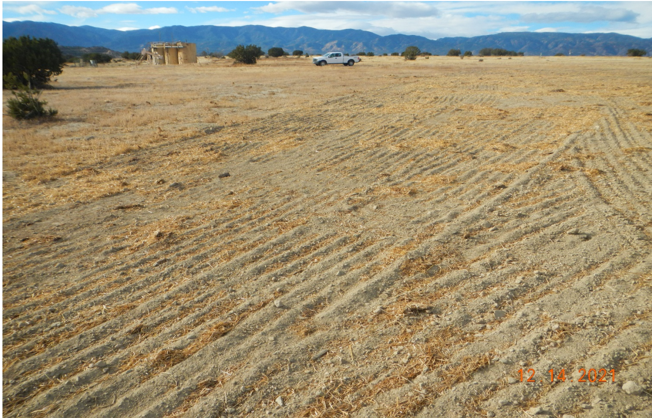
Photo 5. Facing west at the location. The soils are lightly mulched and the mulch was not crimped into the soil which may blow away.