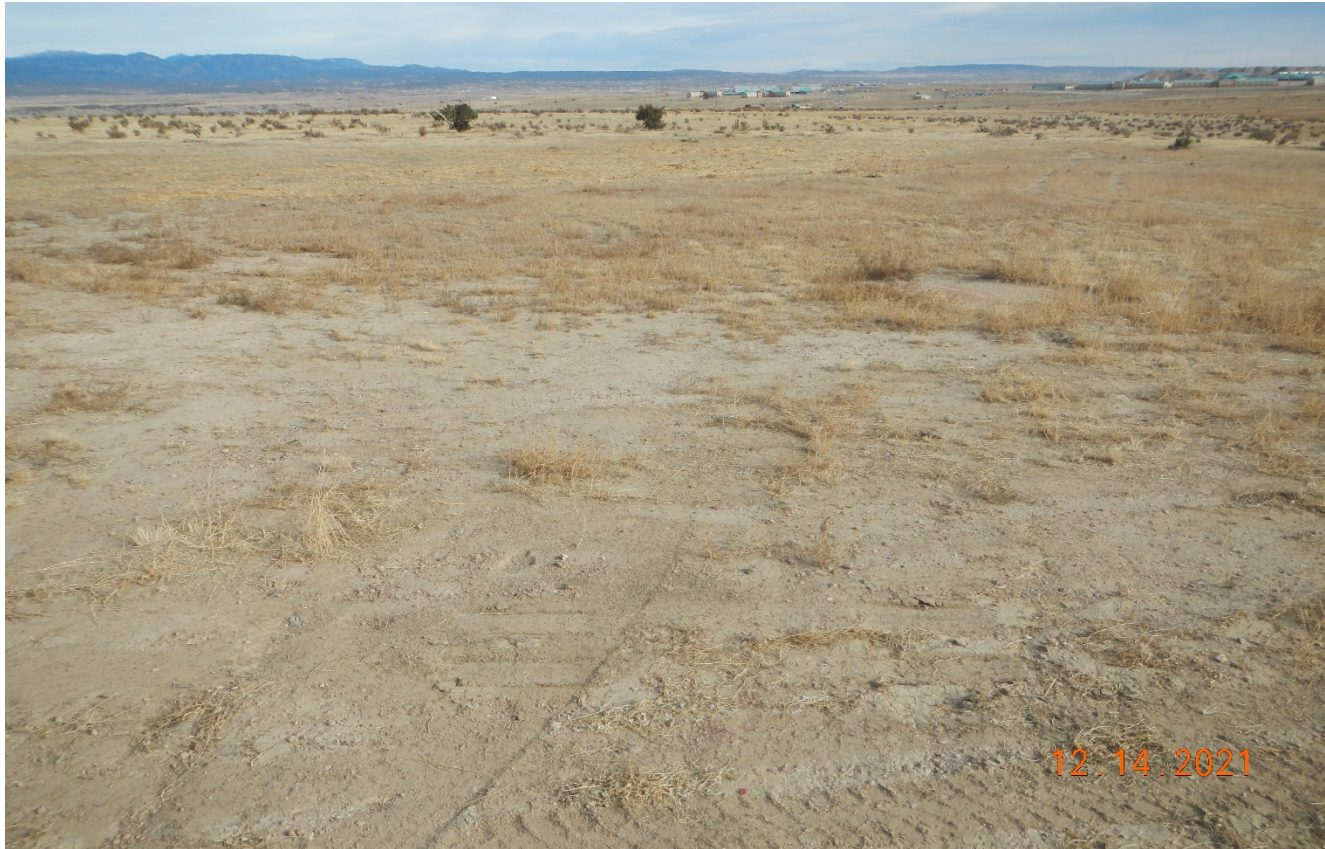
Photo 3. Facing northeast toward the location. The trailer has been removed and soils are bare where the ytrailer was parked shown in the photo.