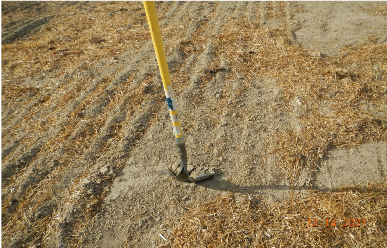
Photo 6. The shovel was placed into the soil to test for compaction. Soils seemed compacted down past 4 inches into the soil. Proper soil decompaction requires cross ripping to at least 18 inches.