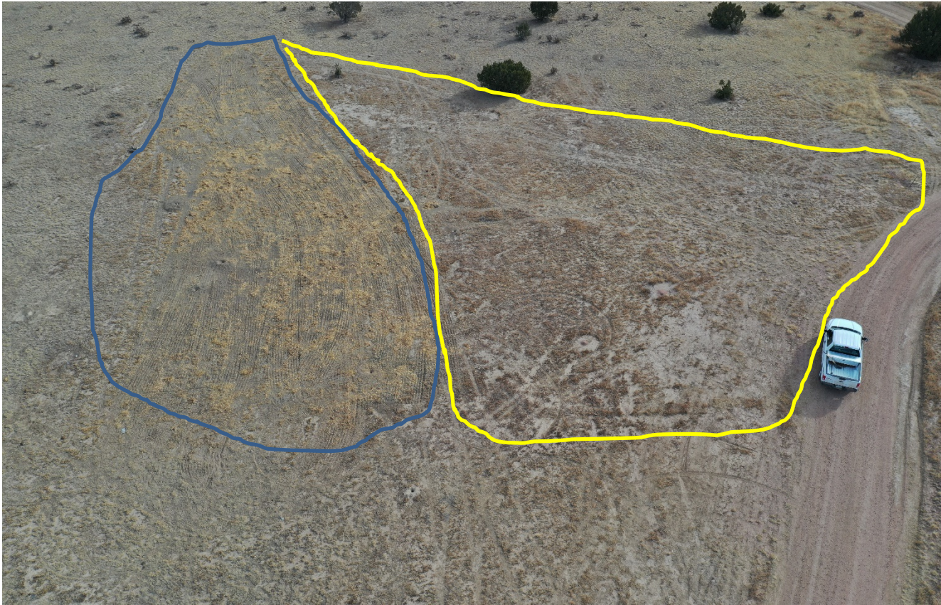
Photo 1. Drone aerial photo facing southeast toward the abandoned well site. The area circled in blue was seeded and straw mulched. The remaining location circled in yellow was not reclaimed.