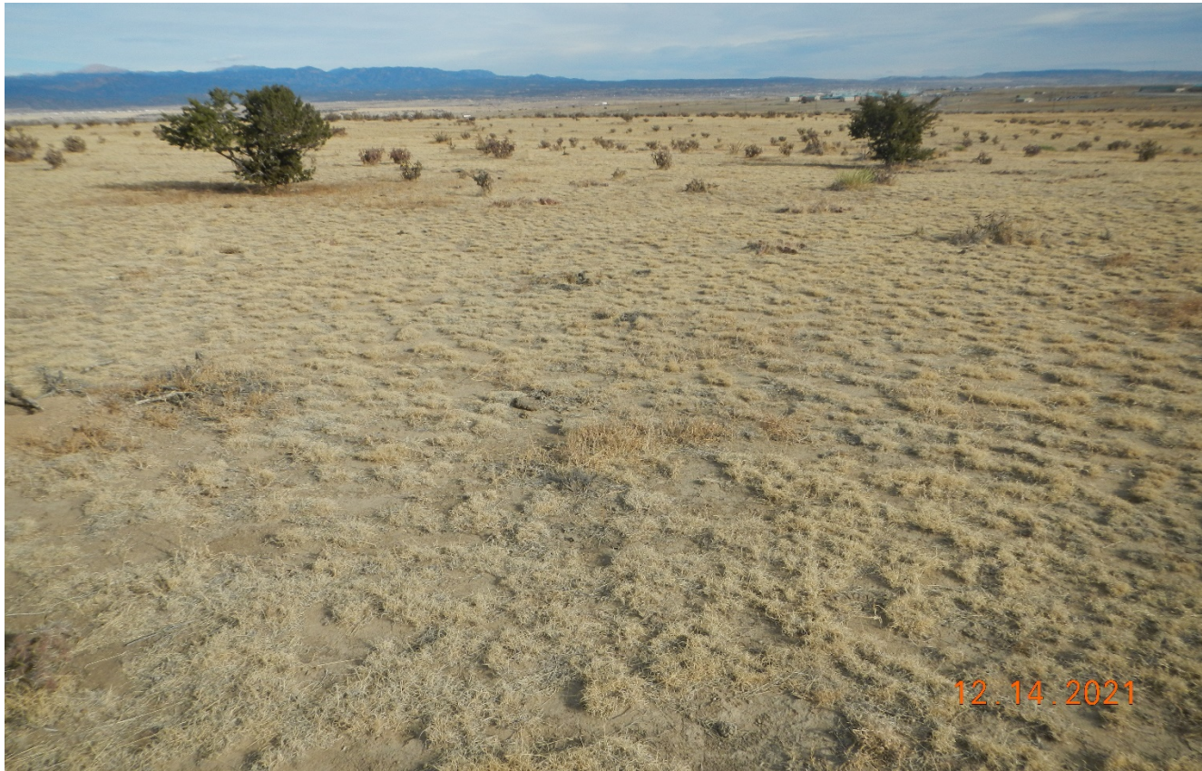
Photo 9. Facing north toward the surrounding undisturbed reference area which consists of Blue grama prairie with little to no undesirable weeds.