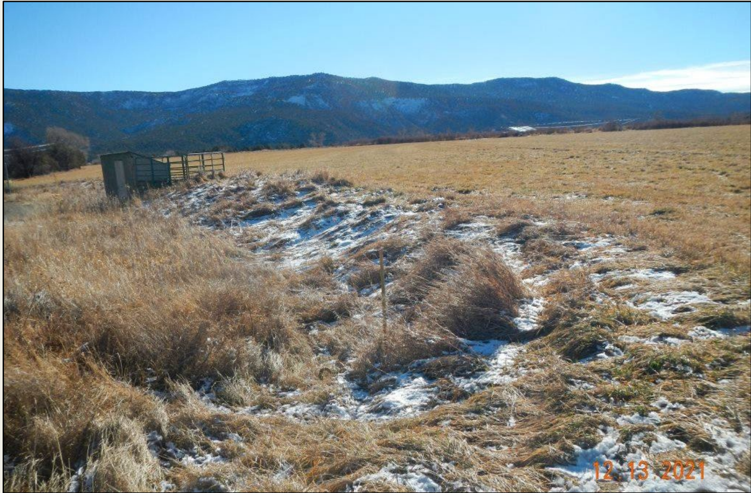
Photo 3. View of the western project area from the northwestern corner facing southward.