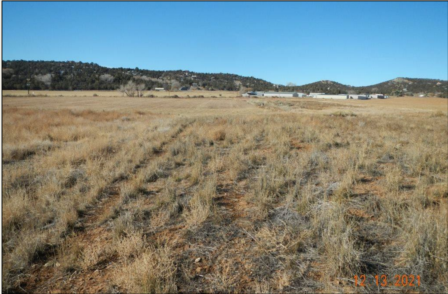
Photo 4. View of reference area comprised irrigated grass field with irrigated grasses such as smooth brome, western wheatgrass, and orchard grass. Vegetation is largely dormant and mowed at this time.