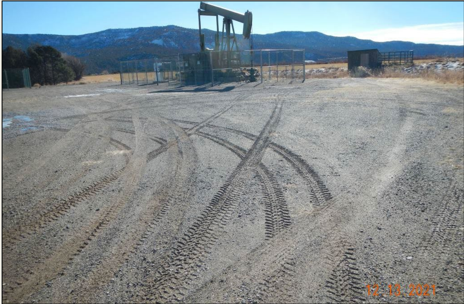
Photo 1. View of the project area from the northwestern corner facing center.