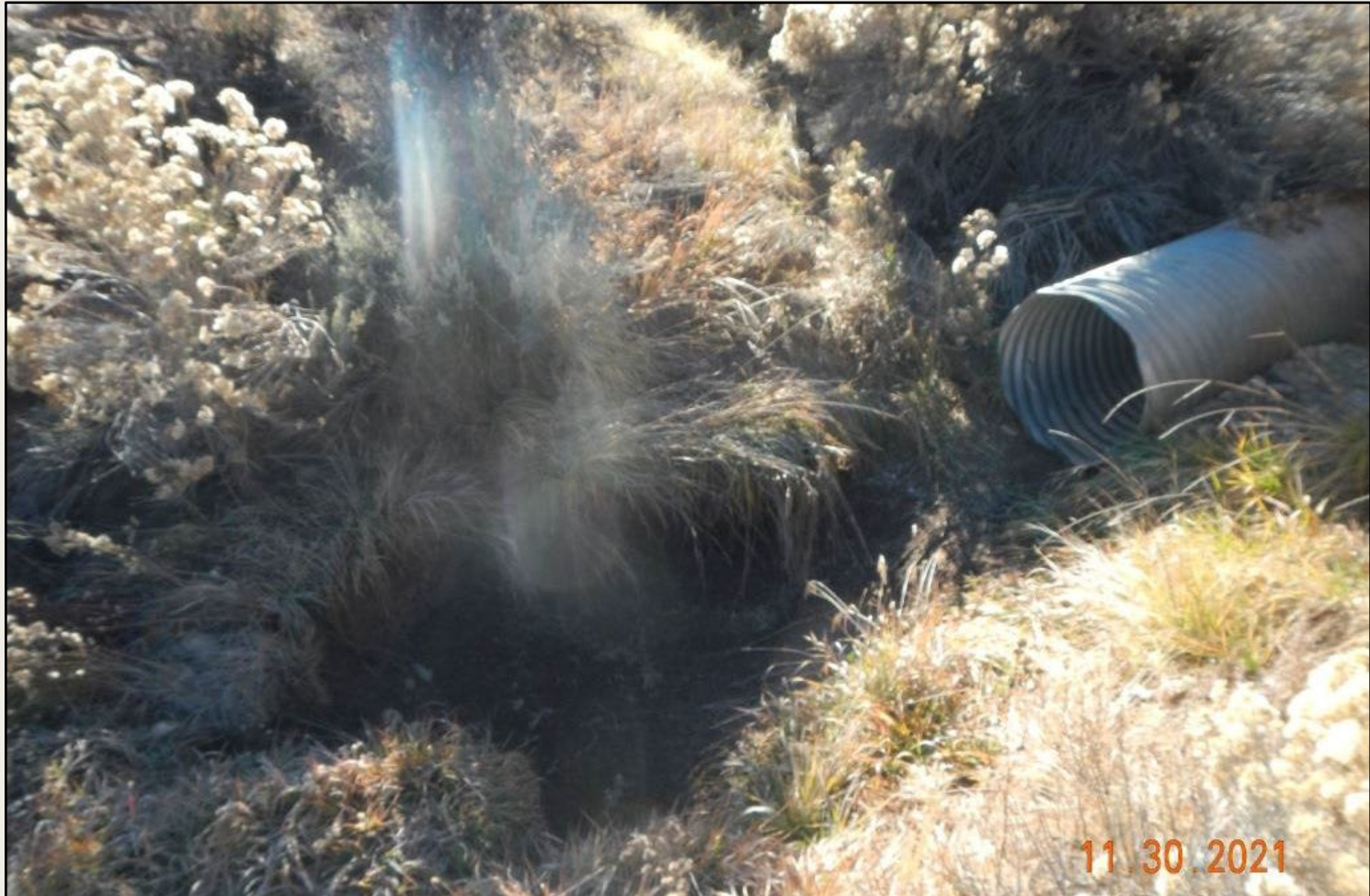
Photo 7. View of erosion occurring at culvert outlet along access road, approximately 3 feet deep, where concentrated stormwater flows out of culvert and eroding soil and vegetation. Erosion observed around culvert indicates that it is not stabilized.