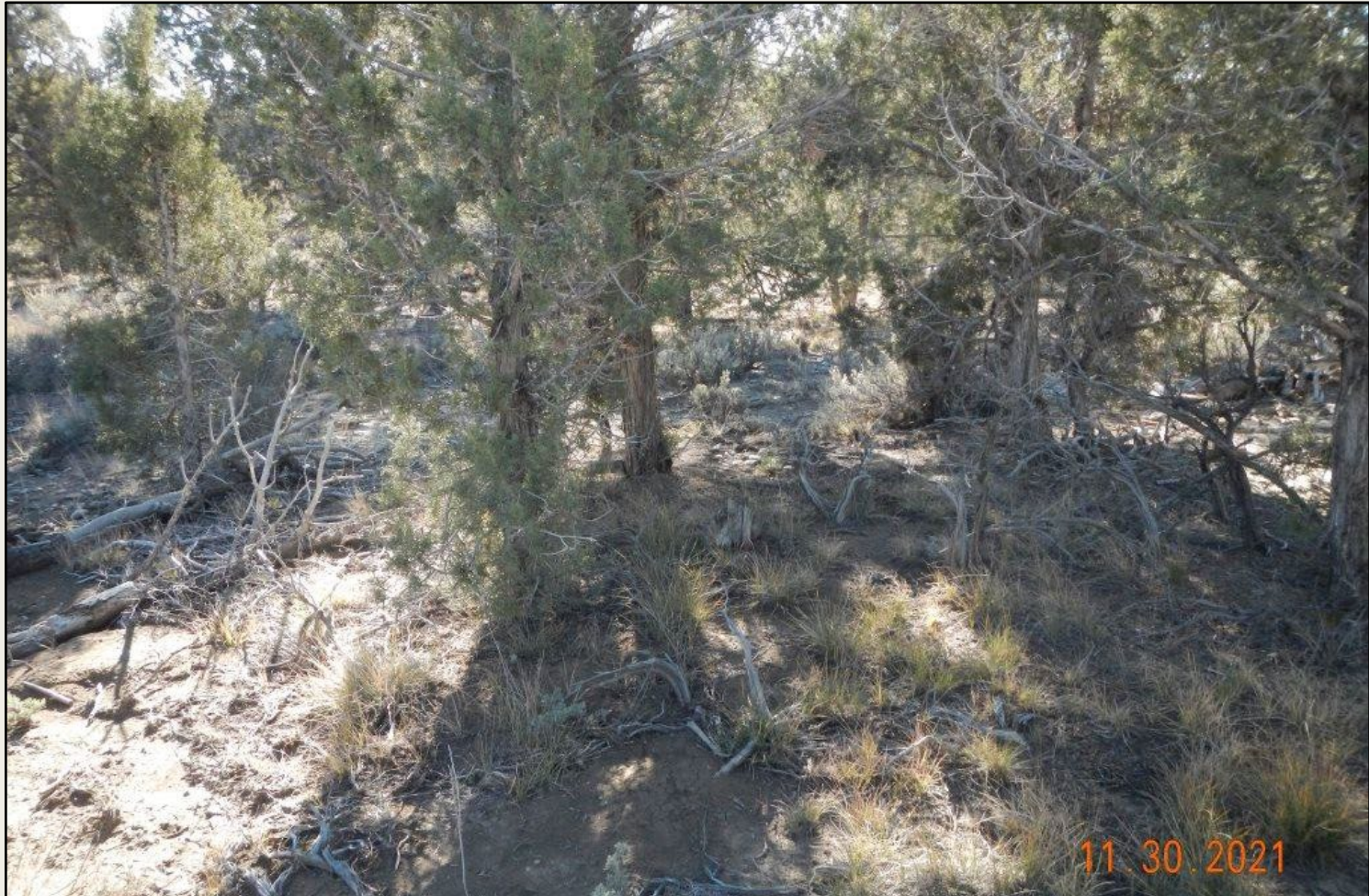
Photo 9. View of reference area comprised of pinyon and juniper woodland with understory of western wheatgrass, Indian ricegrass, black sage, prickly pear, and purple threeawn.