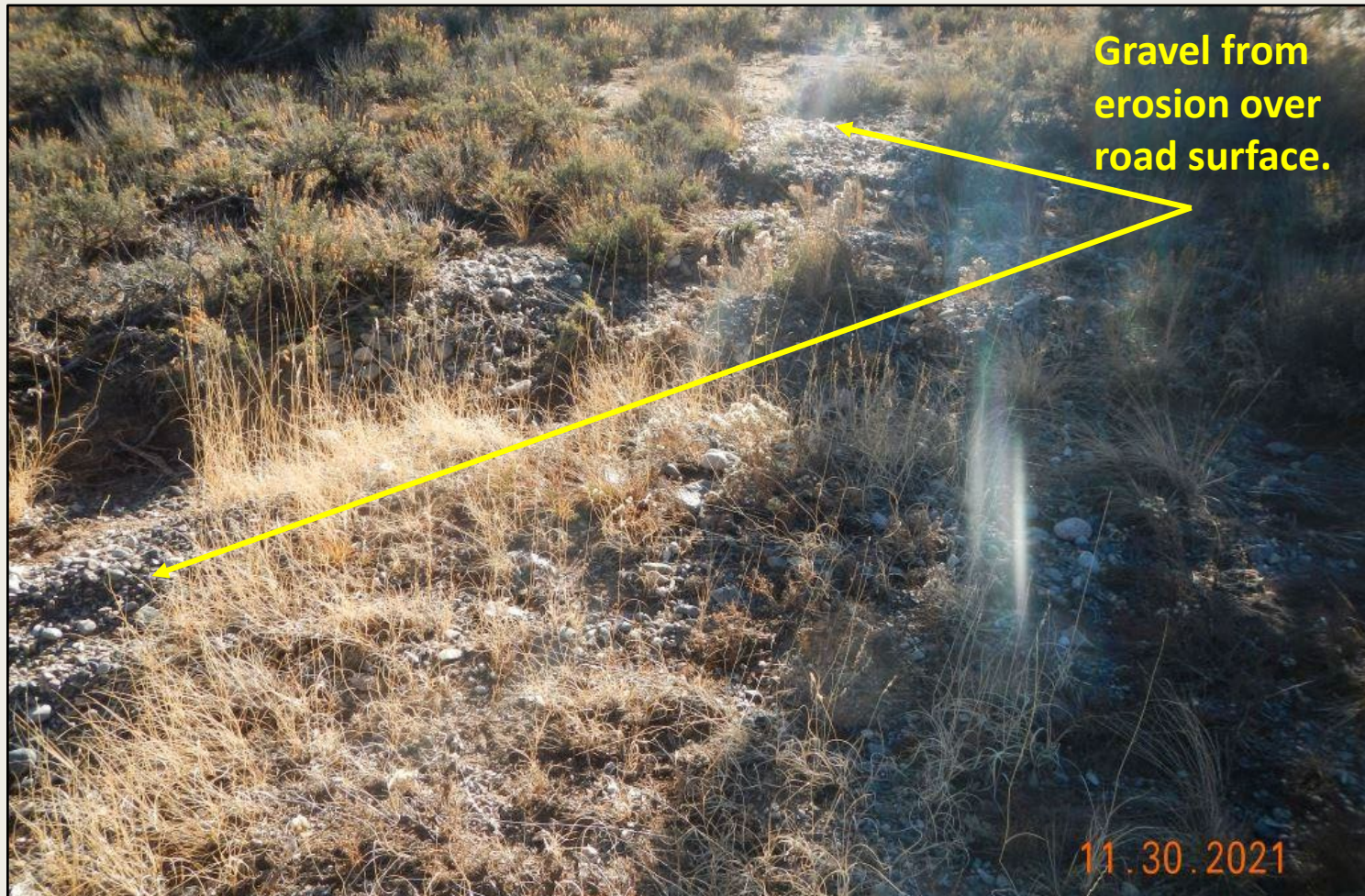
Photo 6. View of area down-slope of erosion on road observed in Photo 5. Stormwater flows have resulted in erosion and gravel deposition.