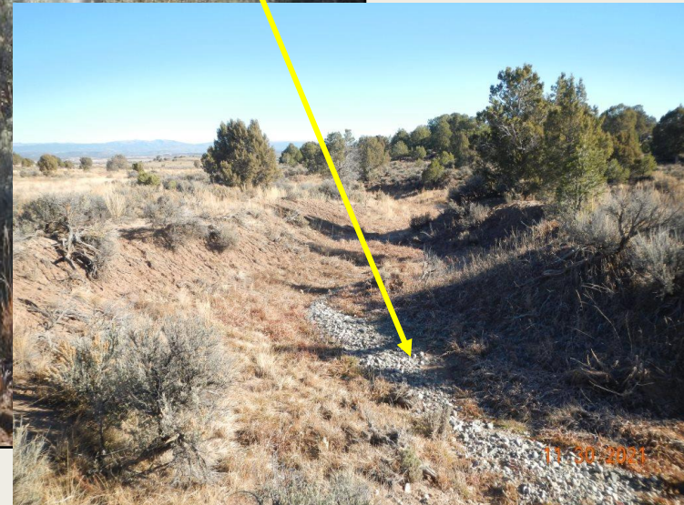
Photo 8. View of area approx. 50 ft down-slope of culvert outlet, where significant volumes (approx. 75ft long, 4-6 ft wide, and 4-6 inches deep) observed within the streambed.