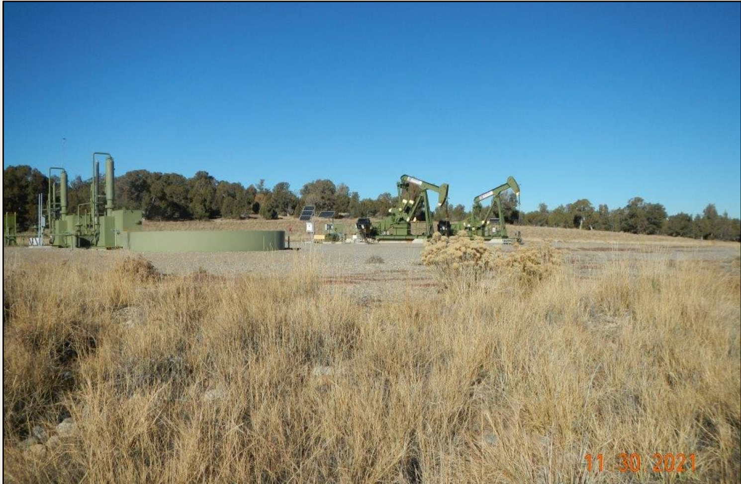
Photo 1. View of the project area from the southeastern corner facing center.