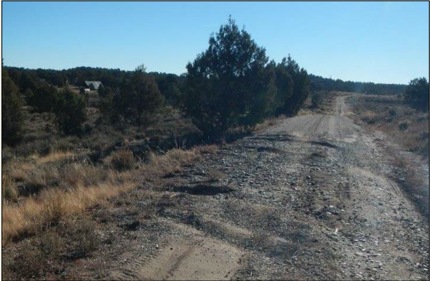
Photo 5. View of erosional scouring and erosion on the access road where stormwater flows are improperly diverted. Approximately 4-6 inches deep of material is eroded off of the road and down-slope.