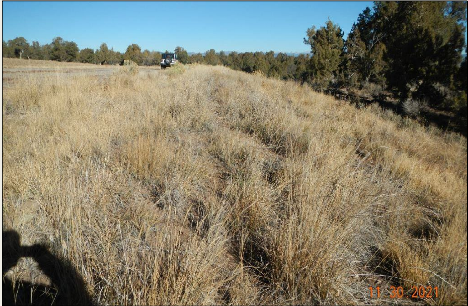
Photo 5. View of the eastern project area from the southeastern corner facing northward.