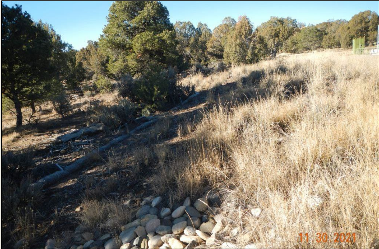
Photo 2. View of the southern fill slope, from the southeastern corner facing westward. Revegetation is progressing with western wheatgrass, crested wheatgrass, smooth brome, and sand dropseed.