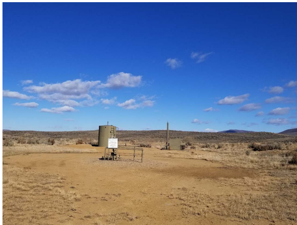
Photo 1. Overview of location taken facing north.