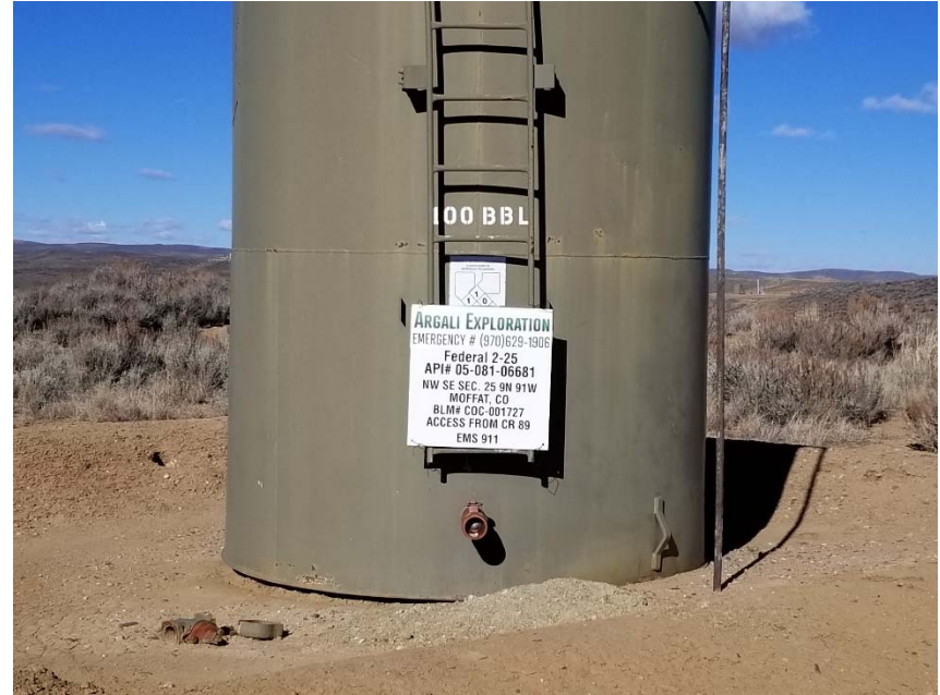
Photo 3. NFPA label faded.