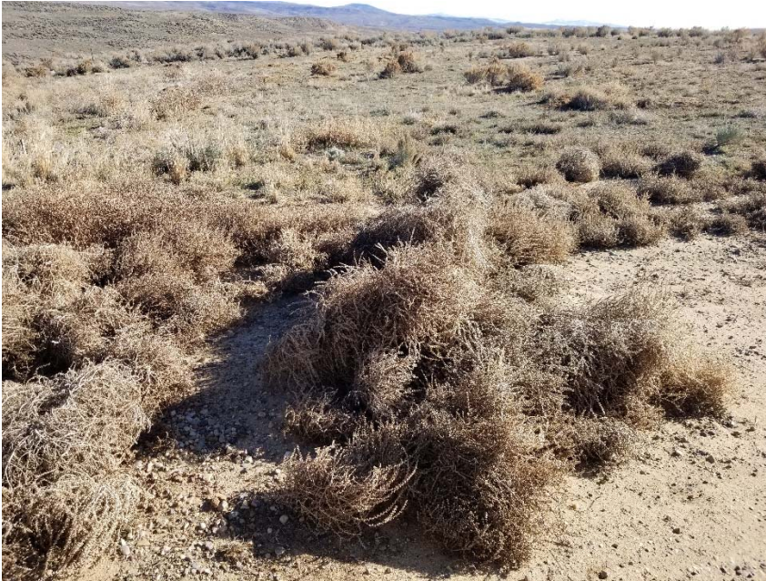
Photo 3. Annual weeds have dried and become debris.