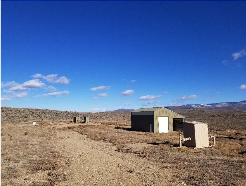
Photo 1. Overview of location taken facing east.