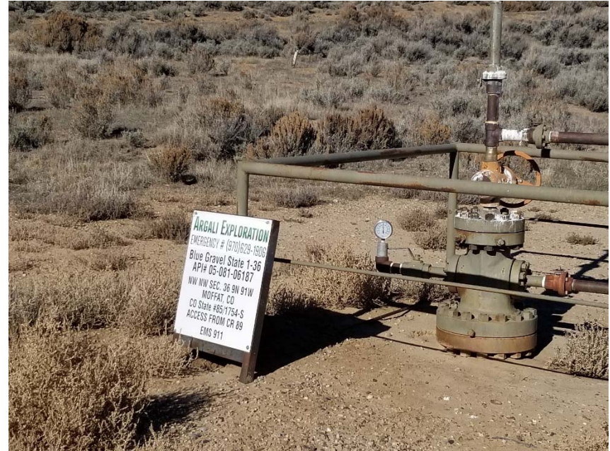
Photo 2. Signs updated.