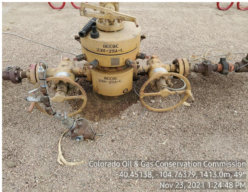
Colorado Oil & Gas Conservation Commission 40.45138, -104.76379, 1413.0m, 49° Nov 23, 2021 1:24:48 PM