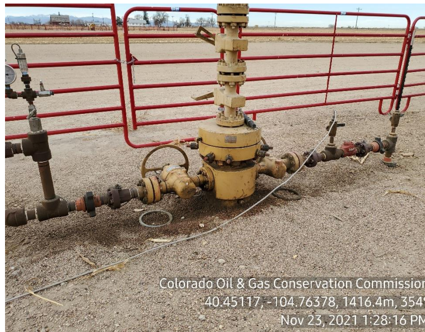
Colorado Oil & Gas Conservation Commission 40.45117, -104.76378, 1416.4m, 354° Nov 23, 2021 1:28:16 PM