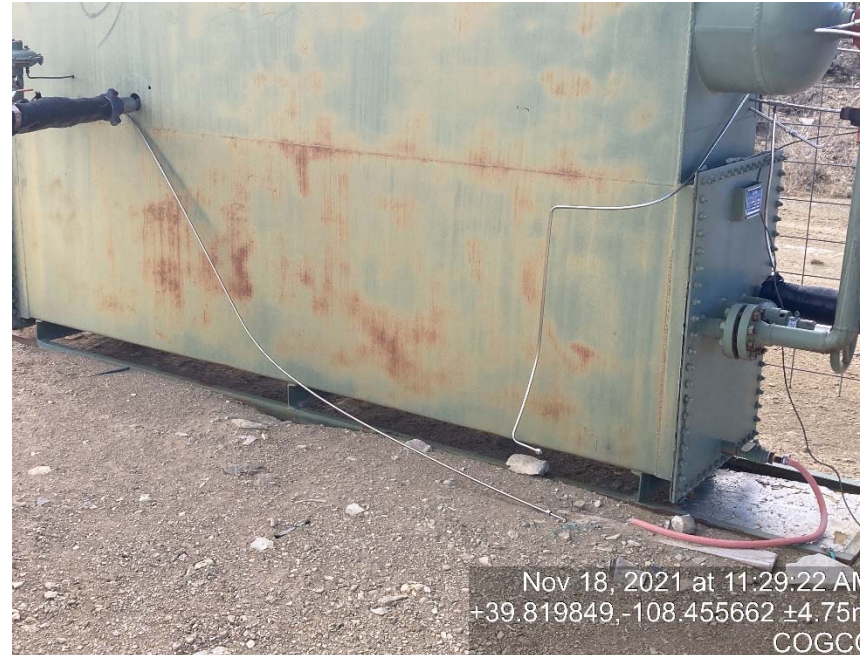
Glycol vessel lacking labeling