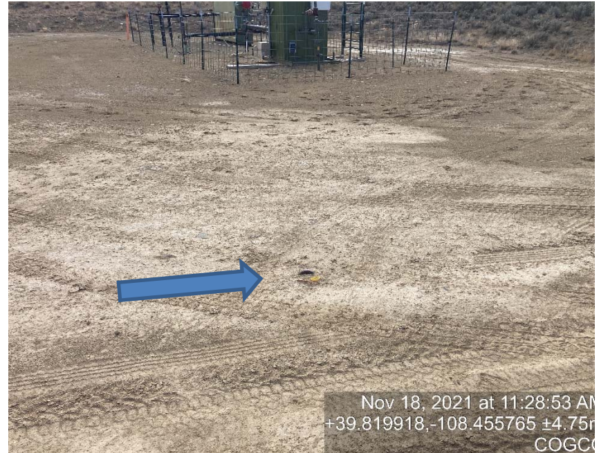
Unmarked dead man