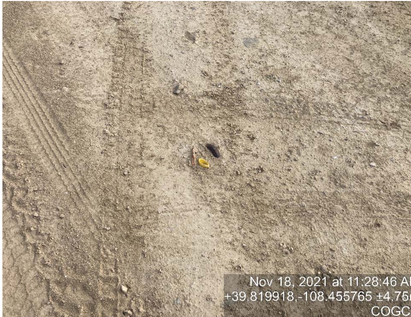
Unmarked dead man