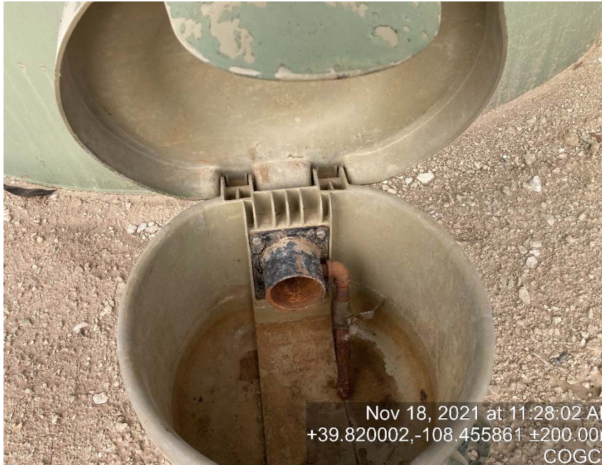
Load out line missing bull plugs/caps