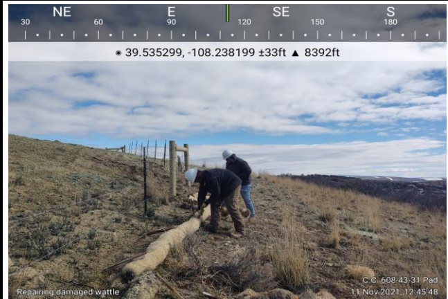
Repairing Existing Wattle Installations