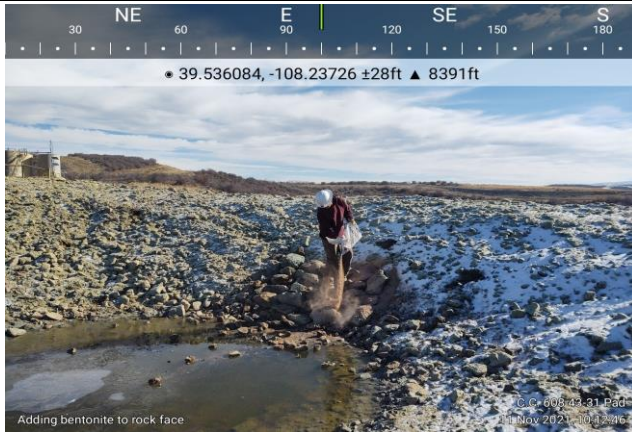
Using Bentonite to Face Pipe Outlet