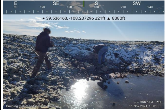
Installing Rock Armor on Pipe Outlet Face