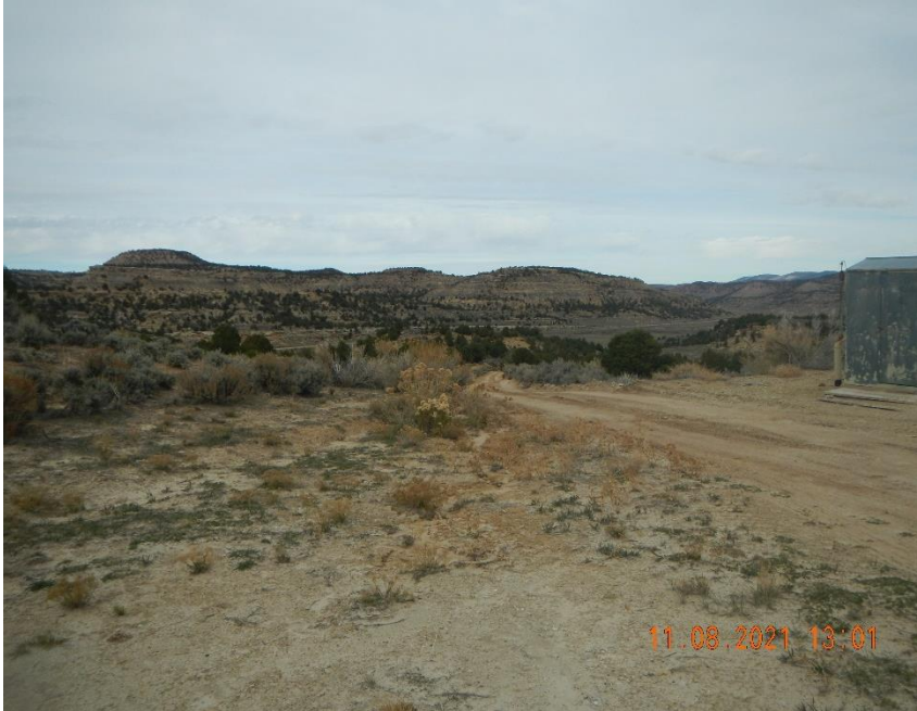
Storm water rill running off location into road ditch.