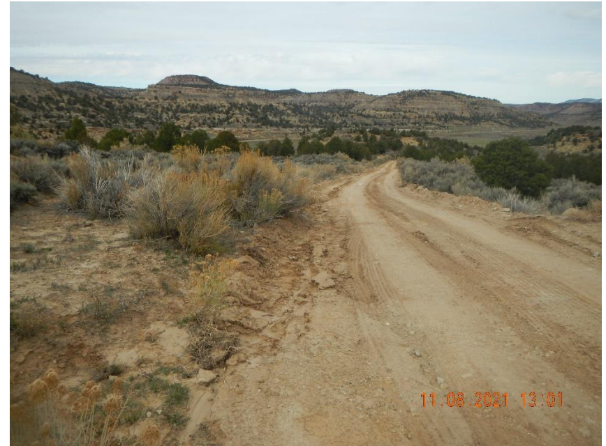
Ditch from location to main road needs maintained.