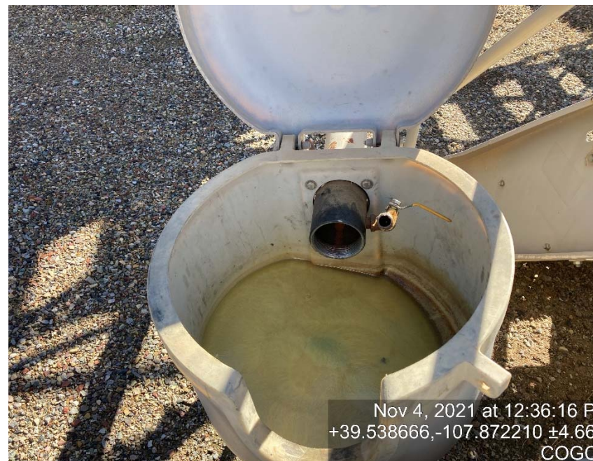
Load line missing bull plug/cap