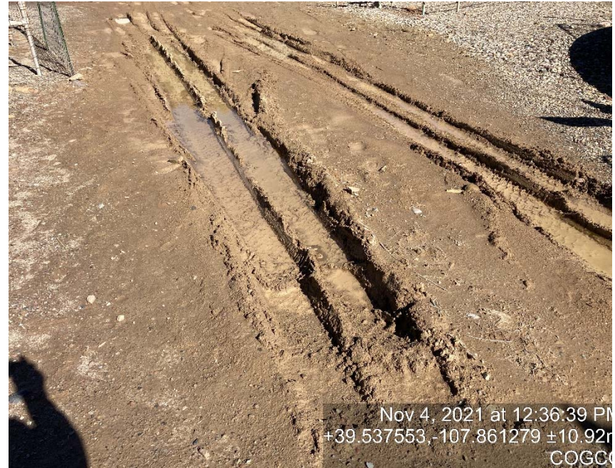
Lack of stabilization/compaction