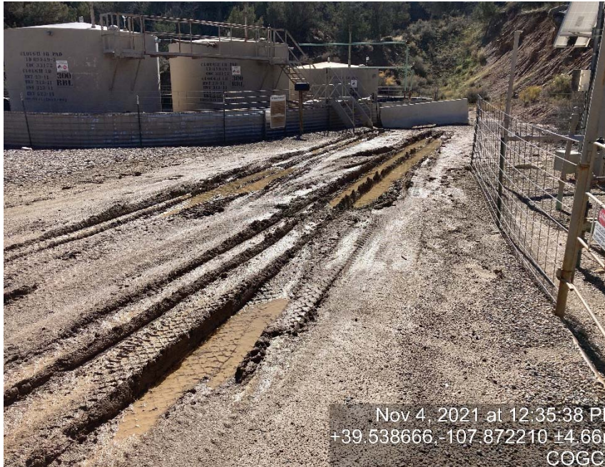
Lack of stabilization/compaction