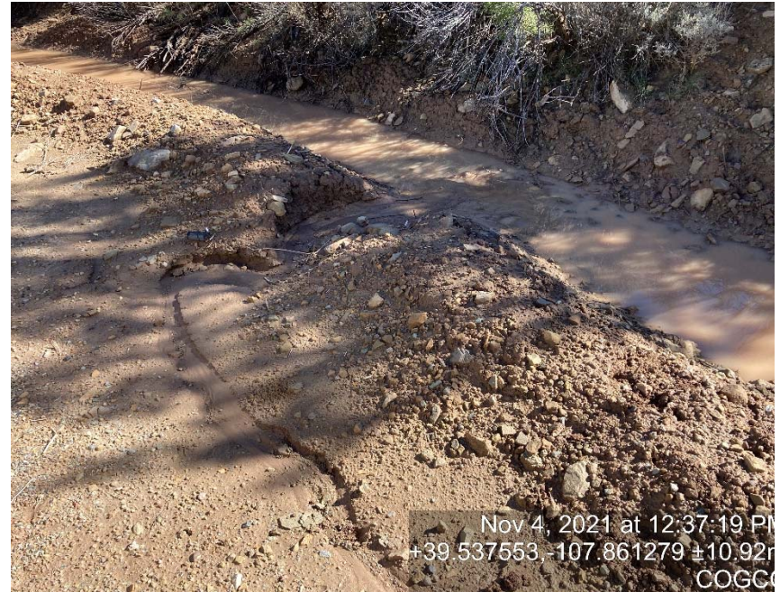
Berm is failing