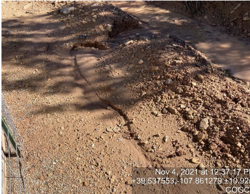
Berm is failing