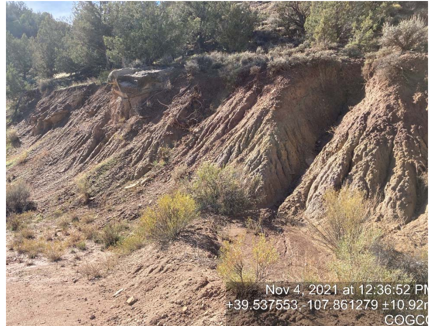
Cut slope erosion