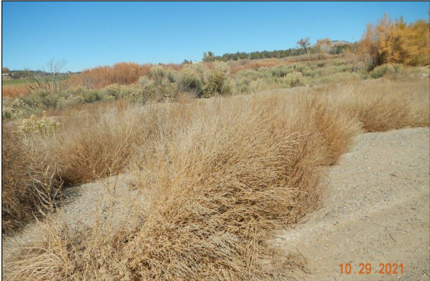
Photo 2. View of kochia debris, up to 4 feet tall, growing on the well pad.