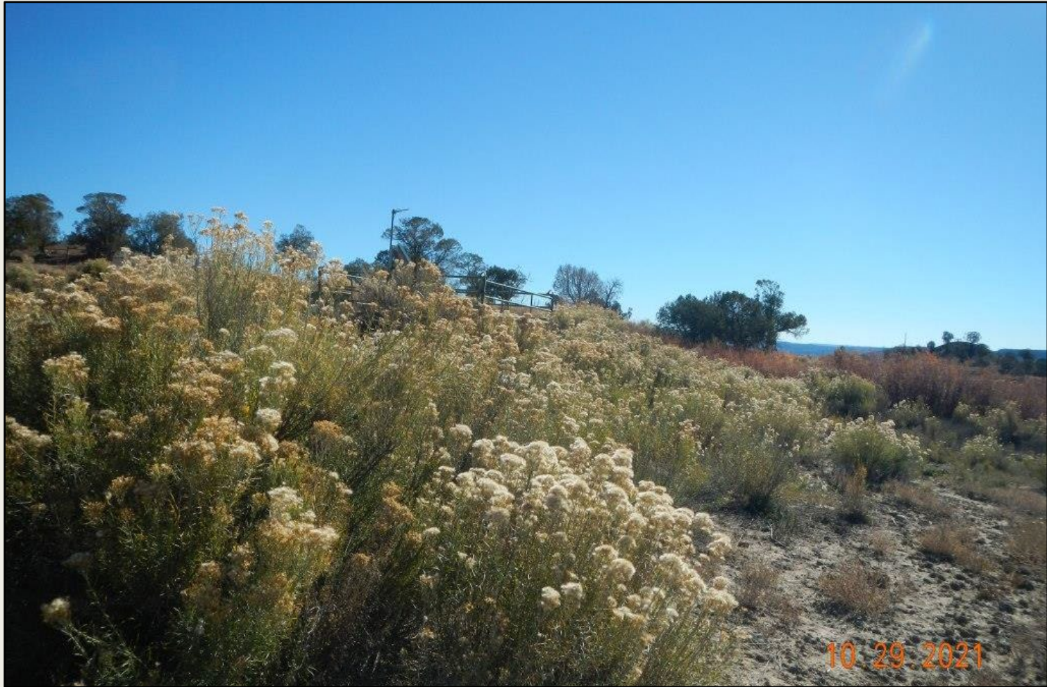
Photo 3. View of the southern fill slope from the southwestern corner facing eastward. Revegetation is progressing with rubber rabbitbrush, western wheatgrass, and squirreltail.