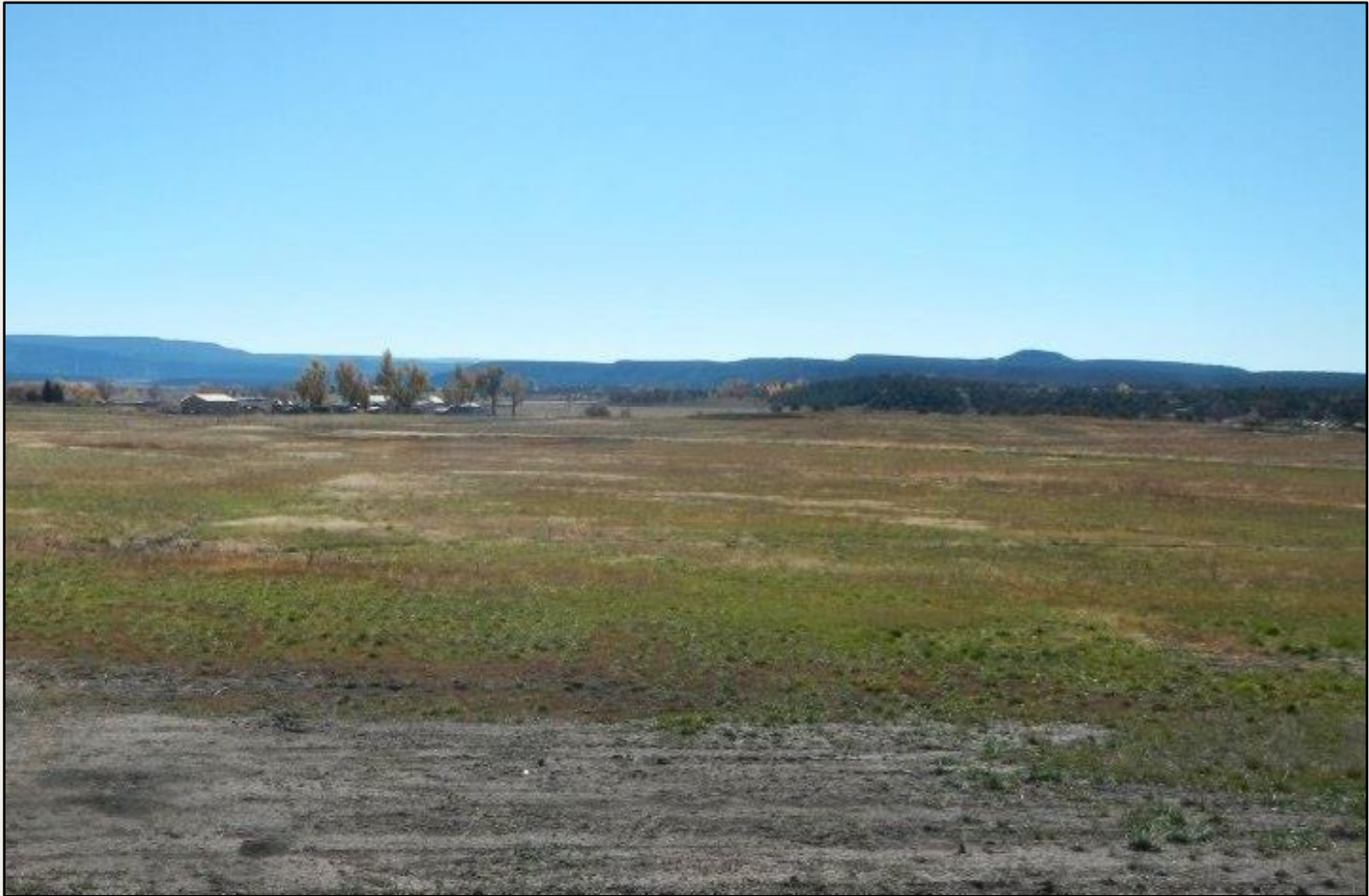
Photo 6. View of reference area comprised of open grass field, largely in a grazed vegetative condition, with grasses such as western wheatgrass and smooth brome.