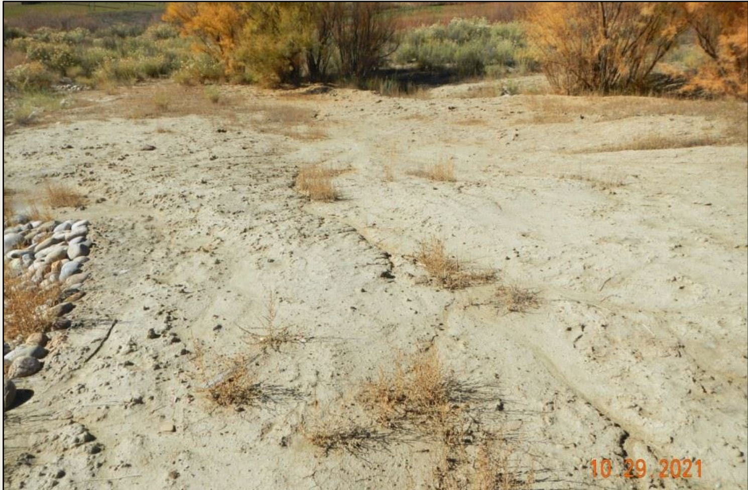
Photo 5. View of area in the northwestern project area, approximately 50ft wide and long, where bare soils are eroding and need to be stabilized.