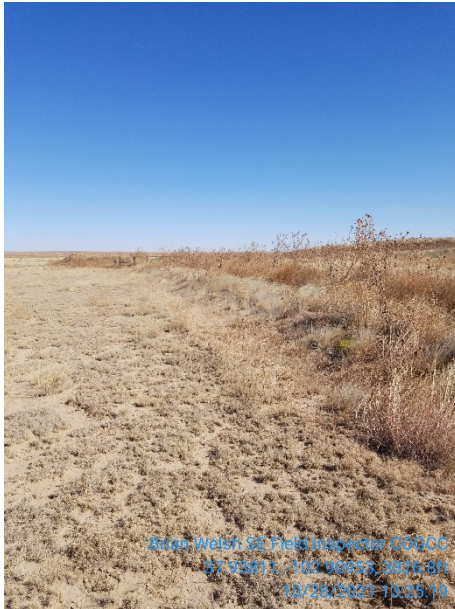
3. Access to location