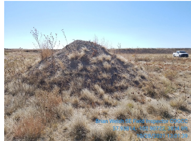
7. Pile of gravel on location