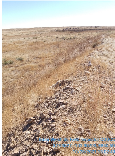
4. East side of location looking south