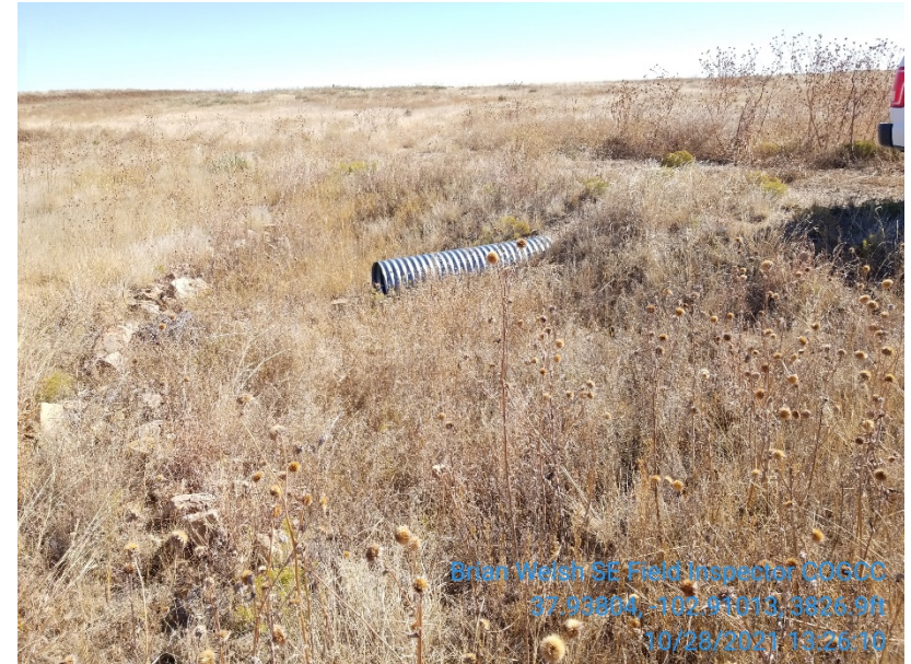
2. Culvert installed on access