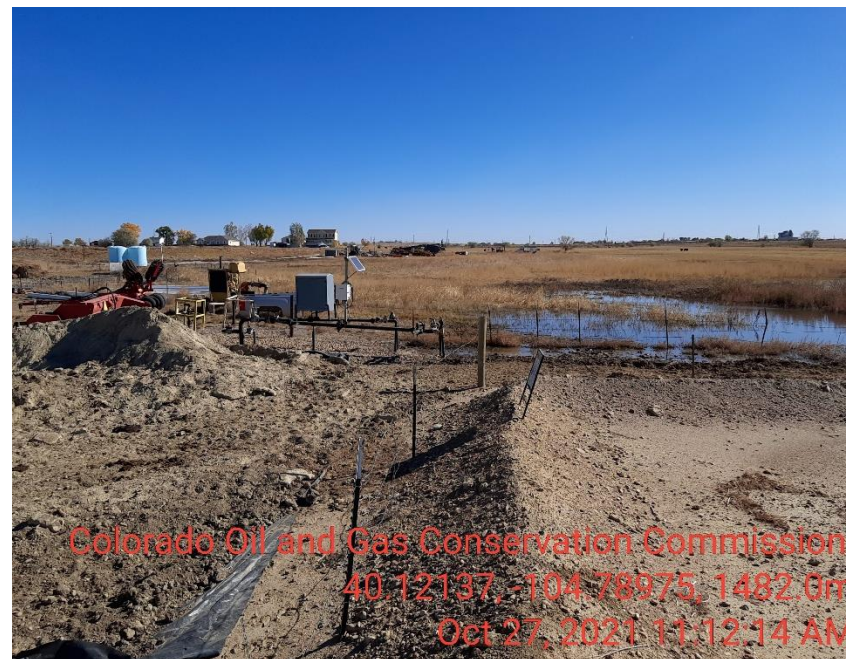
Photo 18 No BMP's around contaminated soil pile