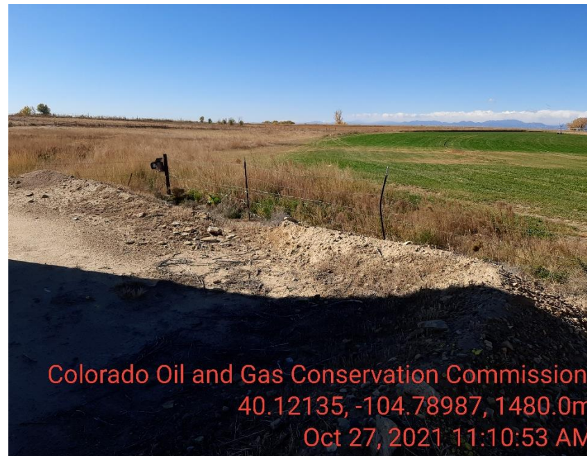
Photo 14 inadequate berm around crude oil tanks.