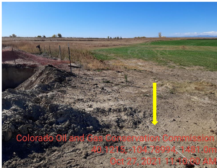
Photo 11 improper BPM’s sediment not being contained and leaving location onto adjacent field. Arrow is electric fence.