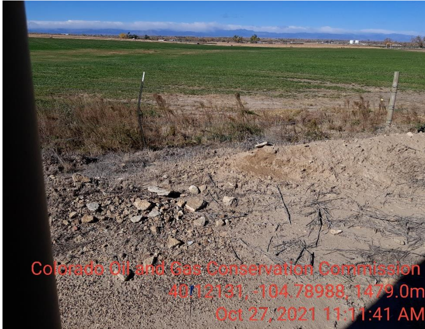
Photo 15 inadequate berm around crude oil tanks sediment leaving location.