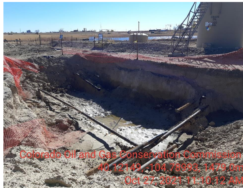
Photo 12 open excavation.