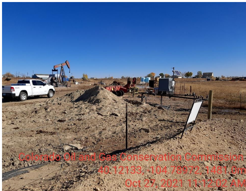
Photo 17 No BMP's around contaminated soil pile