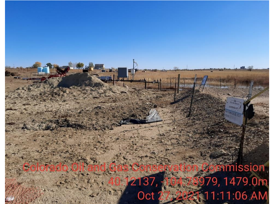
Photo 16 What appears to be contaminated soil on compromised liner with no BMP's