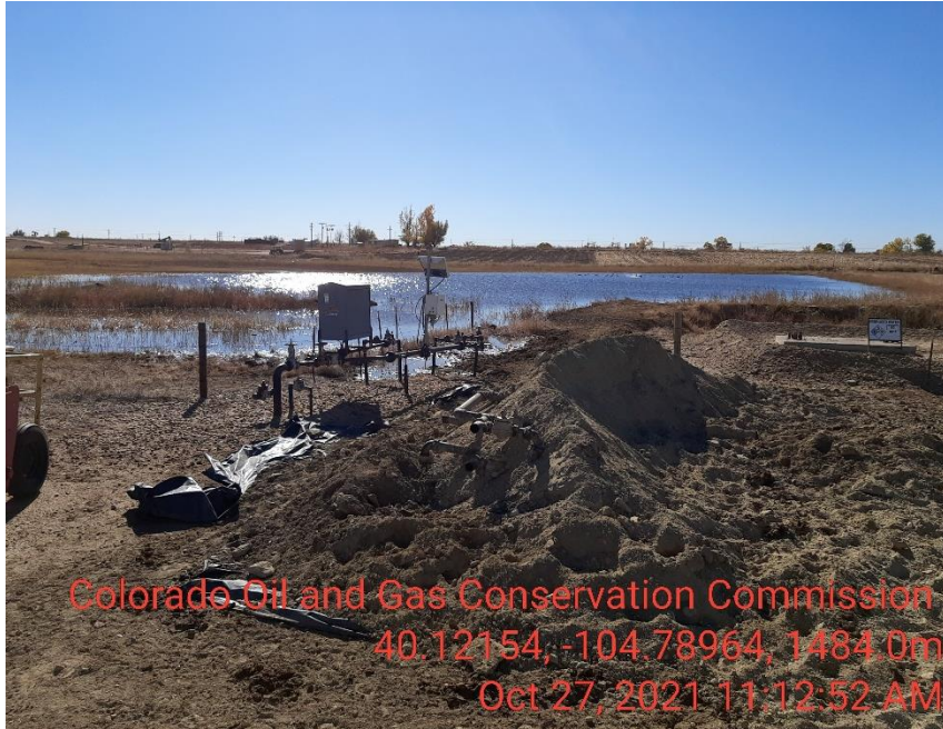
Photo 19 No BMP's around contaminated soil pile surface water is approx 5FT for unprotected pile.