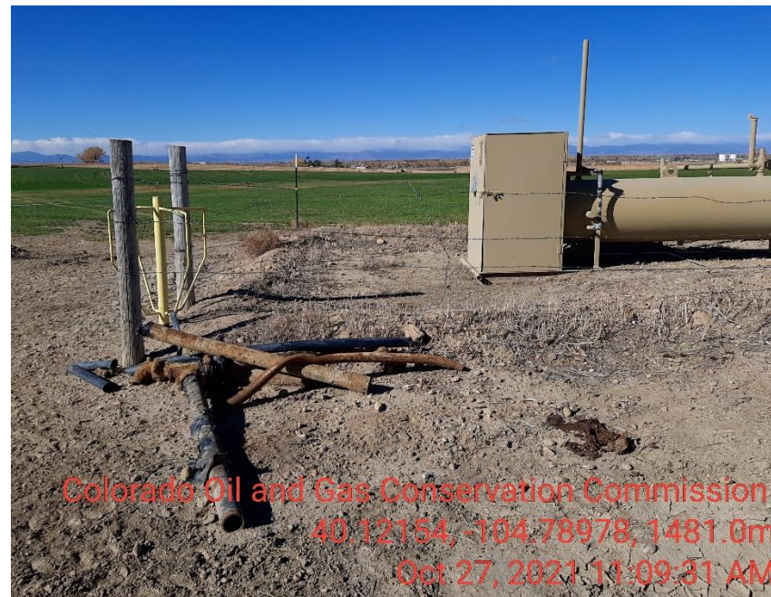
Photo 8 Trash piping removed from excavation.