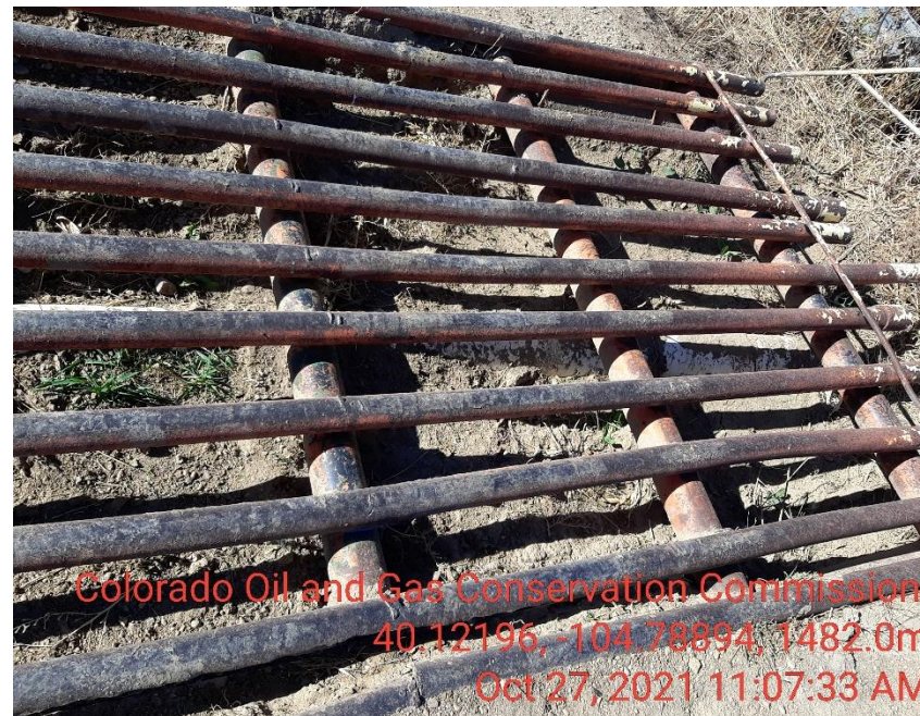
Photo 2 Tracking pad cattle guard not properly maintained full of sediment.