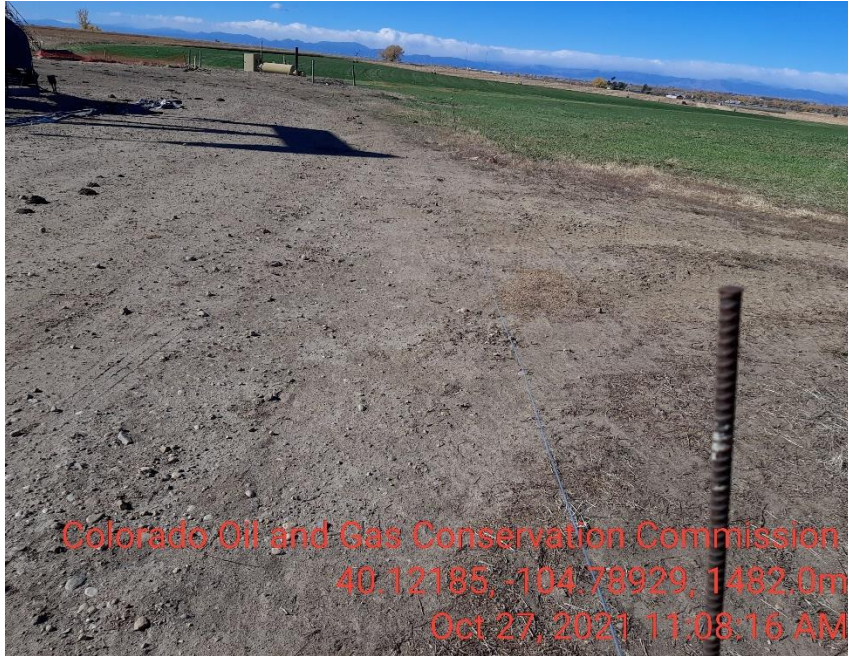
Photo 5 Land owner installed electric fence to keep livestock out of open excavation.