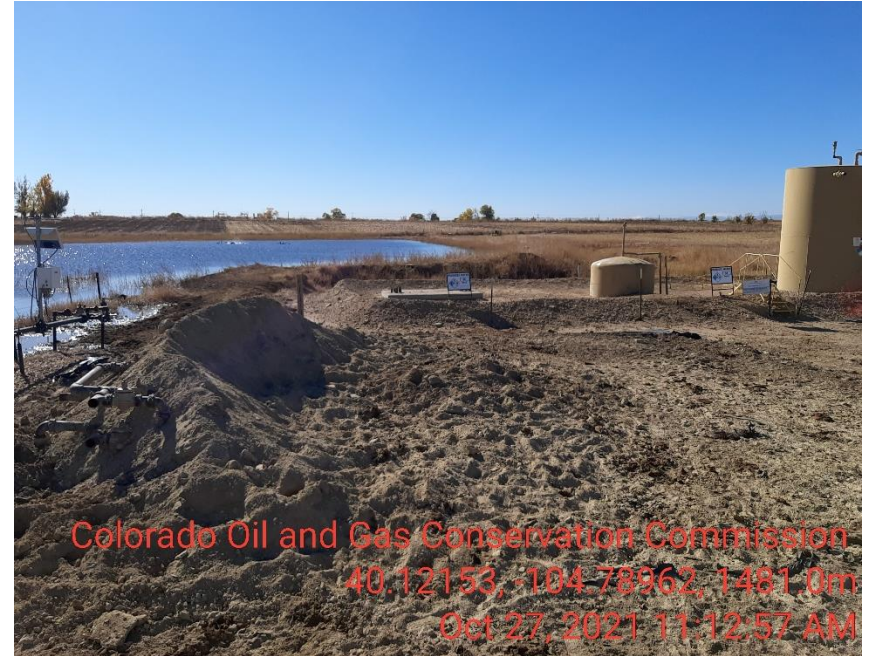
Photo 20 not fencing around contaminated pile to keep livestock from spreading material on location and into waterway,