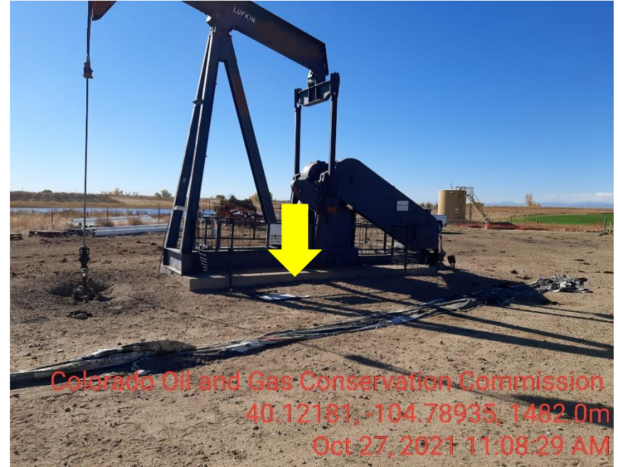
Photo 4 new well head sign not properly installed laying on the ground.