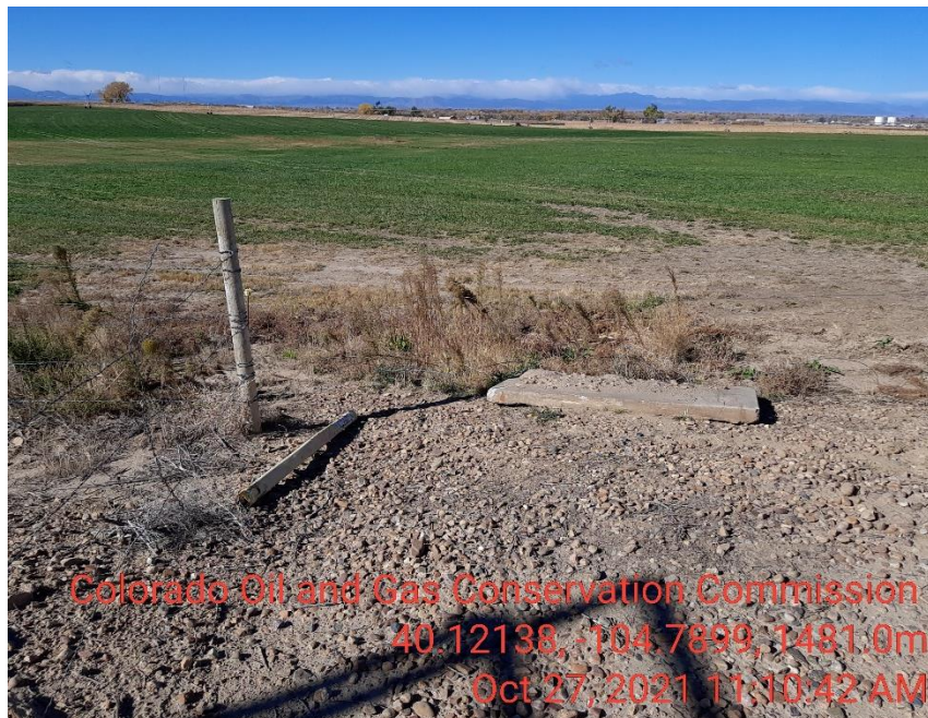
Photo 13 Debris and sediment leaving location from excavated area.