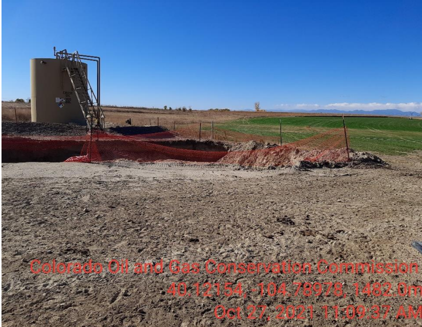
Photo 9 improper BMP’s around open excavation. Improper fencing of open excavation.