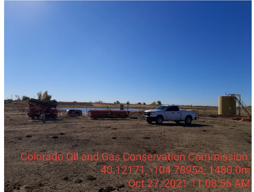
Photo 6 loc pic