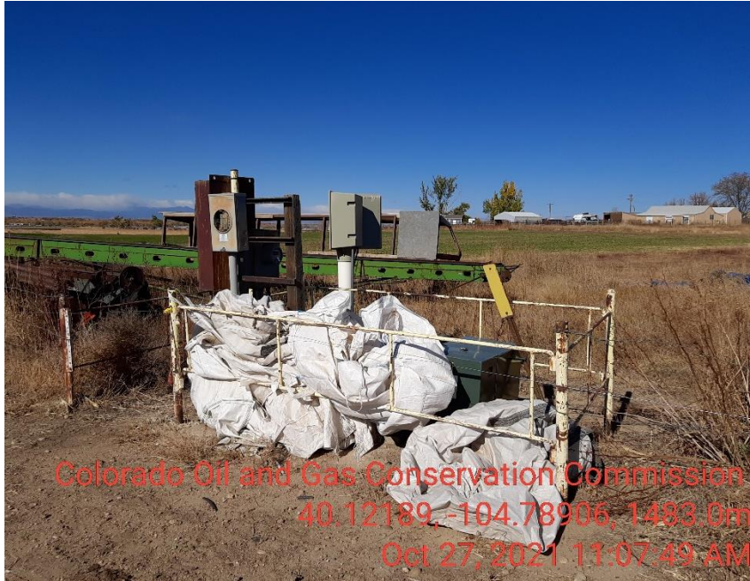
Photo 3 Trash and unused mechanical issue, electric panel has no meter.