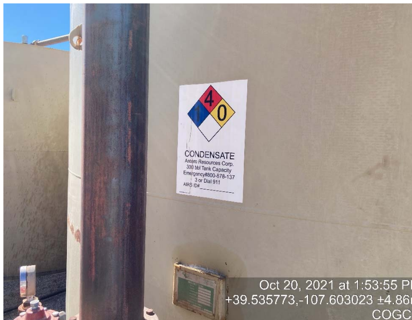
Tank label has wrong operator, quantity, etc.