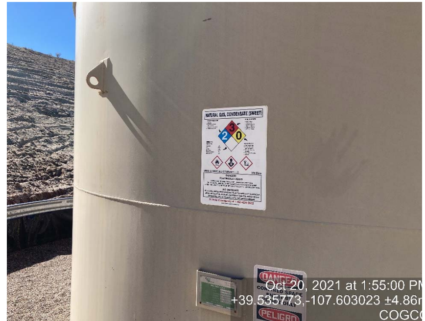
Follow up inspection, tank label has wrong operator and quantity is too small to read at distance