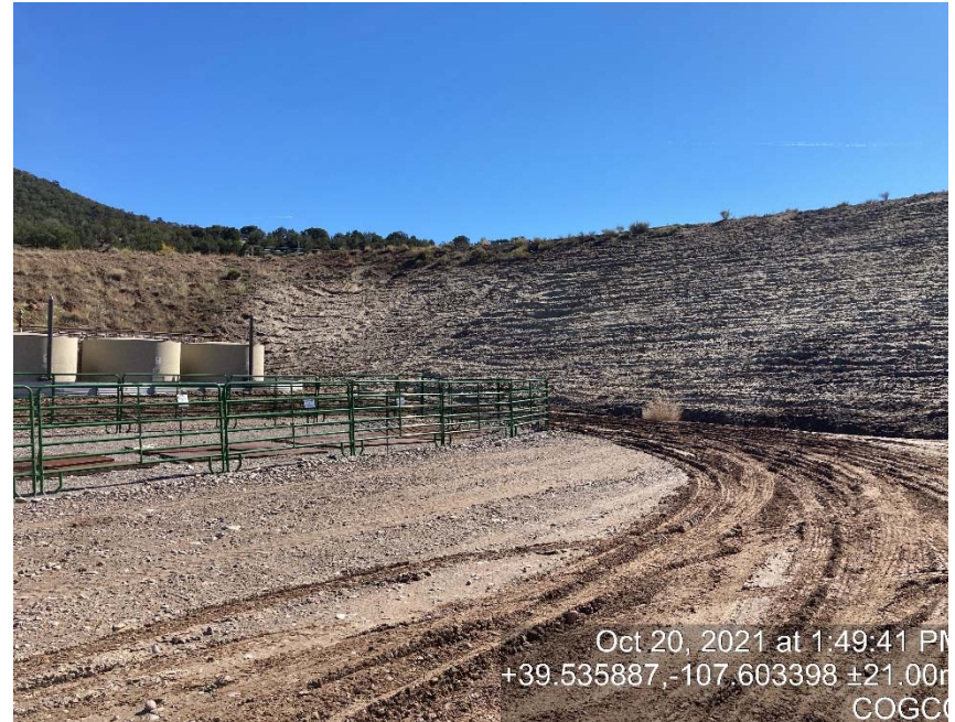
Follow up inspection of cut slope