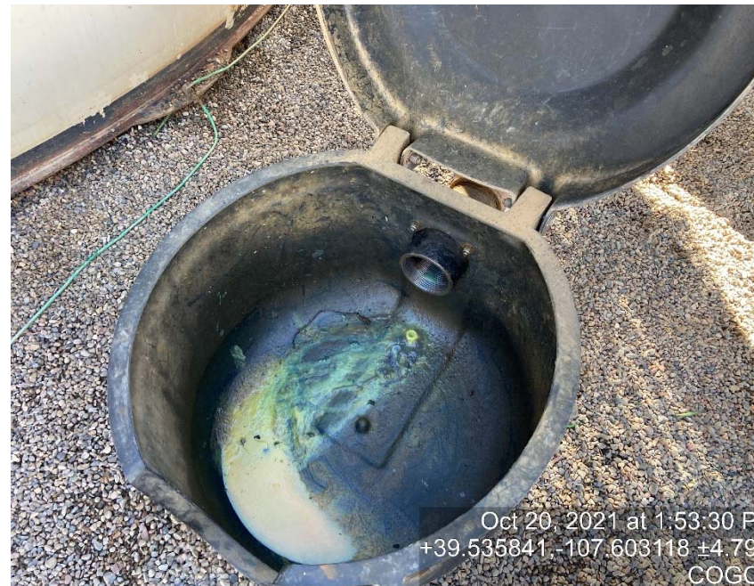
Lack of bull plug/cap