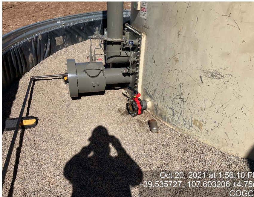
Lack of bull plug/cap