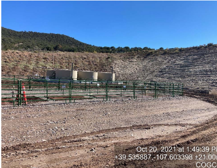
Follow up inspection of cut slope