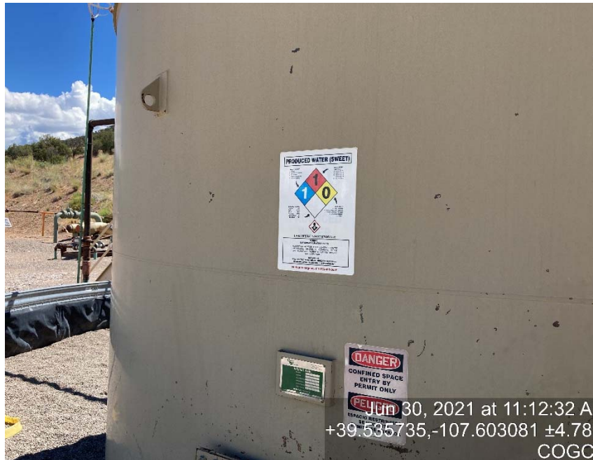
Previous inspection of labels