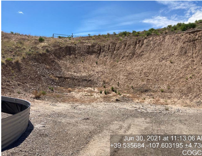
Previous inspection of cut slope