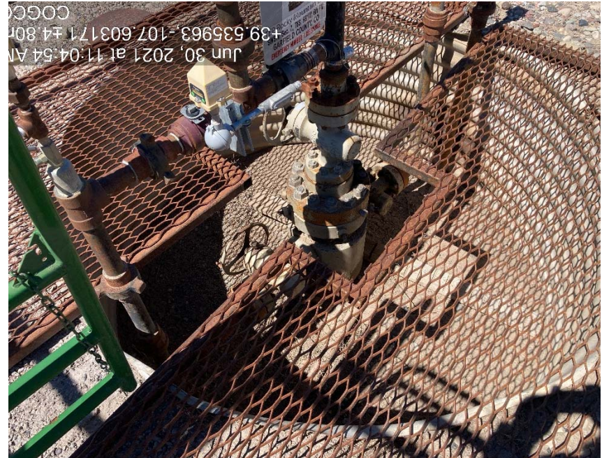
Previous inspection of wildlife boards