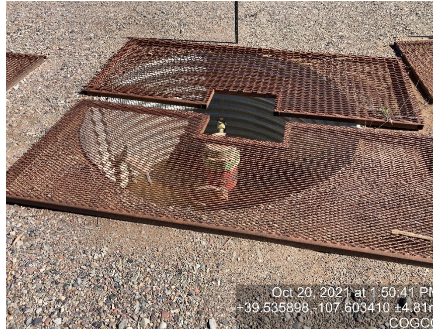
Follow up inspection of wildlife boards