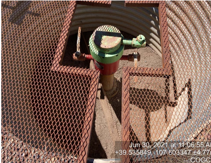
Previous inspection of wildlife boards