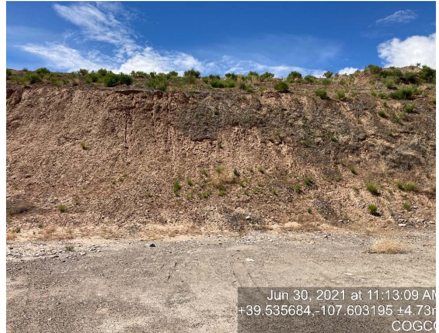
Previous inspection of cut slope