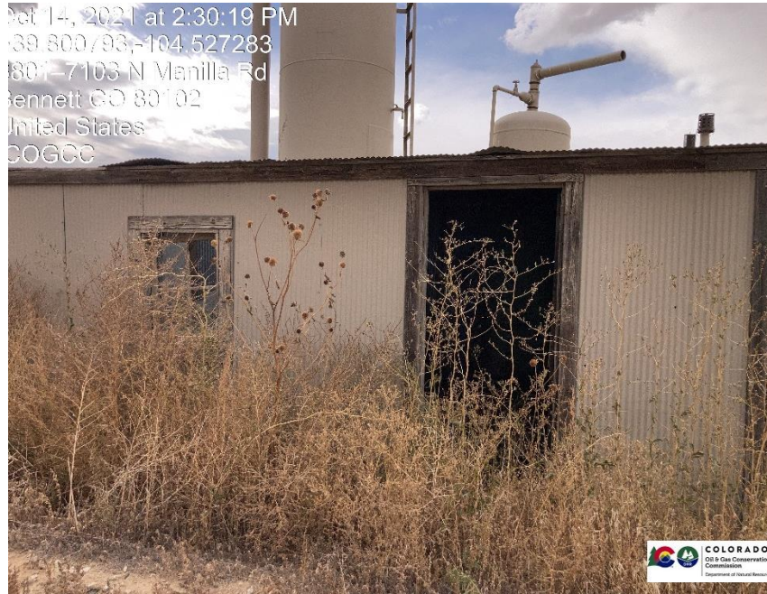
Pic 5 vertical Separator weeds unmanaged, unable to inspect inside of separator house due to weed growth