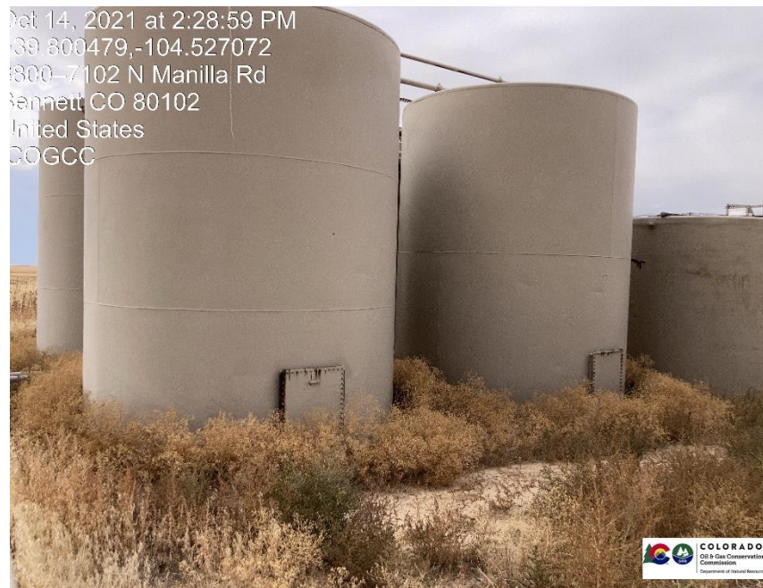
Pic 1 tanks