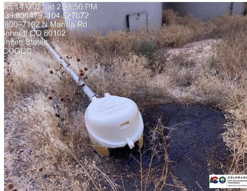
Pic 2 stained soil near load out line.