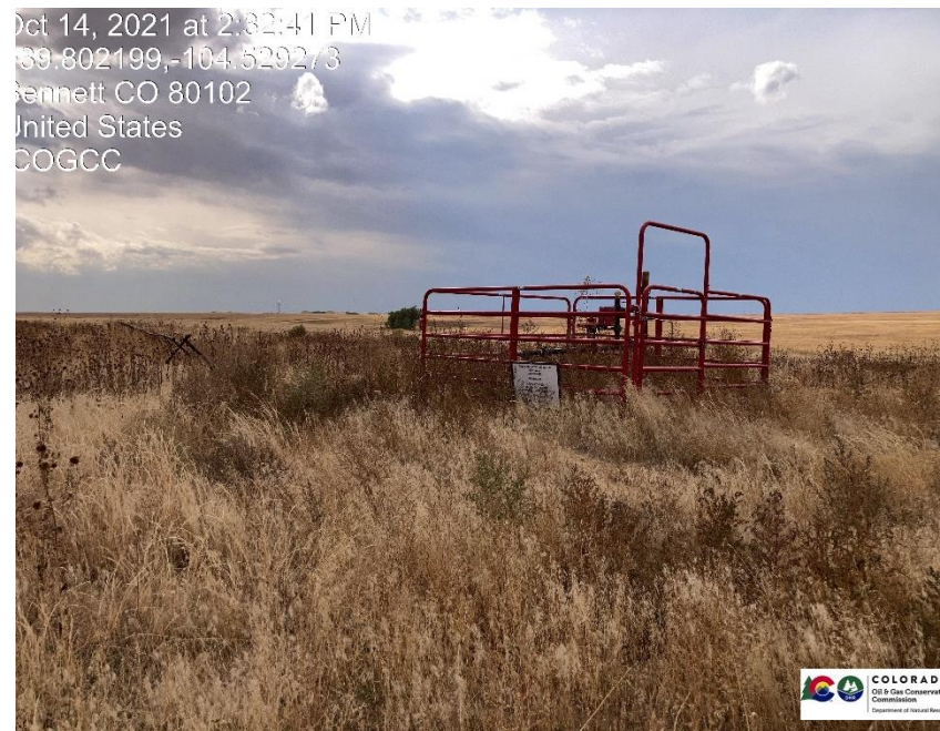
Pic 8 wellhead weeds unmanaged.