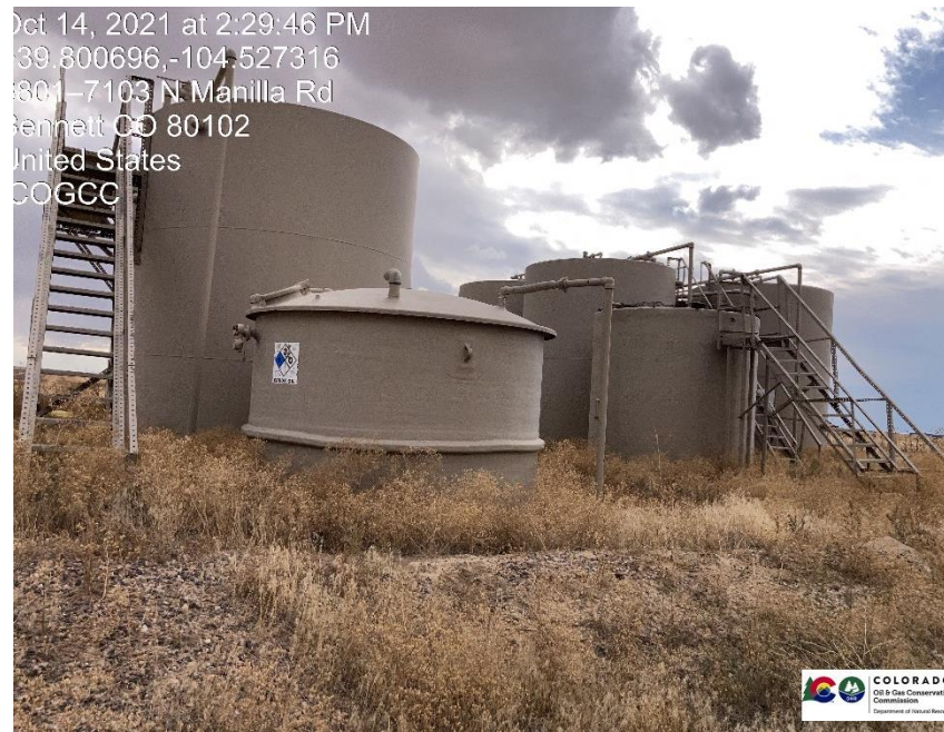
Pic 4 open top tank unable to inspect due to weeds.

Oct 14, 2021 at 2:29:46 PM 39.800696,-104.527316 801-7103 N Manilla Rd Bennett CO 80102 United States COGCC