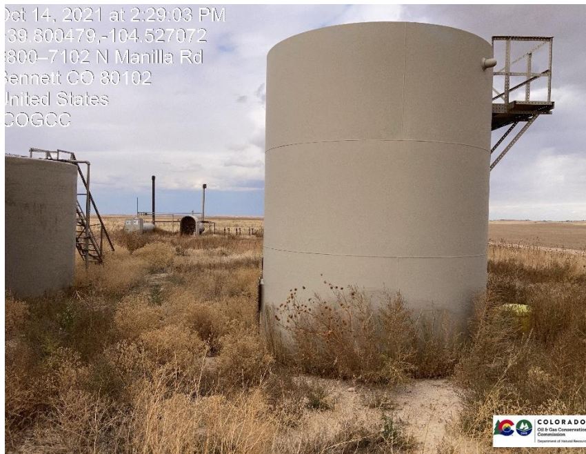
Pic 3 tanks weeds unmanaged on location

Oct 14, 2021 at 2:29:03 PM 39.800479,-104.527072 800-7102 N Manilla Rd Bennett CO 80102 United States COGCC