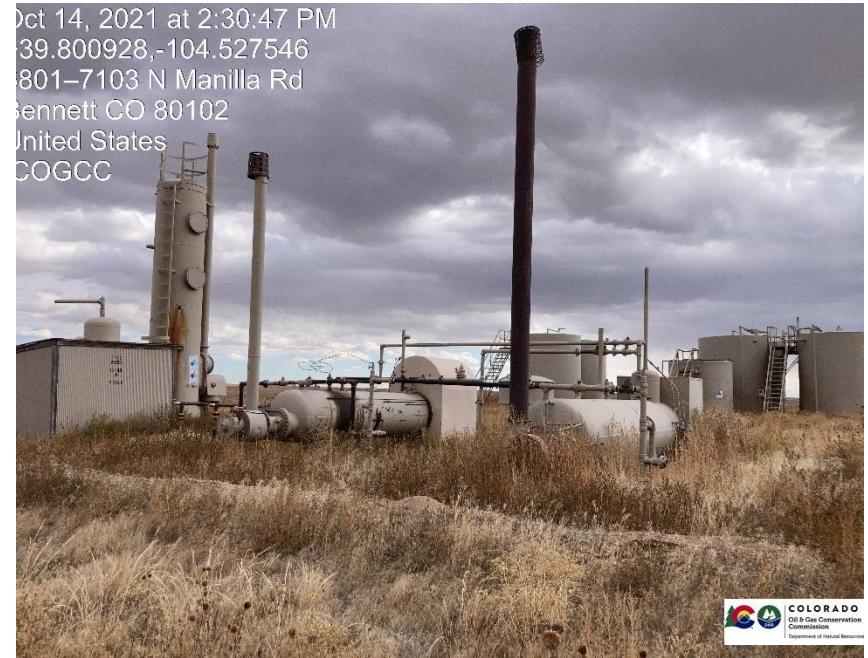
Pic 6 Horizontal separators, weeds unmanaged.