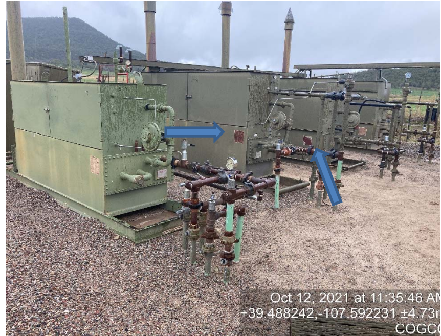
Some glycol labels are not legible