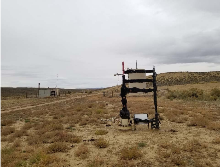
Photo 1. Overview of location taken facing west. Annual weeds drying on location.