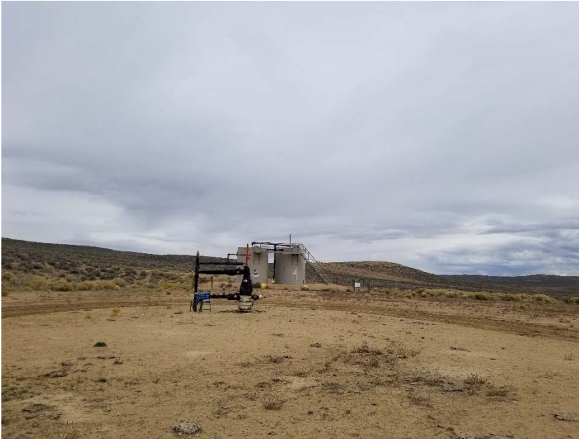
Photo 1. Overview of location taken facing north.