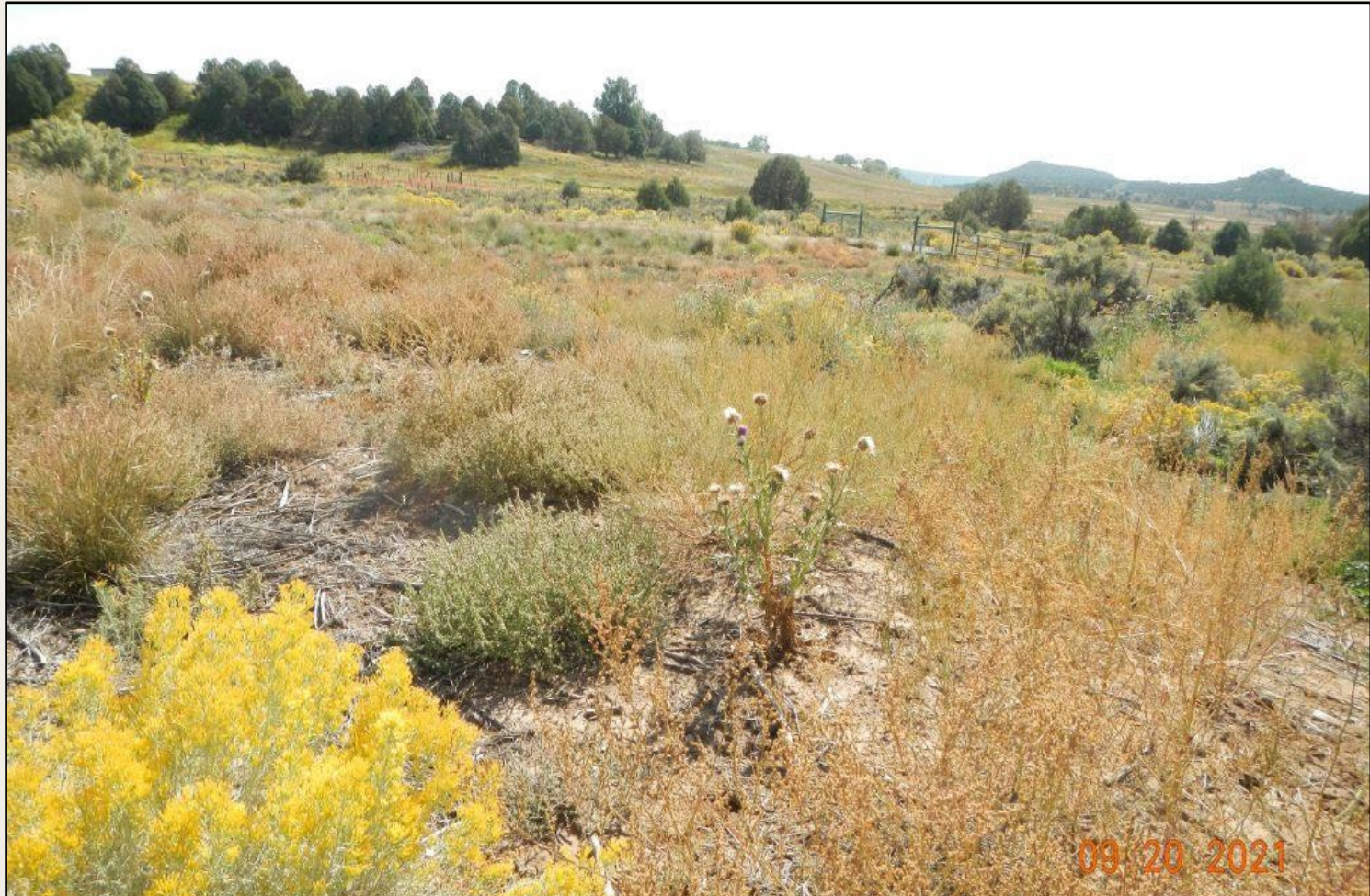
Photo 3. View of the southern project area from the southwestern corner facing eastward. Approximately 150 musk thistles, kochia, and Russian thistle weeds present. Little desirable vegetation here.