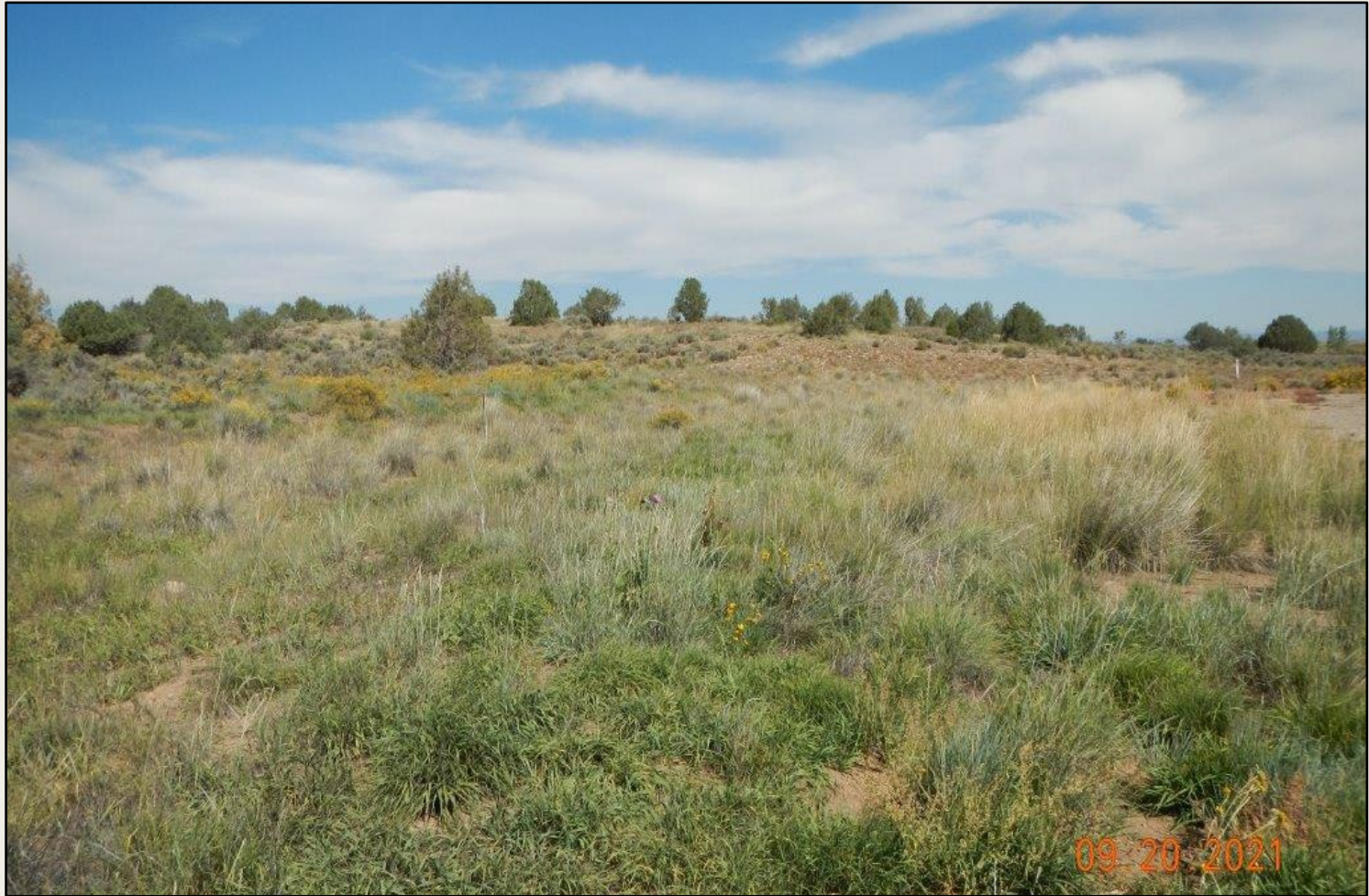
Photo 2. View of western project area from the southwestern corner facing northward. Revegetation is progressing with smooth brome, bluebunch wheatgrass, western wheatgrass, and fringed sage.