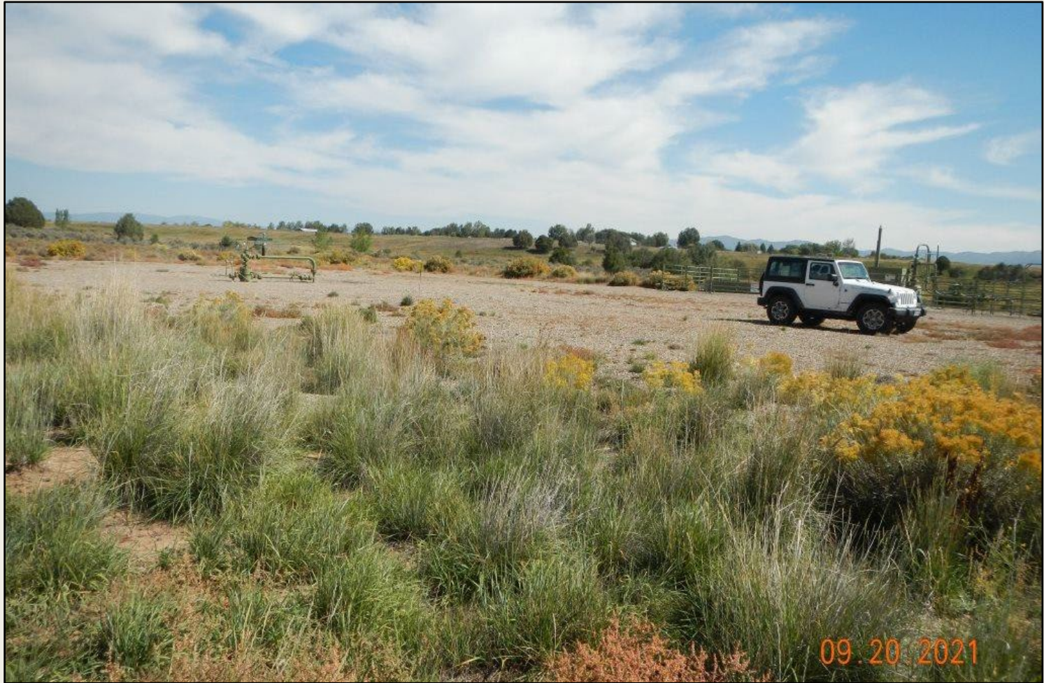
Photo 1. View of project area from the southwestern corner facing center.