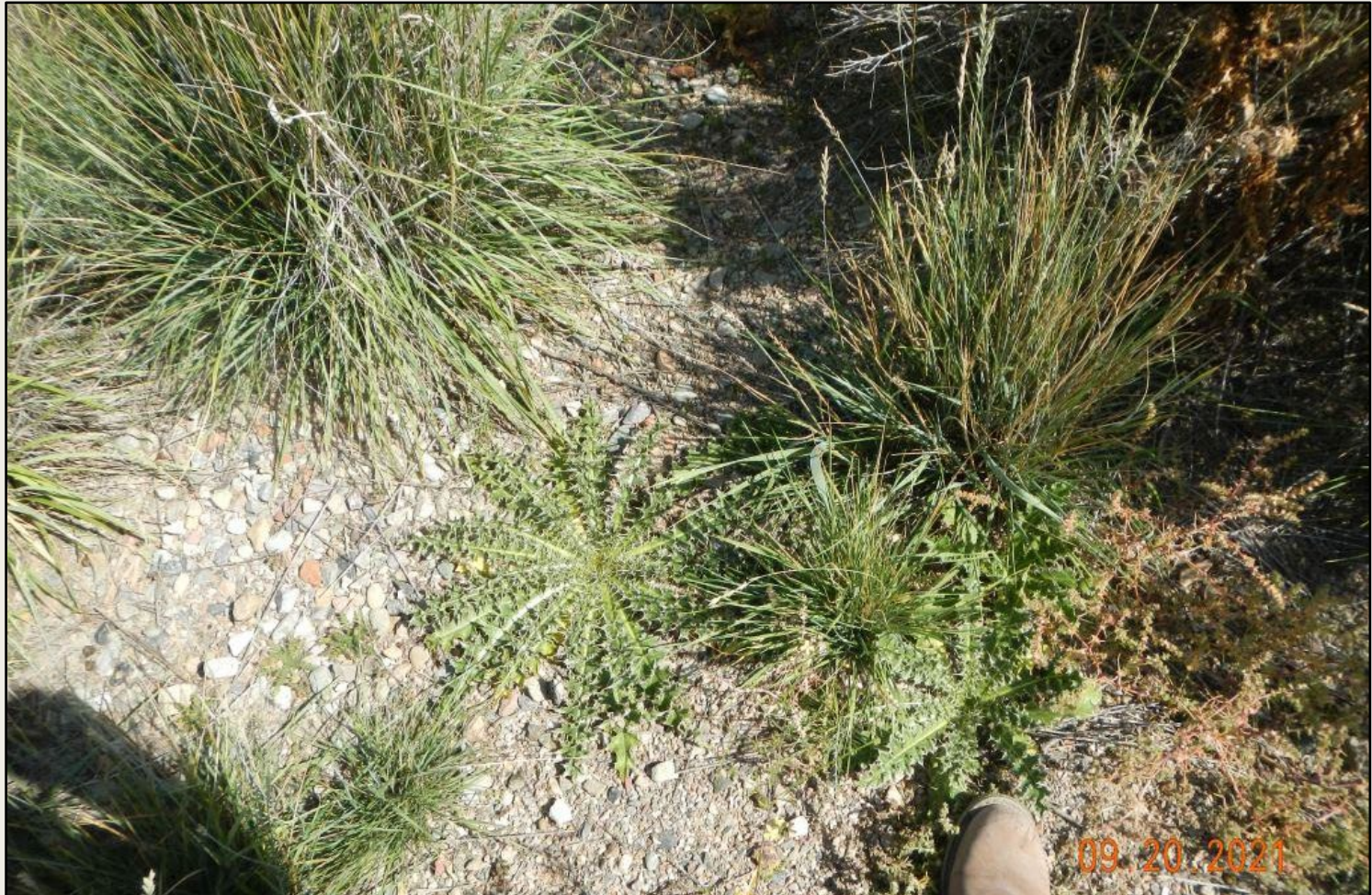
Photo 4. View of musk thistle rosettes (next to boot) within the southwestern project area.