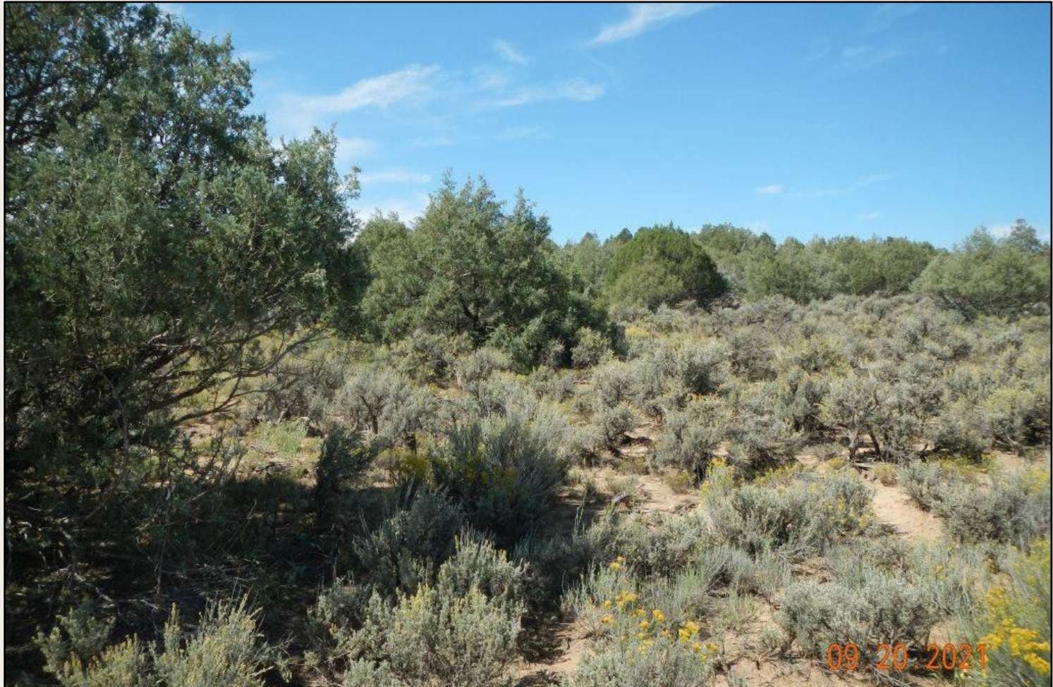
Photo 7. View of reference area comprised of sagebrush shrubland and pinyon/juniper woodland with James galleta, rubber rabbitbrush, snakeweed, Indian paintbrush, and squirreltail.