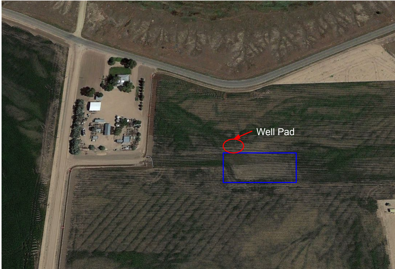
Photo 1. 2019 aerial imagery of the well pad (north is up). Tank battery (highlighted in blue) is associated with well API # 123-18878 not pictured to the south.