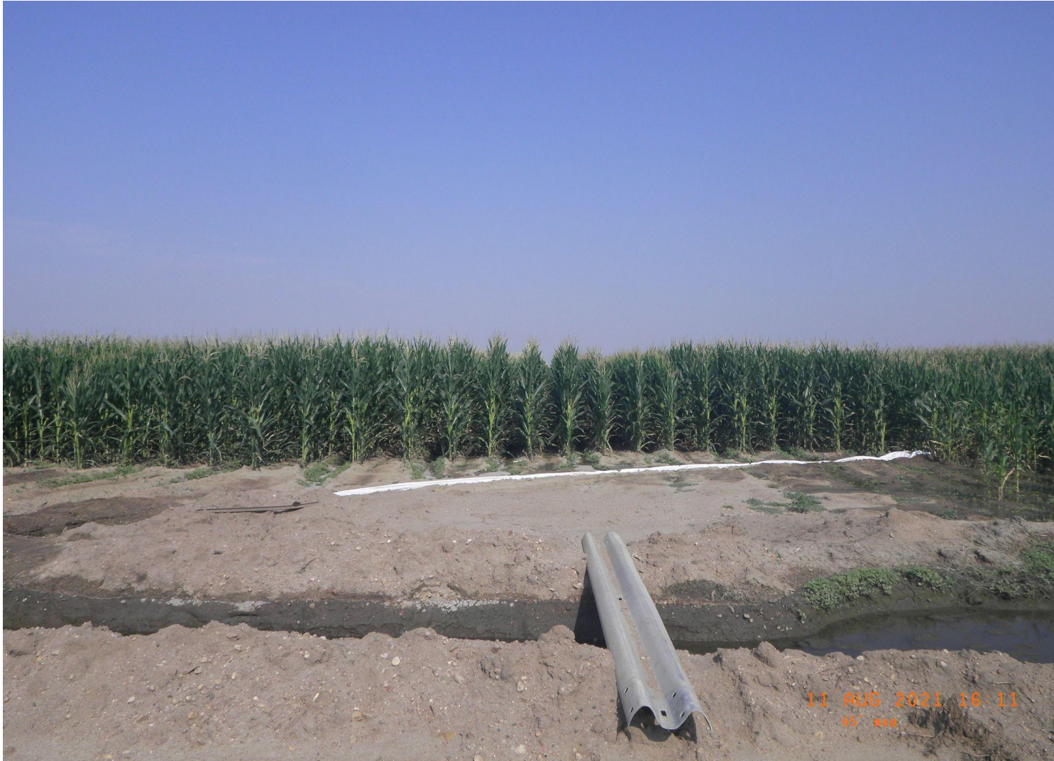
Photo 3. Ground photo taken from the west of the well pad.