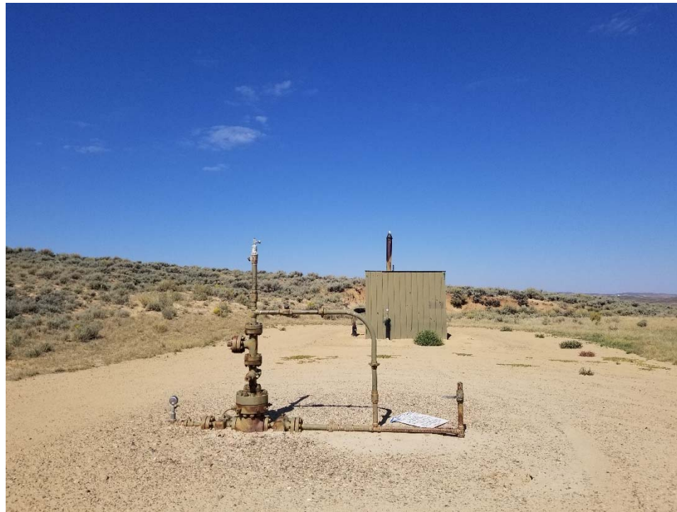
Photo 1. Overview of location taken facing northwest.