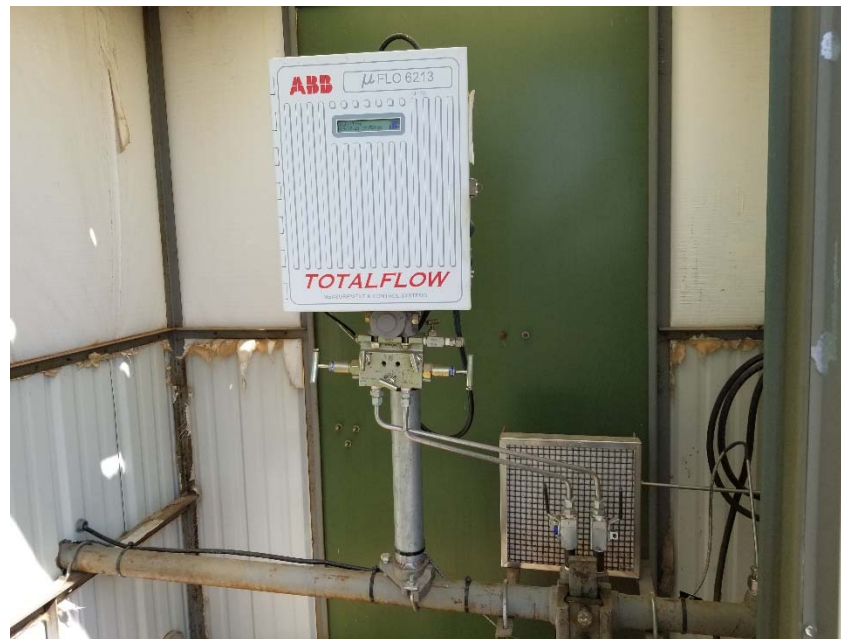
Photo 3. No calibration in gas meter run.