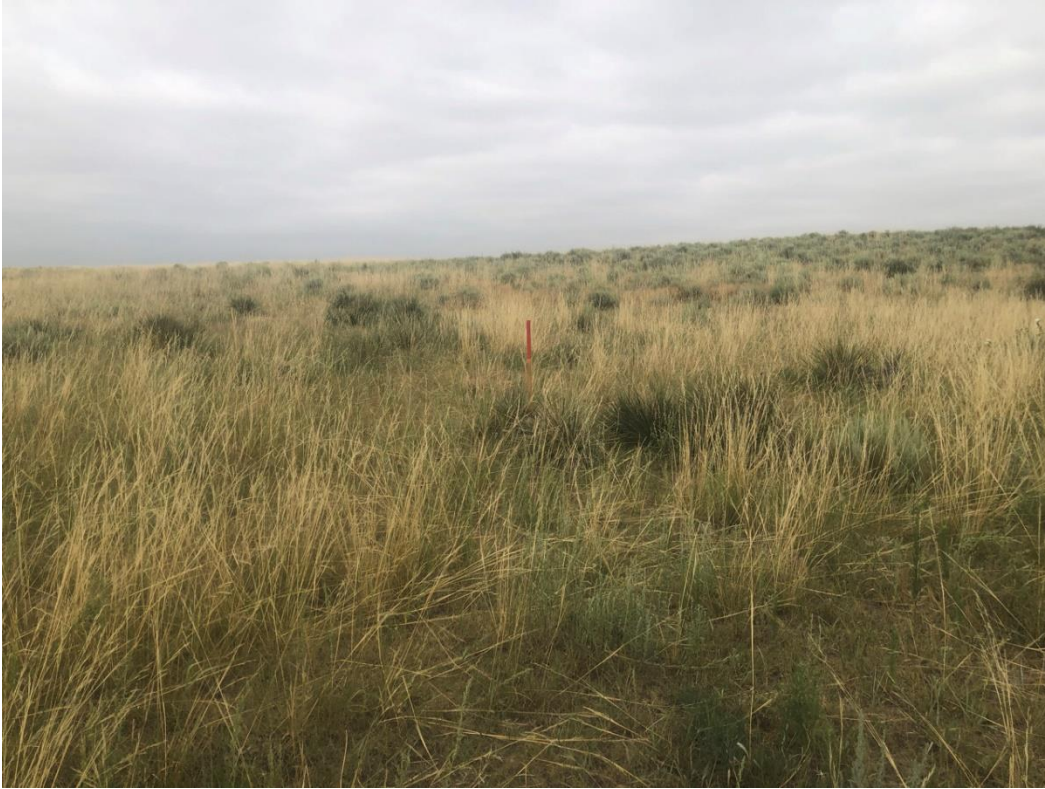
Photograph 5: Overall site view per COGCC Rule 1004.