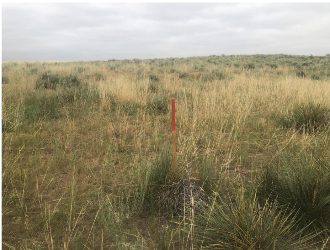
Photograph 4: View facing west as required in COGCC Rule 1004.