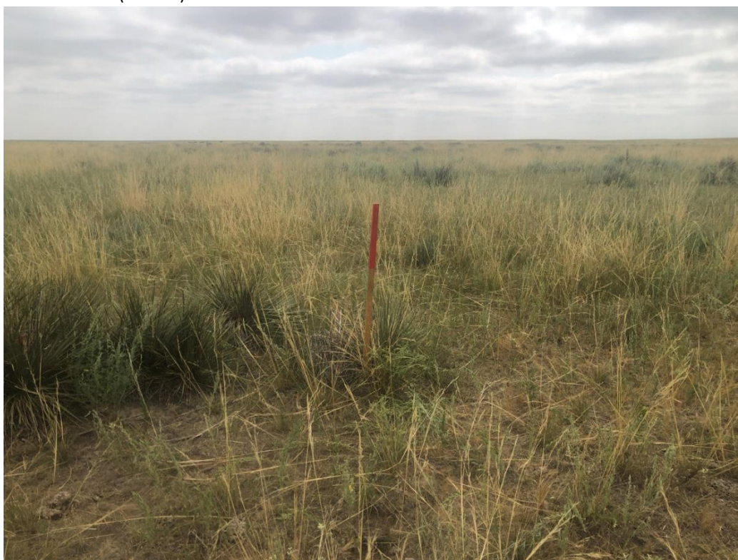
Photograph 2: View facing east as required in COGCC Rule 1004.