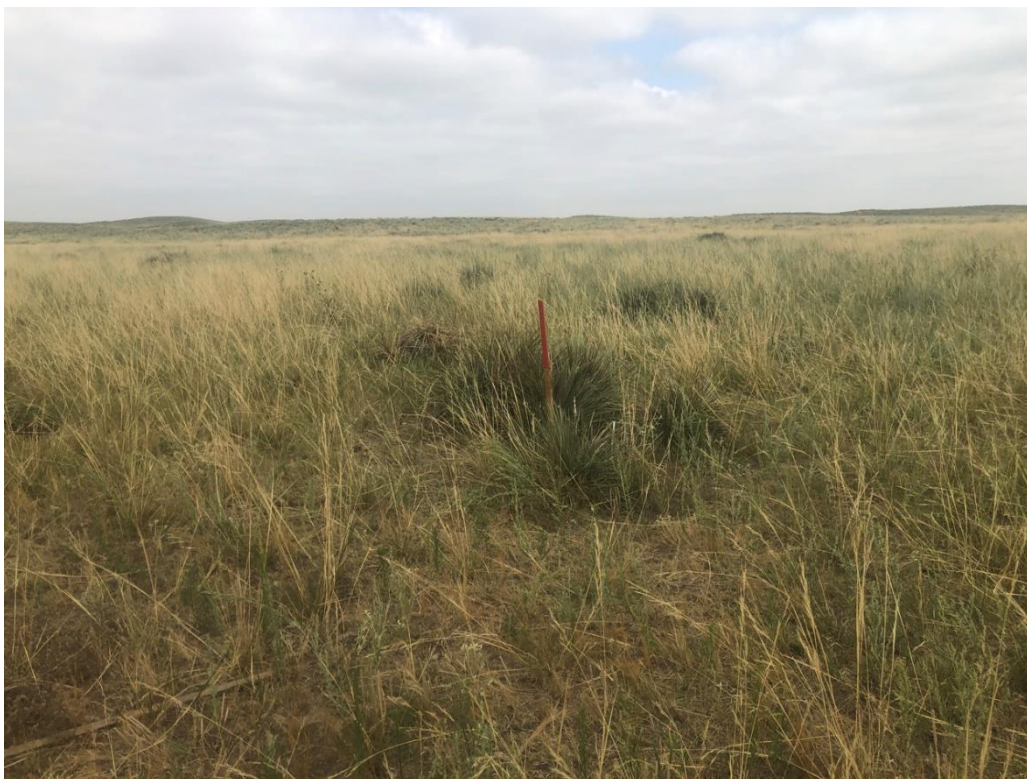
Photograph 1: View facing north as required in Colorado Oil and Gas Conservation Commission (COGCC) Rule 1004.