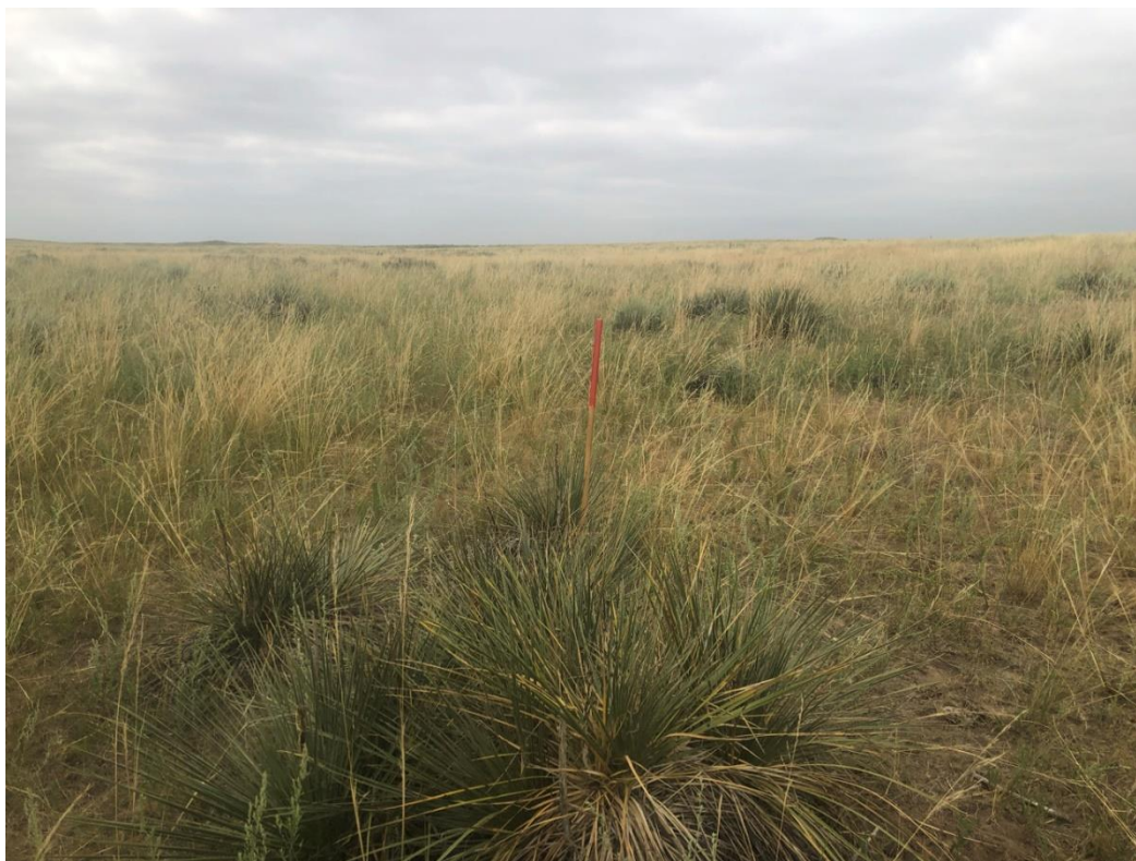
Photograph 3: View facing south as required in COGCC Rule 1004.