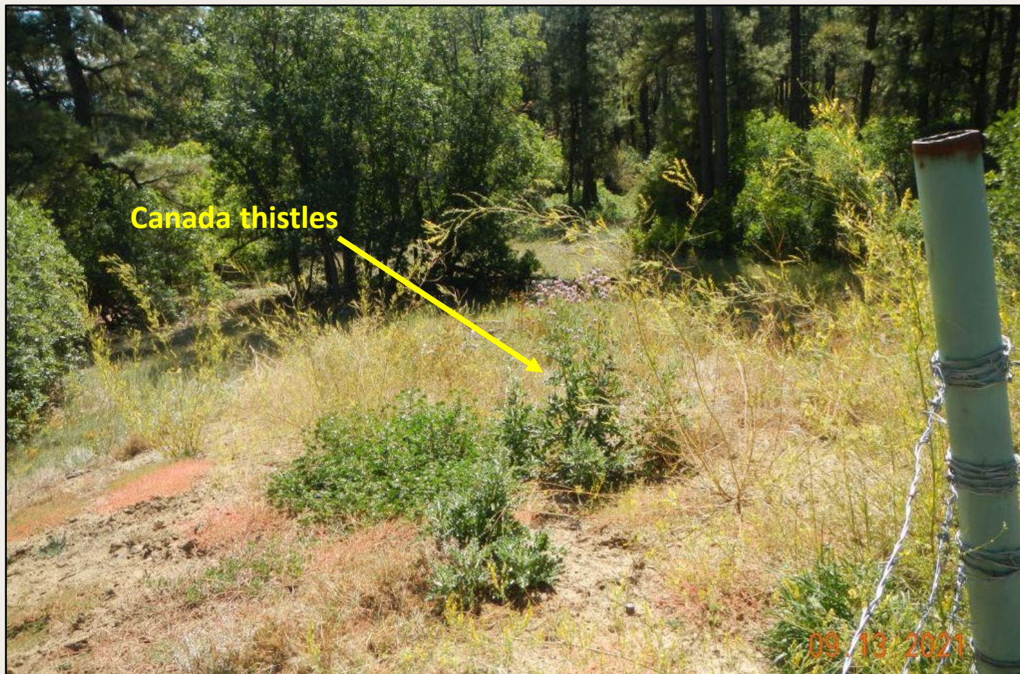
Photo 3. View of Canada thistles within the southern project area (outside of fence). Approx. 30 individuals observed.