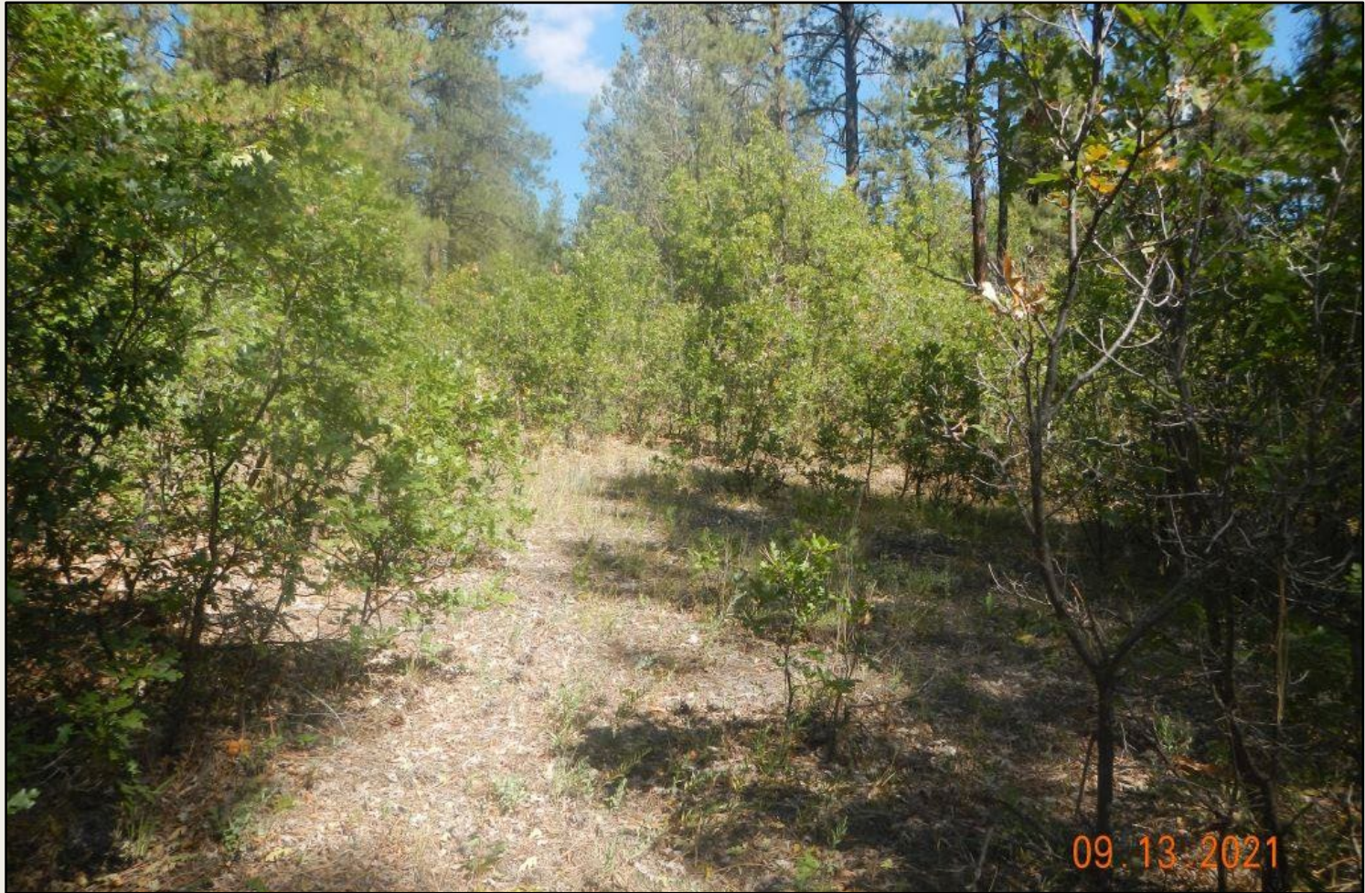
Photo 5. View of the reference area comprised of ponderosa pine forest with Oregon grape, western wheatgrass, smooth brome, serviceberry, and gambel oak in the understory.