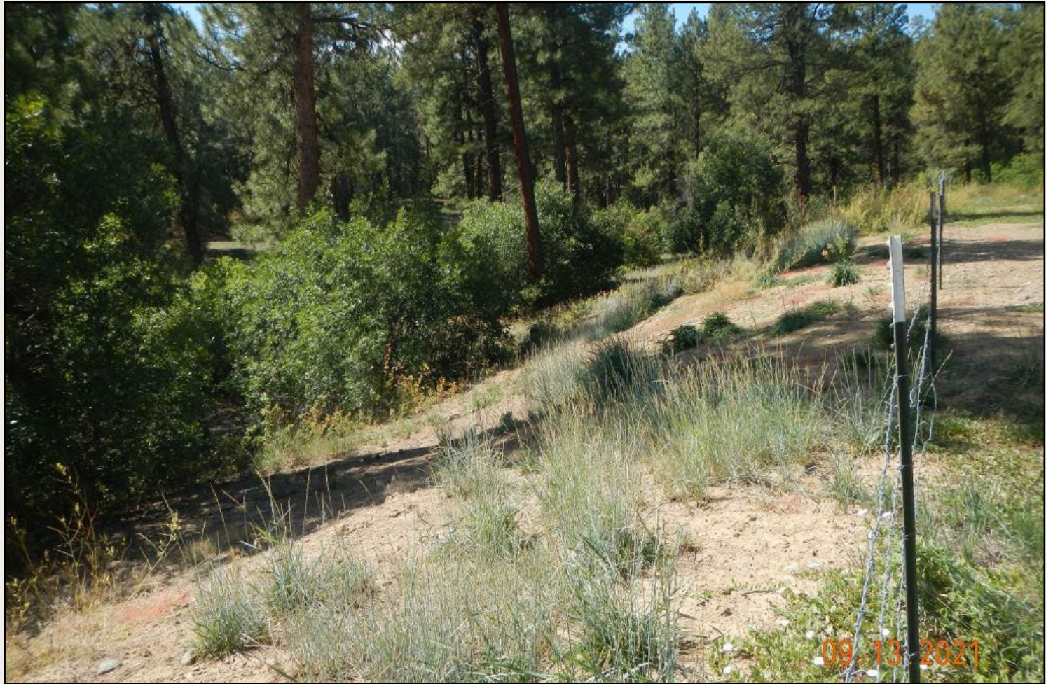
Photo 2. View of the southern fill slope from the southeastern edge facing westward. Revegetation is progressing in portions, largely with western wheatgrass.