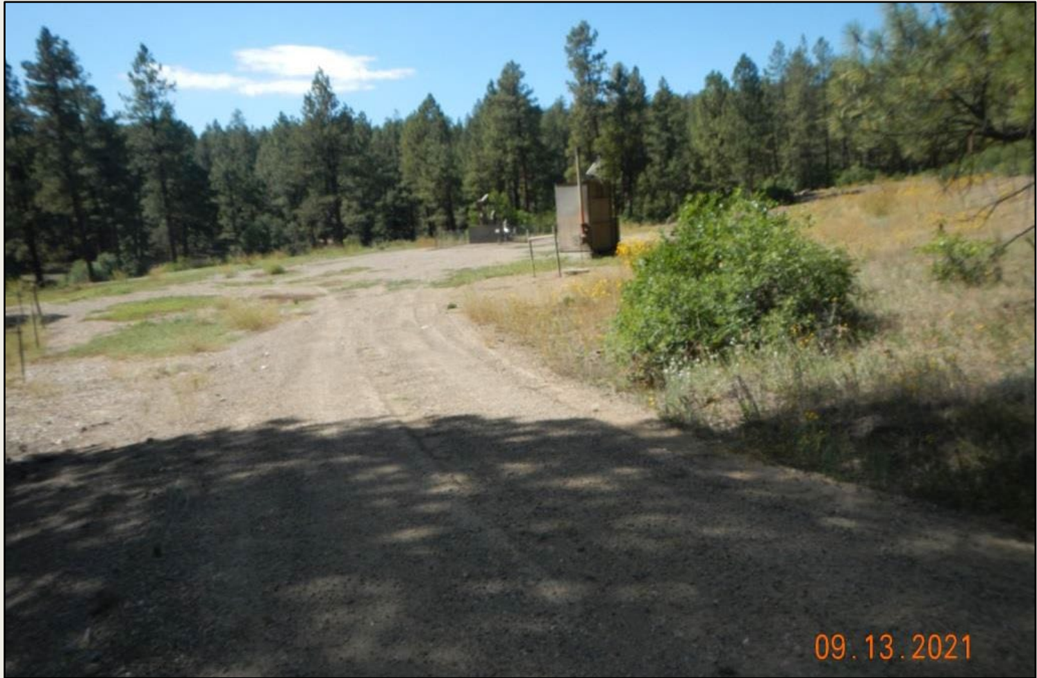
Photo 1. View of the project area from the well pad entrance facing center.