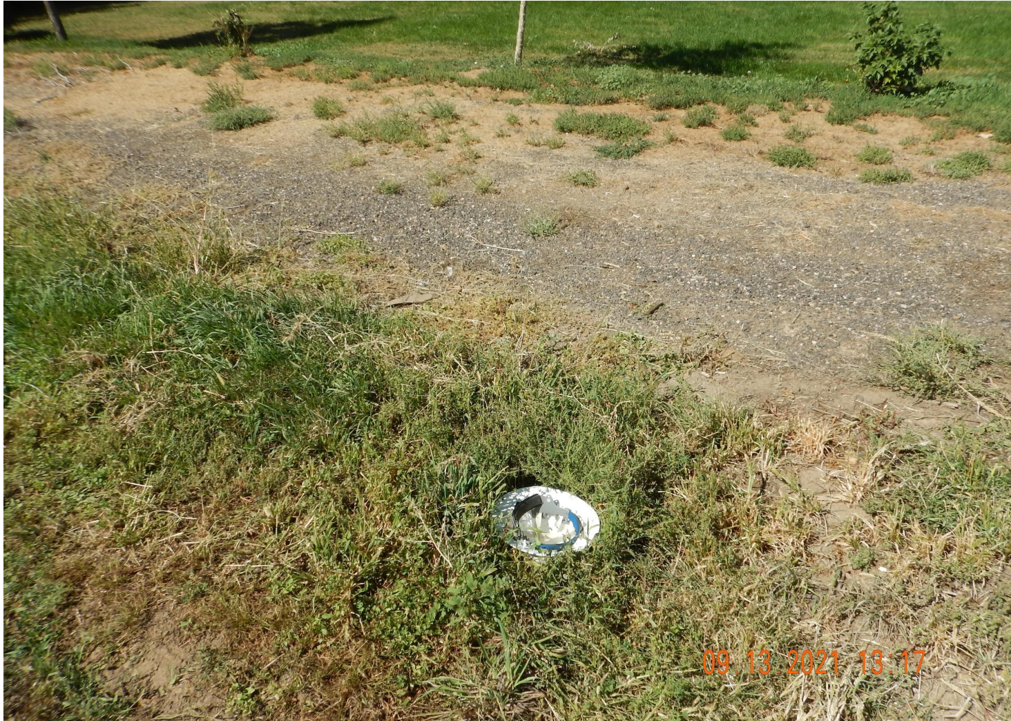
Photo 3. Photo taken from one of the flowline potholes.