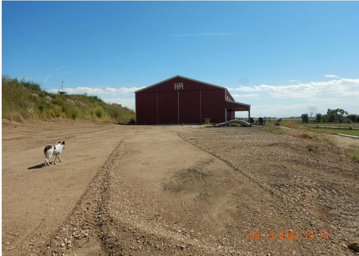
Photo 4. Photo taken from the tank battery, facing South. Photo illustrates tank battery has been utilized for the intended purpose for farm equipment storage. Location has been built upon and stabilized to minimize erosion.