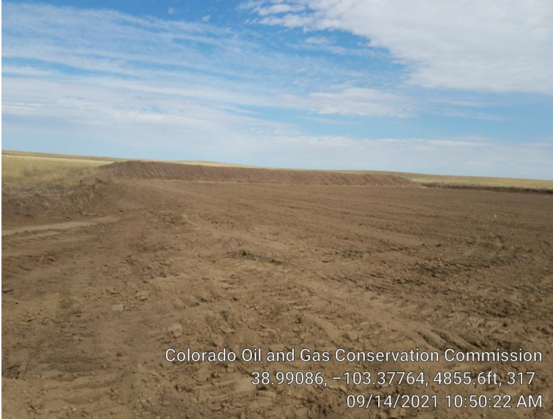
North topsoil pile.

Colorado Oil and Gas Conservation Commission 38.99086, -103.37764, 4855.6ft, 317° 09/14/2021 10:50:22 AM