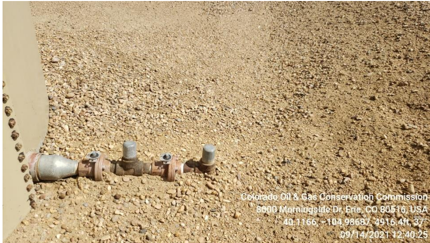
Photo 7 Stained soil has been cleaned from around valve on South side of crude tank