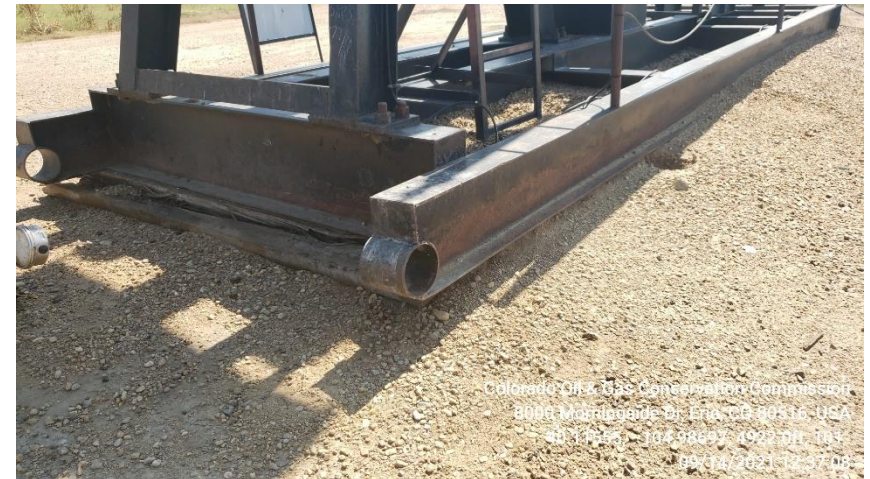
Photo 4 Stained soil has been cleaned around PJ base