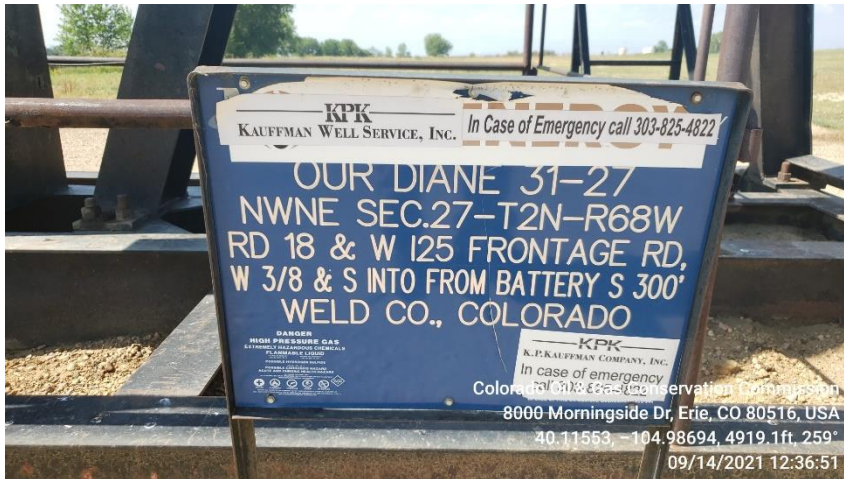
Photo 1 WH sign