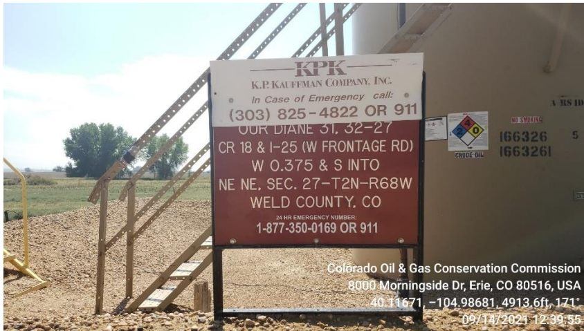
Photo 5 TB sign