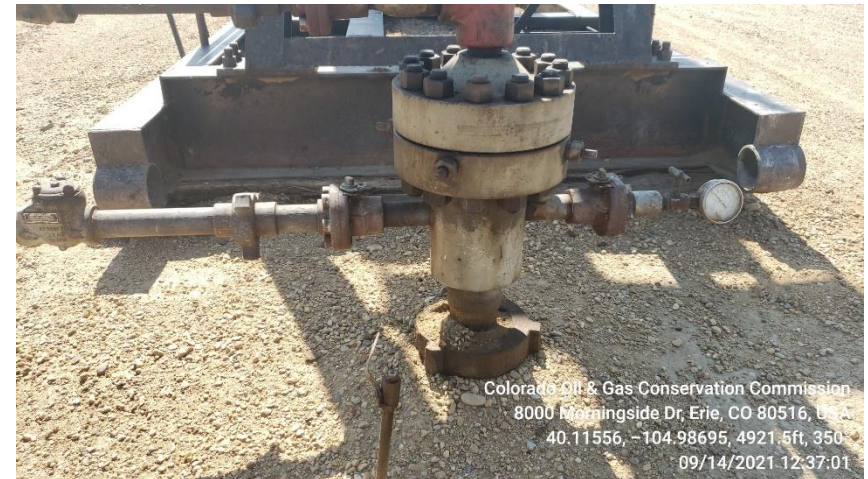
Photo 2 Stained soil has been cleaned around WH