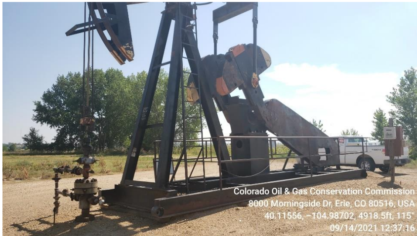
Photo 3 Pump jack