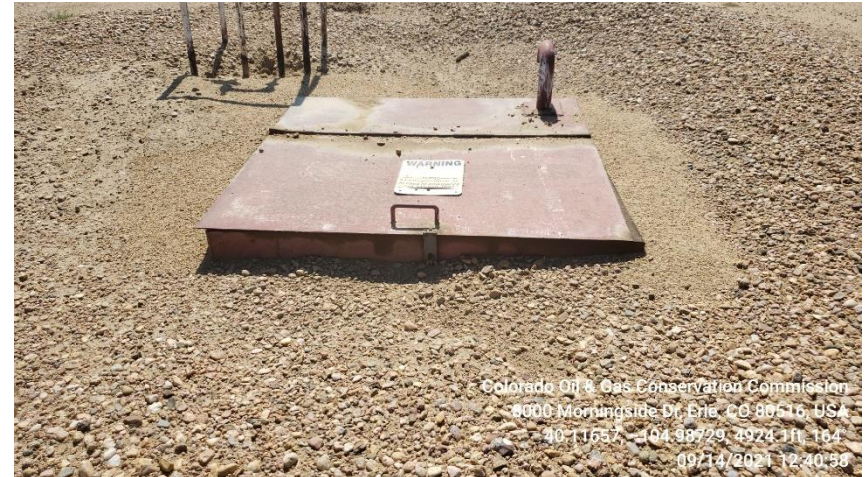
Photo 8 Stained soil has been cleaned from around locked cellar