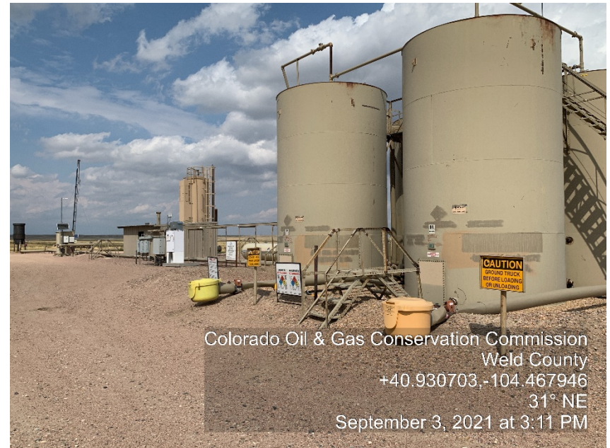
Colorado Oil & Gas Conservation Commission Weld County +40.930703, -104.467946 31° NE September 3, 2021 at 3:11 PM

Critter Creek 11-07H (05-123-32081) Wellsite Producing | PR