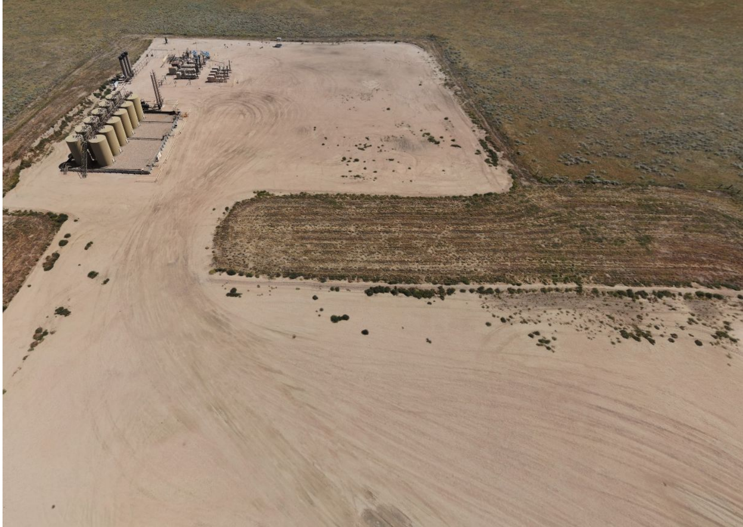
Photo 3. Drone aerial imagery illustrates the eastern location. Operator has performed interim reclamation activities; however, the size of the location can be further reduced in size.