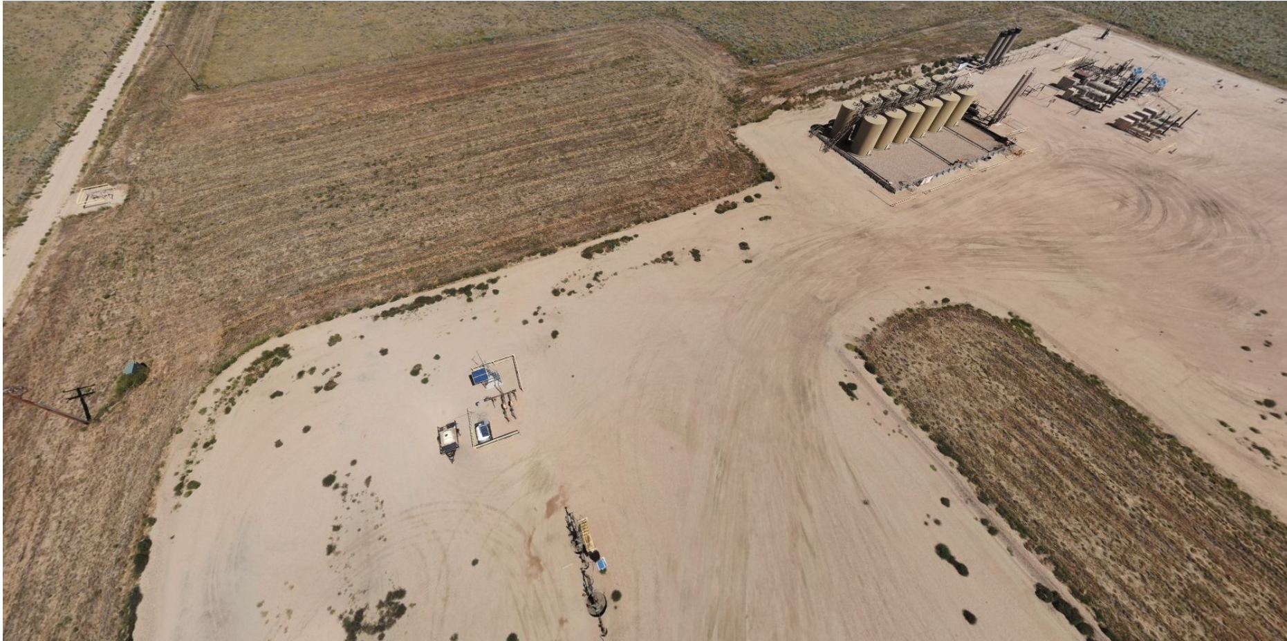
Photo 4. Drone aerial imagery illustrates the two wells and the north/northeastern location. See comments under Photos 1-3.