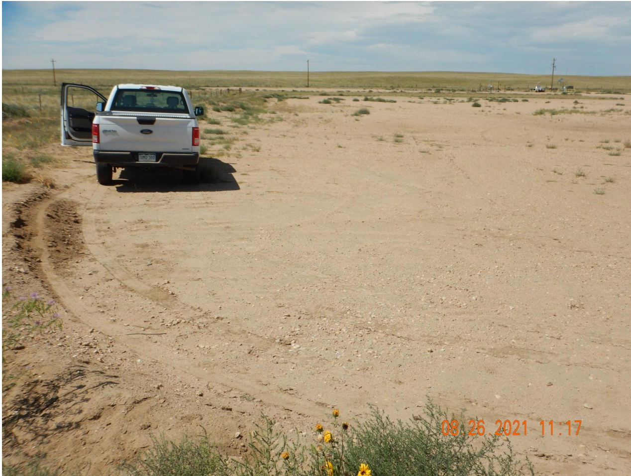
Photo 6. Photo taken from the southeastern perimeter of location, facing West. See comments under Photo 5.