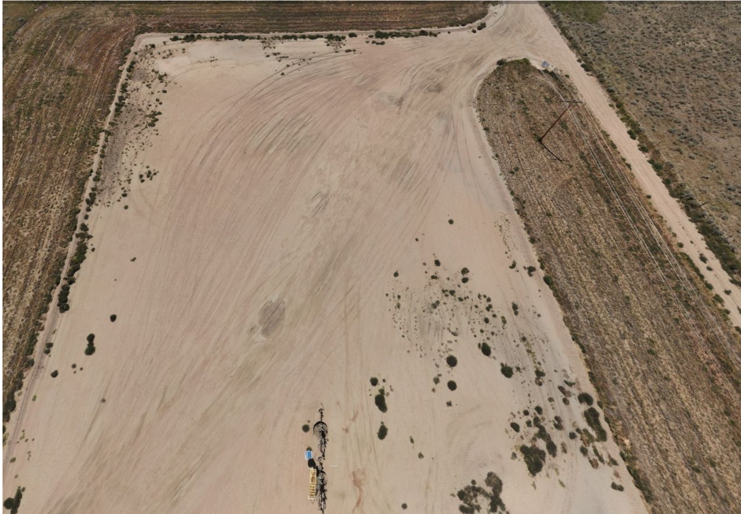
Photo 2. Drone aerial imagery illustrates the two wells, the location entrance and the southwestern location. Operator should reconsider location entrance to help further reduce the size of the southwestern area, illustrated here.