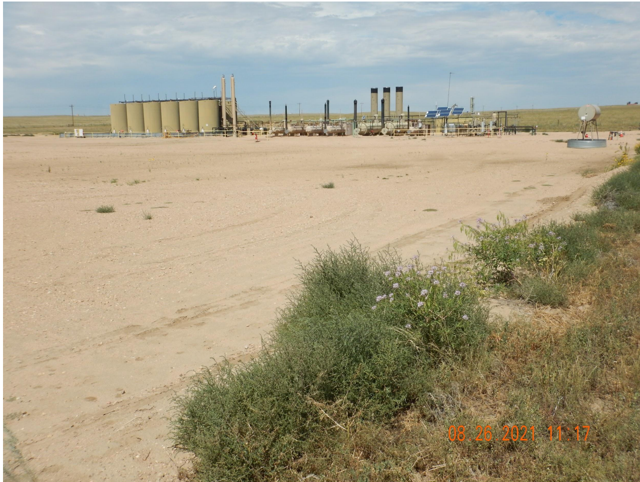
Photo 5. Photo taken from the southeastern perimeter of location, facing Northwest. Photo illustrates the size of the location can be further reduced in size.