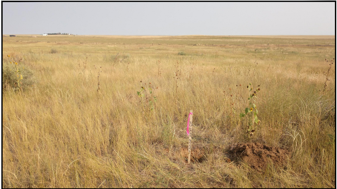
PHOTO: VIEW OF AS-DRILLED LOCATION