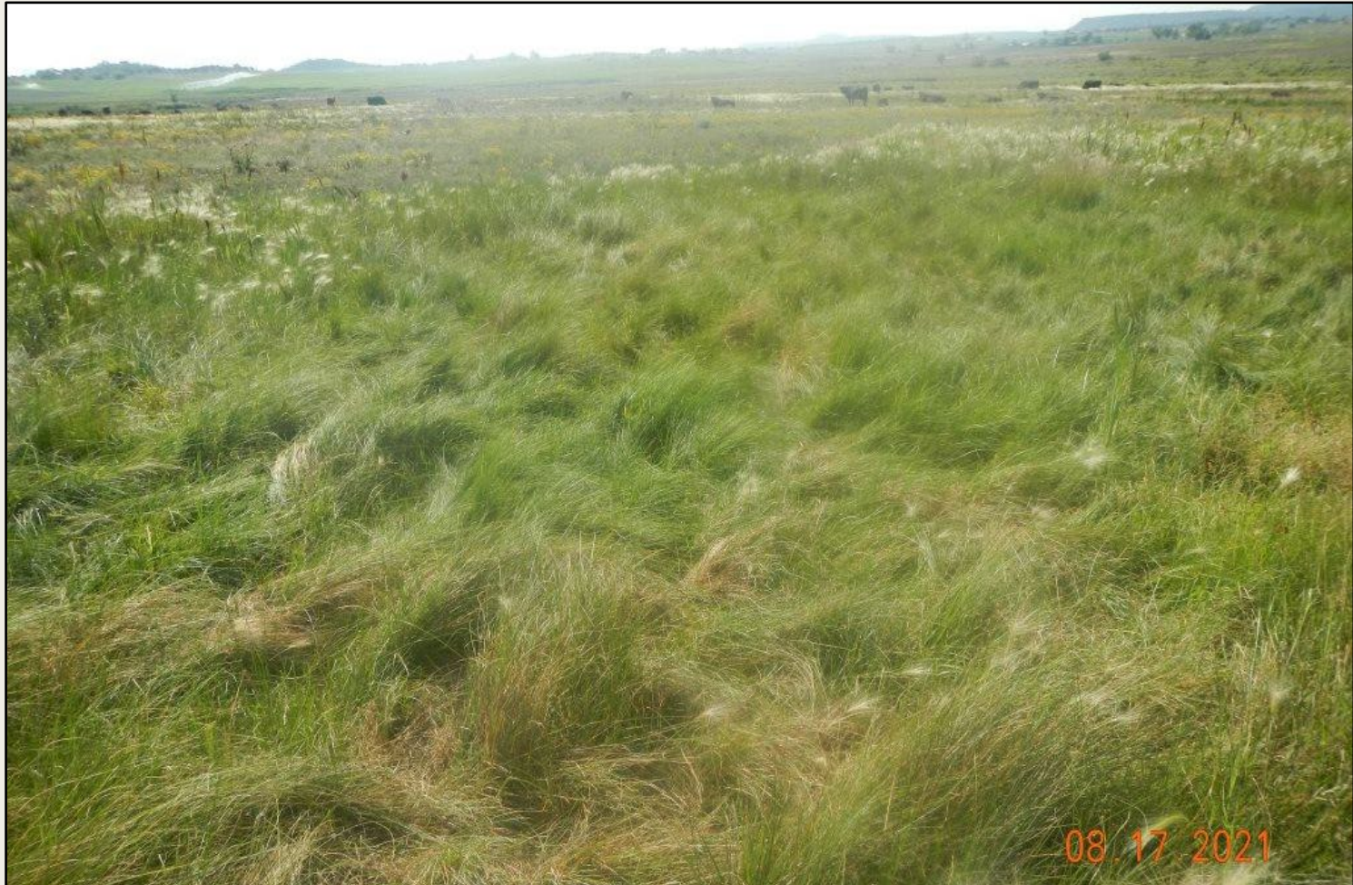
Photo 8. View of the reference area comprised of irrigated grass field with foxtail barley, Baltic rush, and curly doc.