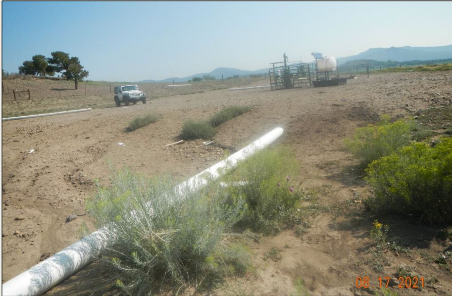
Photo 1. View of the project area from southwestern corner facing center.