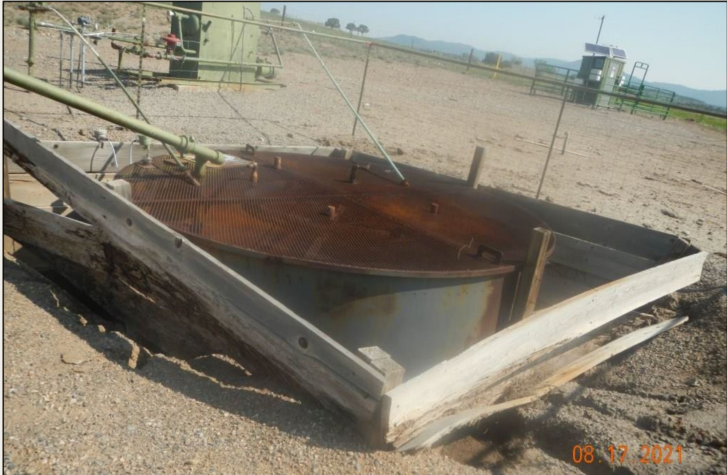
Photo 5. Another view of damaged and eroding containment around submerged vessel.