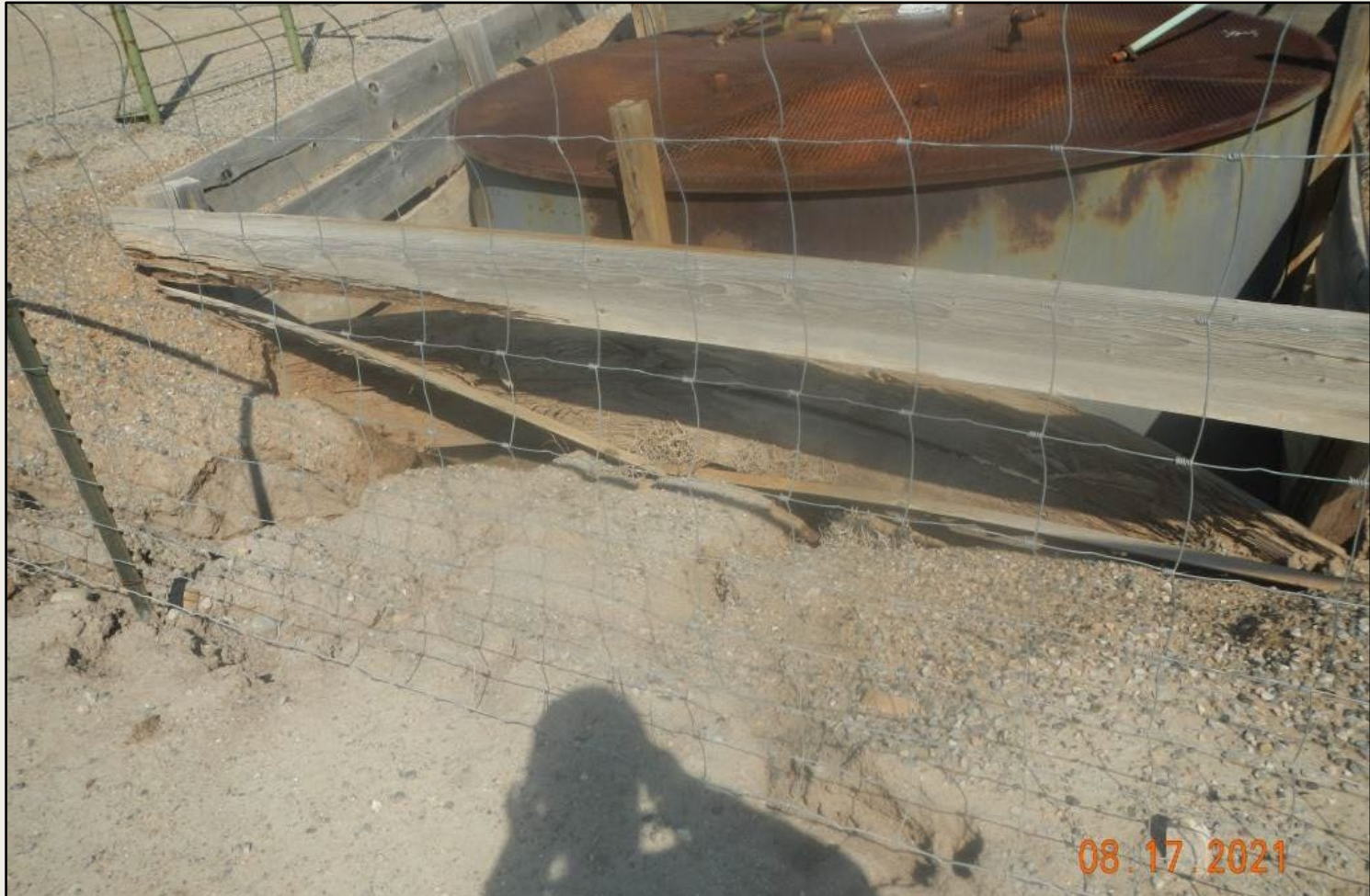
Photo 4. View of erosion occurring around submerged vessel. Area around the vessel is holding water and is not adequate containment.