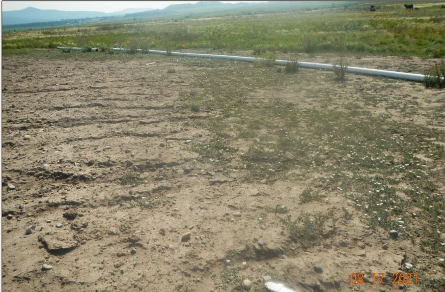
Photo 2. View of the southern project area facing eastward. Little desirable vegetation present within the interim reclamation areas. Rilling and erosional channeling is occurring across the fill slope.