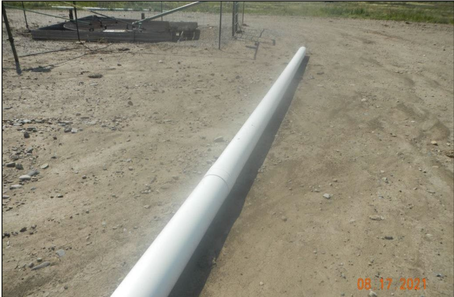
Photo 7. View of irrigation pipe on the well pad, needs to be removed. Additional pieces of broken pipe and other debris also observed.