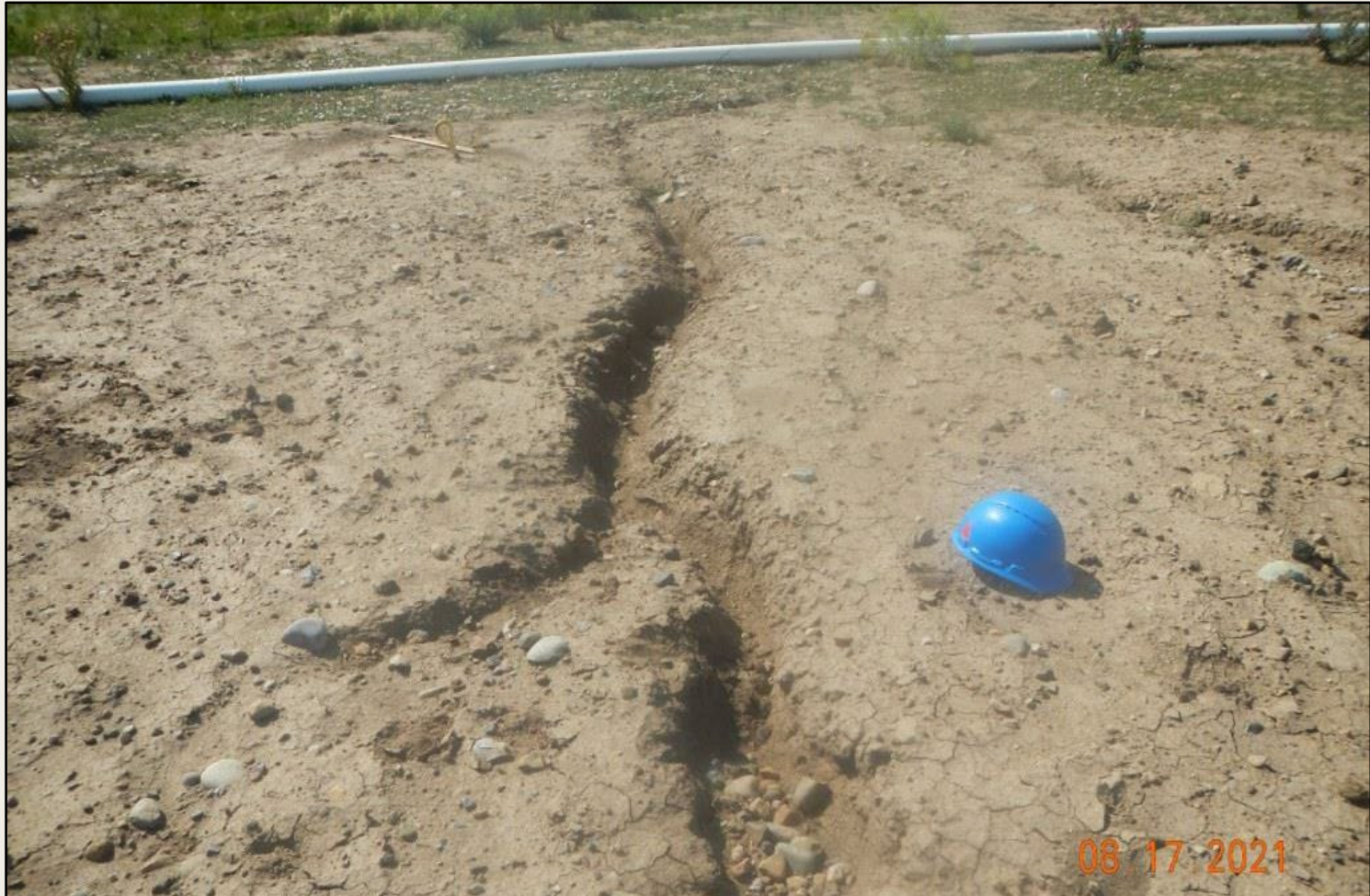
Photo 3. View of erosional channel forming within the southern project area, approximately 1-1.5ft wide and deep. Hard hat in place for scale.