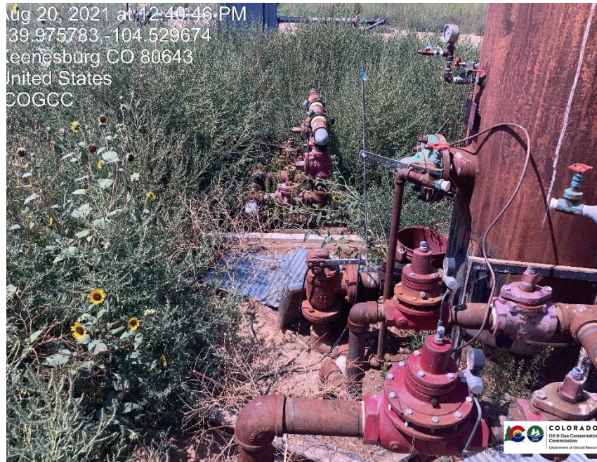
Pic 11 flow manifold next to separator.