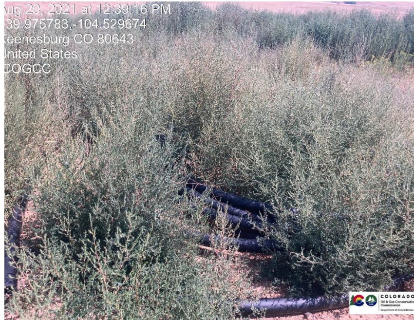
Pic 9 poly hose unused on location