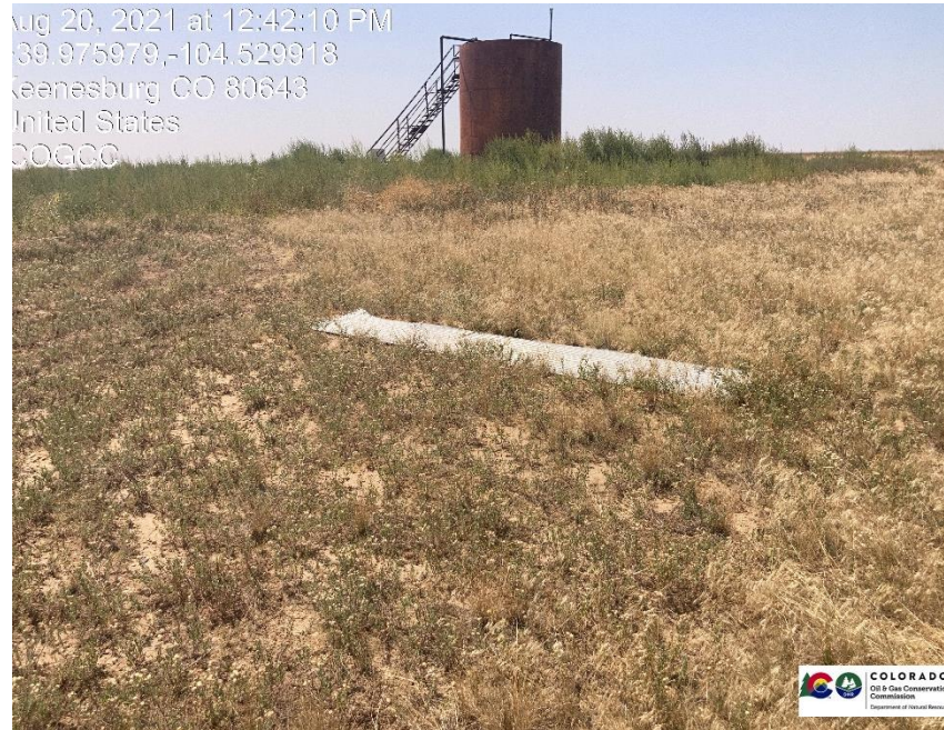
Pic 13 debris on location