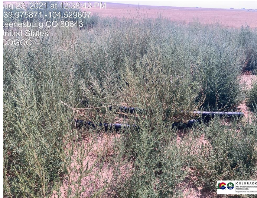
Pic 7 poly hose on location