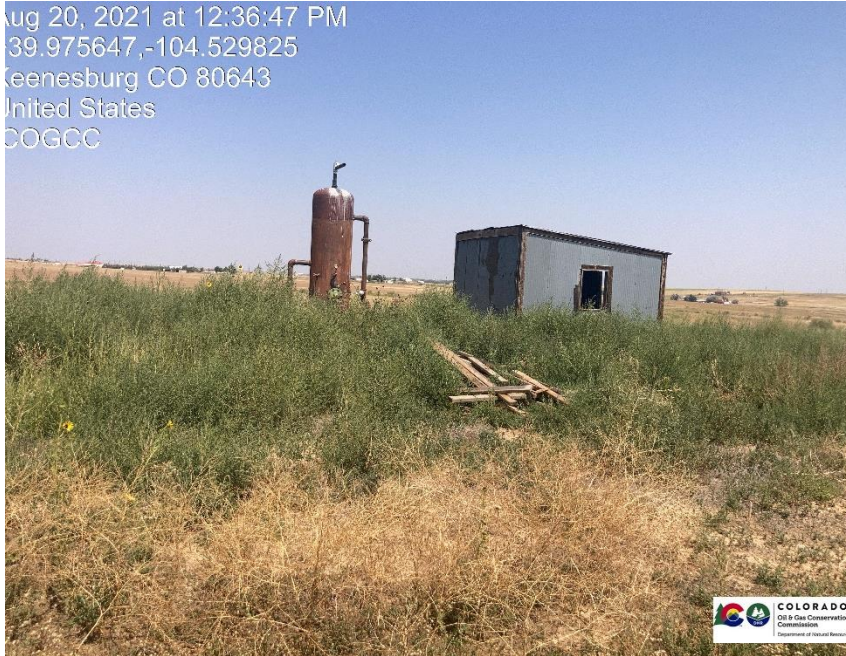
Pic 3 weeds, and trash around separator, and small building.

Aug 20, 2021 at 12:36:47 PM 39.975647,-104.529825 Keenesburg CO 80643 United States COGCC