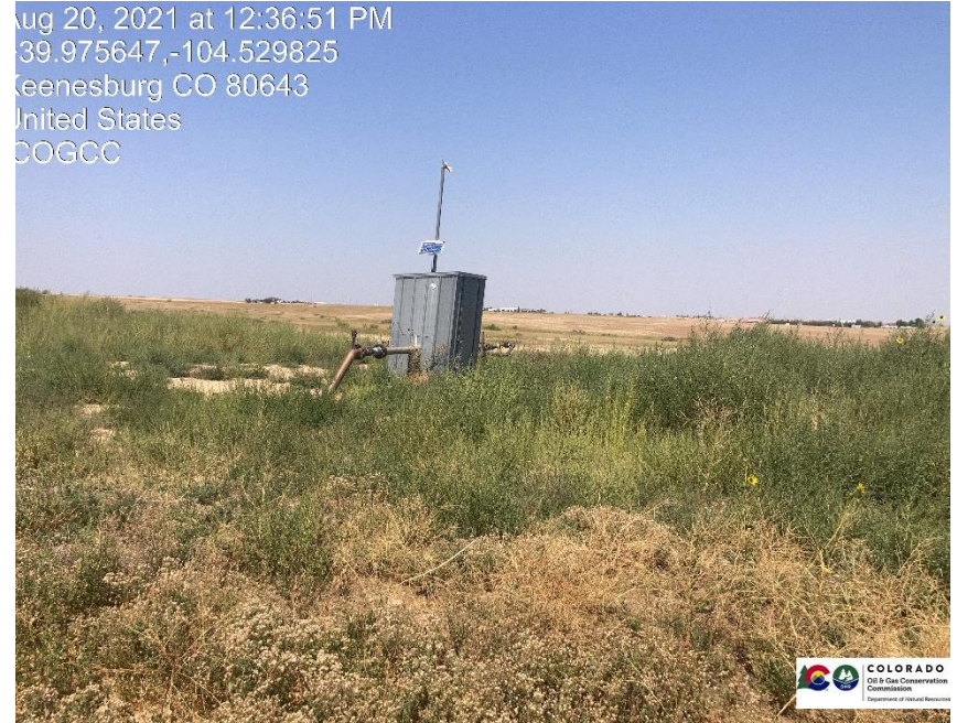
Pic 4 gas meter run weeds unmanaged.

Aug 20, 2021 at 12:36:51 PM 39.975647,-104.529825 Keenesburg CO 80643 United States COGCC