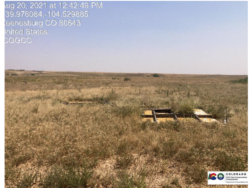
Pic 14 debris on location