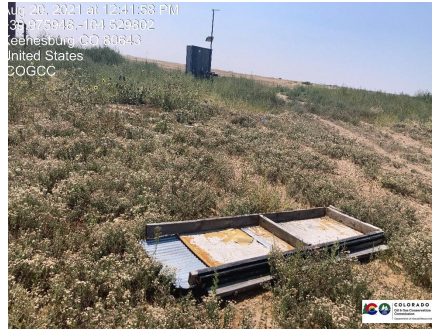
Pic 12 debris on location