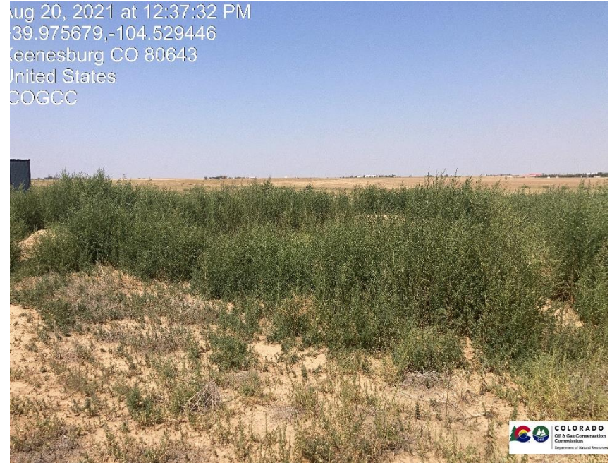
Pic 6 open pit, weeds unmanaged.

Aug 20, 2021 at 12:37:32 PM 39.975679,-104.529446 Keenesburg CO 80643 United States COGCC