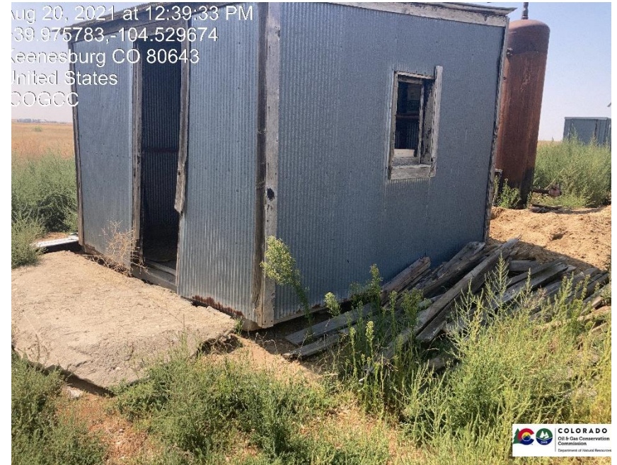
Pic 10 debris/trash/unused small building on location.