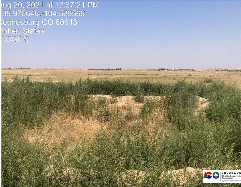
Pic 5 open pit, weeds unmanaged.

Aug 20, 2021 at 12:37:21 PM 39.975648,-104.529569 Keenesburg CO 80643 United States COGCC