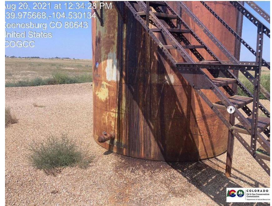
Pic 2 spill from top of tank