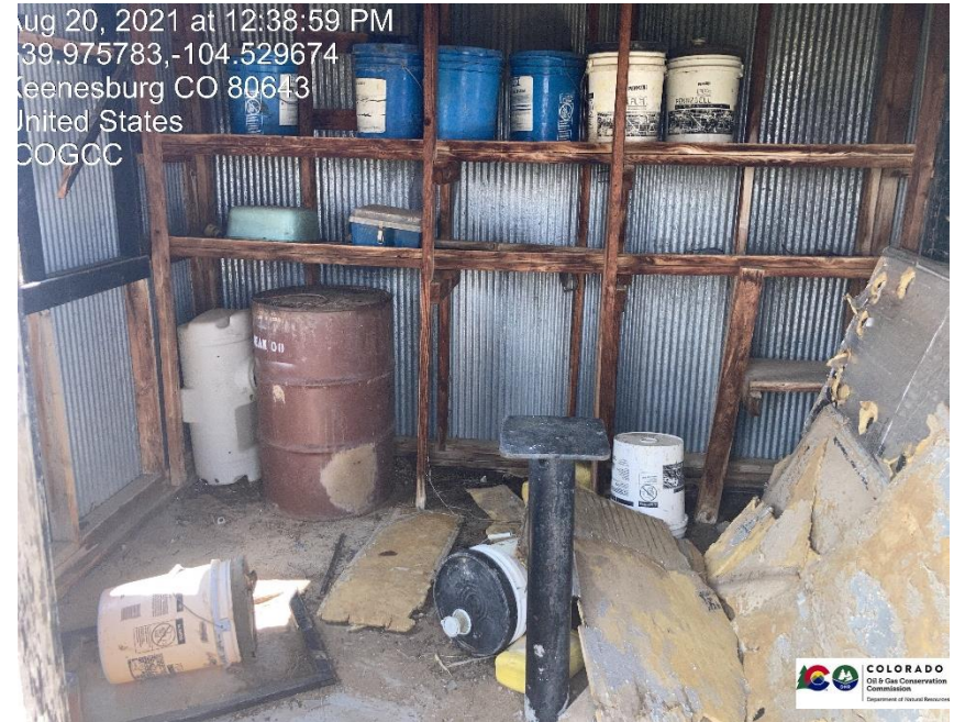
Pic 8 storage of chemicals in small building on location, no containment under chemicals.