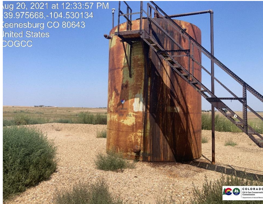
Pic 1 spill from top of oil tank