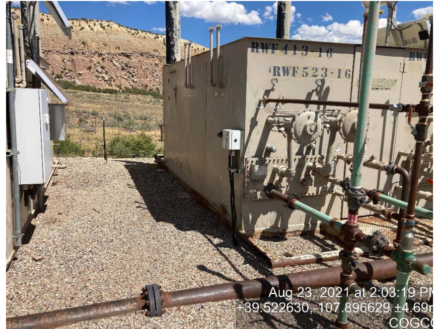
location/lack of labeling on separator baths