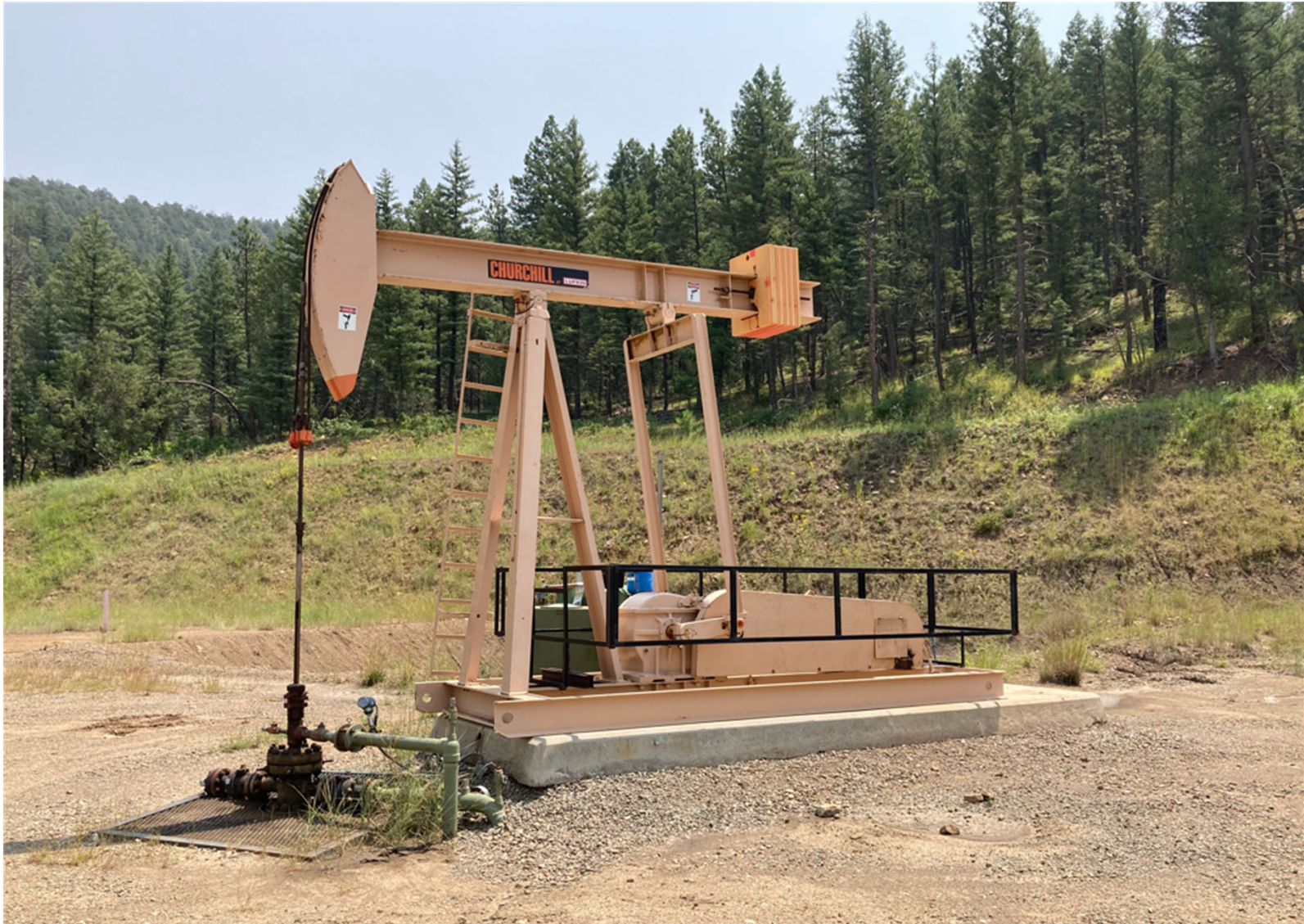
PHOTO 3: THE UNUSED EQUIPMENT WAS REMOVED FROM THE LOCATION. THE PC DRIVE HEAD WAS REPLACED WITH A PUMPING UNIT.

NEW ELK 36-03 API# 05-071-09135 – OGRIS OPERATING OGCC OPERATOR NUMBER 10758 - DATE: AUGUST 16, 2021 CORRECTIVE ACTIONS COMPLETED REGARDING COGCC FIR DOCUMENT # 695103945