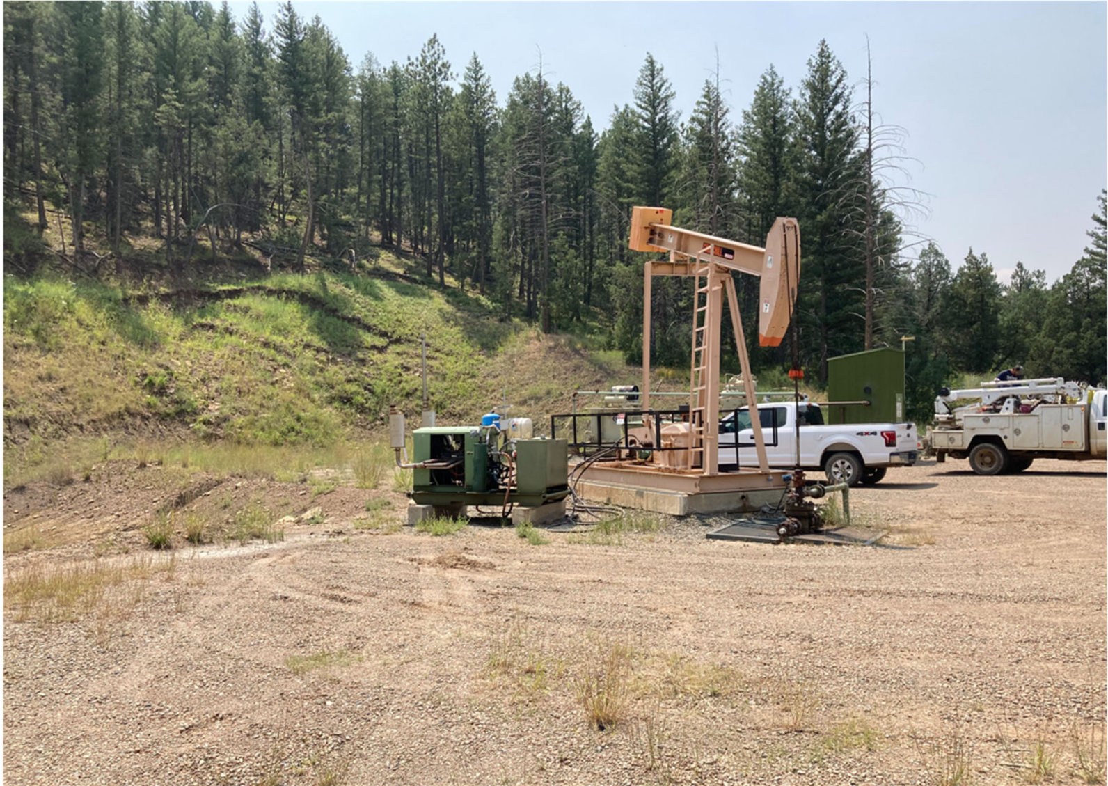
PHOTO 5: THE UNUSED EQUIPMENT, TANK, DEHY, TOP DRIVE HEAD AND PIPES WERE REMOVED FROM THE LOCATION.

NEW ELK 36-03 API# 05-071-09135 – OGRIS OPERATING OGCC OPERATOR NUMBER 10758 - DATE: AUGUST 16, 2021 CORRECTIVE ACTIONS COMPLETED REGARDING COGCC FIR DOCUMENT # 695103945