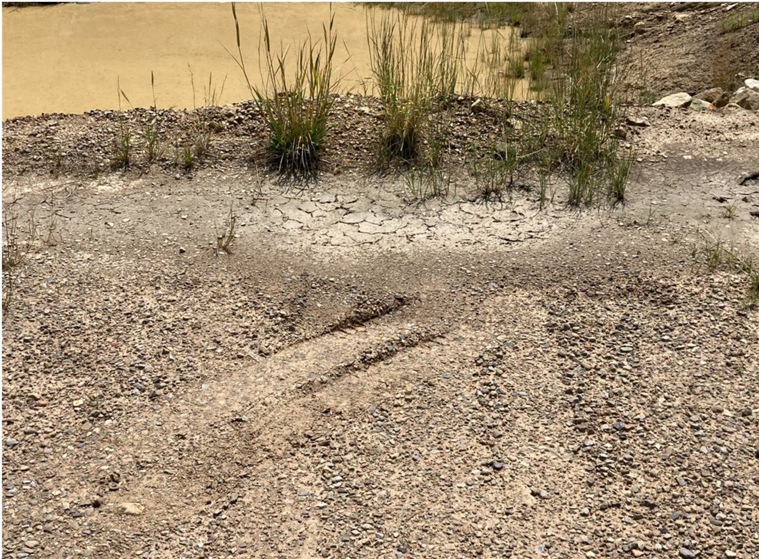
PHOTO 2: THE OILY SHEEN THAT WAS FOUND IN THE SNOW MELT PUDDLE WAS REMOVED BY VAC TRUCK ON 02-03-2021 AND PROPERLY DISPOSED IN ACCORDANCE WITH THE OGRIS OPERATING WASTE MANAGEMENT PLAN.

NEW ELK 36-03 API# 05-071-09135 – OGRIS OPERATING OGCC OPERATOR NUMBER 10758 - DATE: FEBRUARY 03, 2021 CORRECTIVE ACTIONS COMPLETED REGARDING COGCC FIR DOCUMENT # 695103945