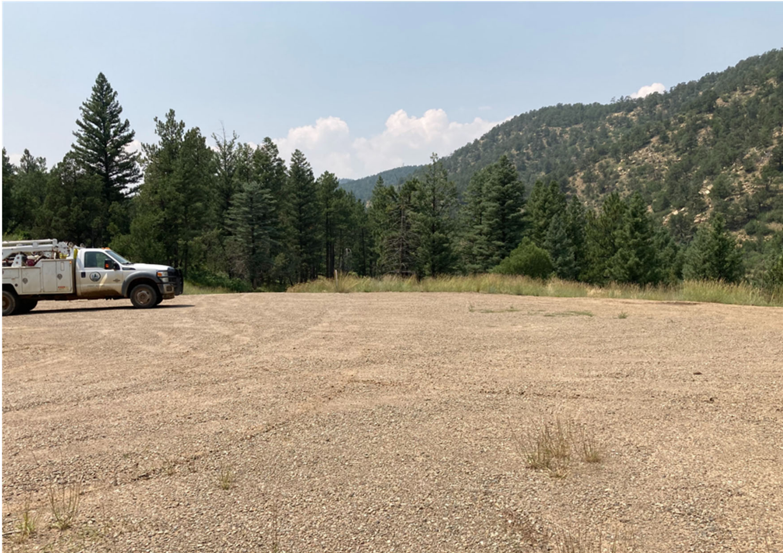
PHOTO 4: THE UNUSED EQUIPMENT AND TUBING TRAILER WAS REMOVED FROM LOCATION.

NEW ELK 36-03 API# 05-071-09135 – OGRIS OPERATING OGCC OPERATOR NUMBER 10758 - DATE: AUGUST 16, 2021 CORRECTIVE ACTIONS COMPLETED REGARDING COGCC FIR DOCUMENT # 695103945