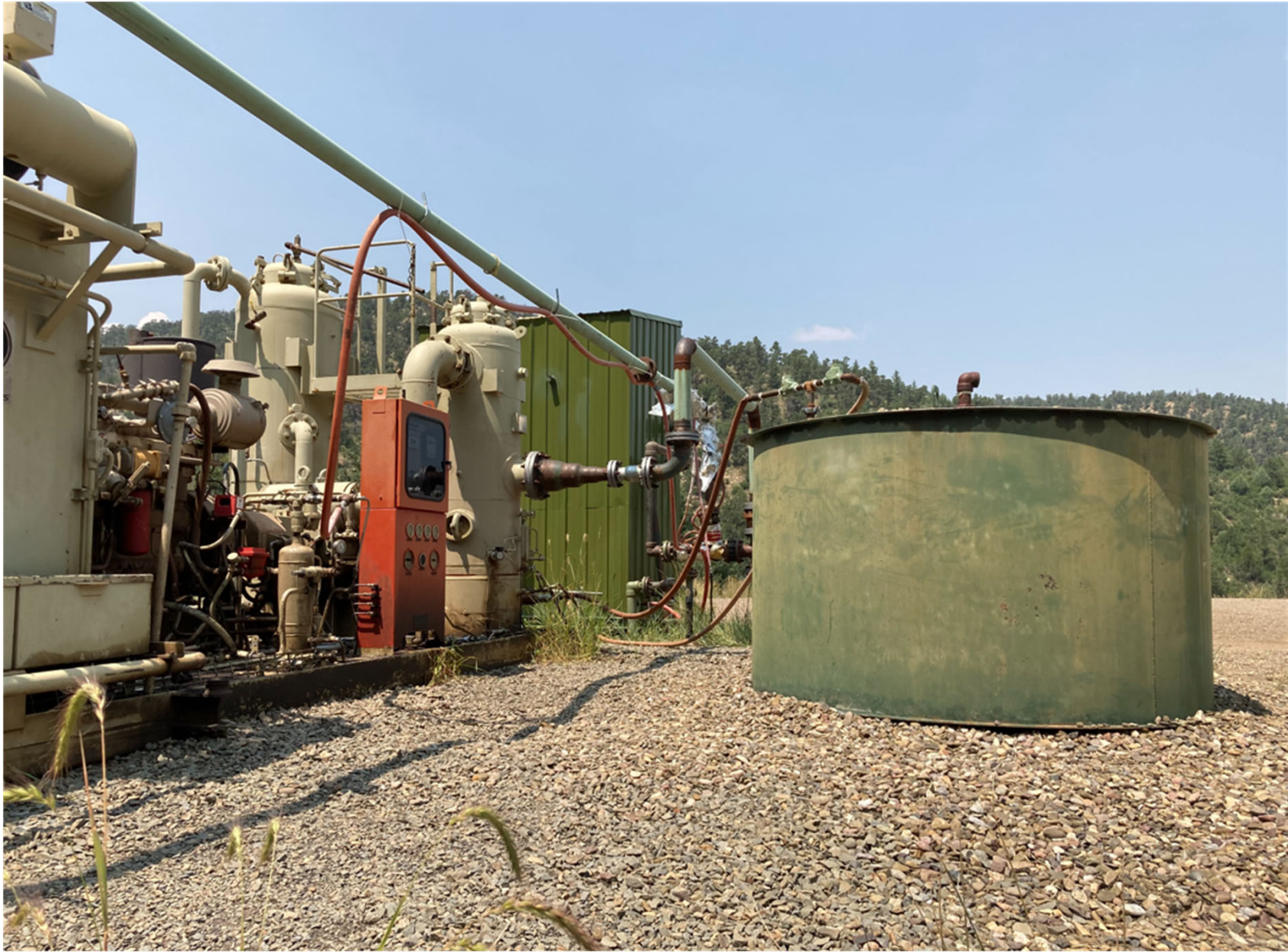
PHOTO 6: THE LARGE SCREW COMPRESSOR WAS RELOCATED BACK TO THE ORIGINAL POSITION BEHIND THE SEPARATOR HOUSE.

NEW ELK 36-03 API# 05-071-09135 – OGRIS OPERATING OGCC OPERATOR NUMBER 10758 - DATE: AUGUST 16, 2021 CORRECTIVE ACTIONS COMPLETED REGARDING COGCC FIR DOCUMENT # 695103945