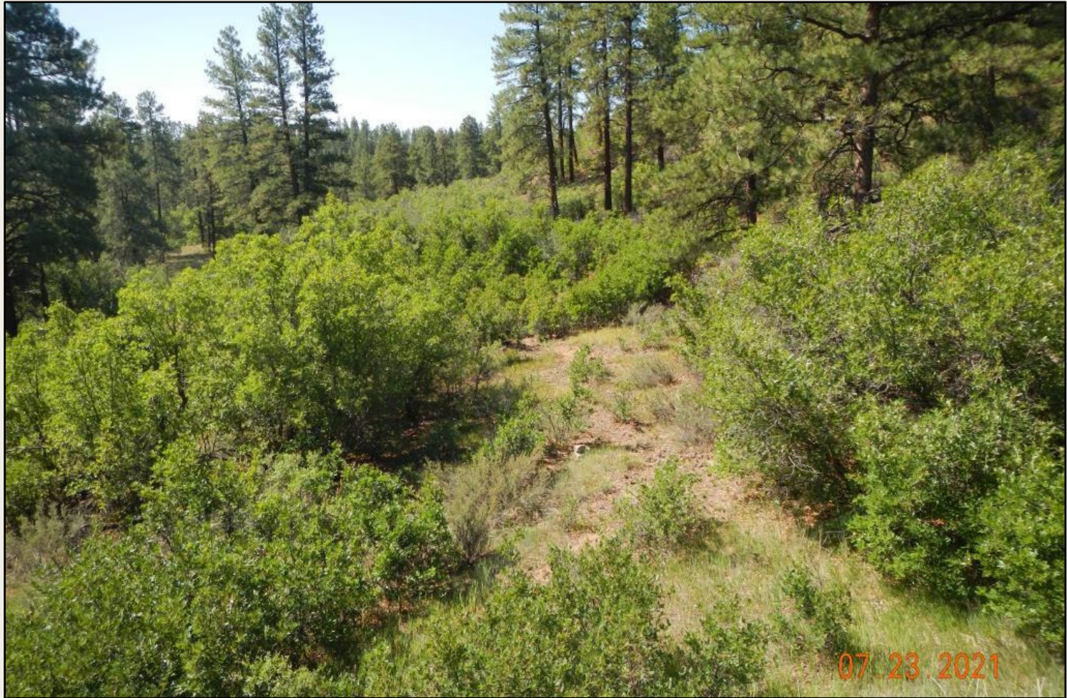
Photo 5. View the reference area comprised of ponderosa pine woodland with understory of gambel oak, serviceberry, western wheatgrass, and Oregon grape.