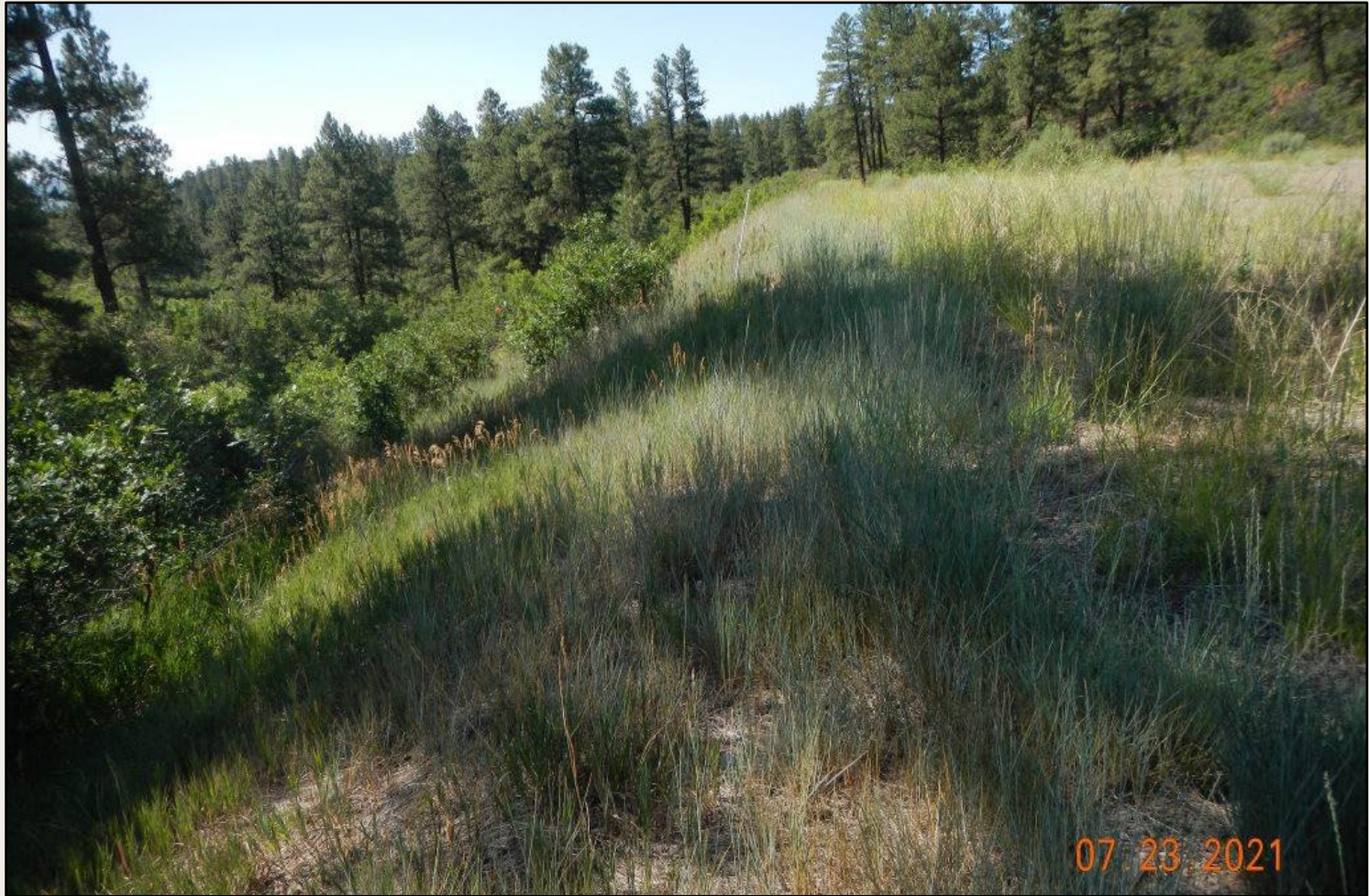
Photo 2. View of the eastern fill slope from the northeastern corner facing southward. Revegetation is progressing with western wheatgrass, sand dropseed, and smooth brome.