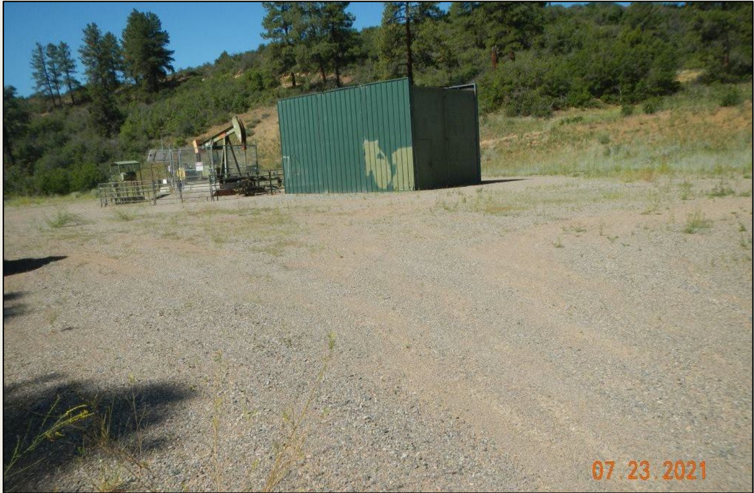
Photo 1. View of the project area from the well pad entrance facing center.