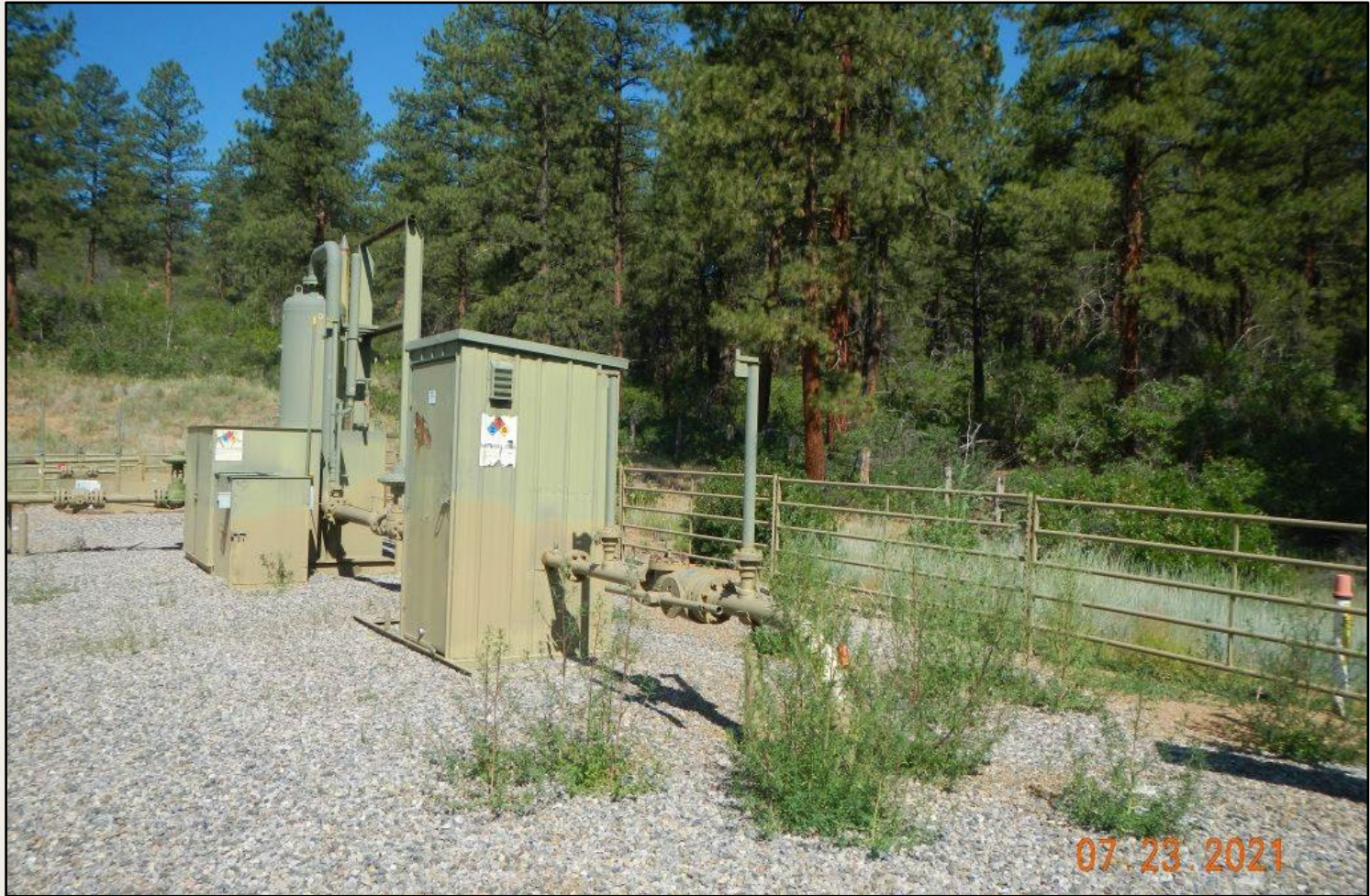
Photo 3. View of weeds growing around equipment needing management.