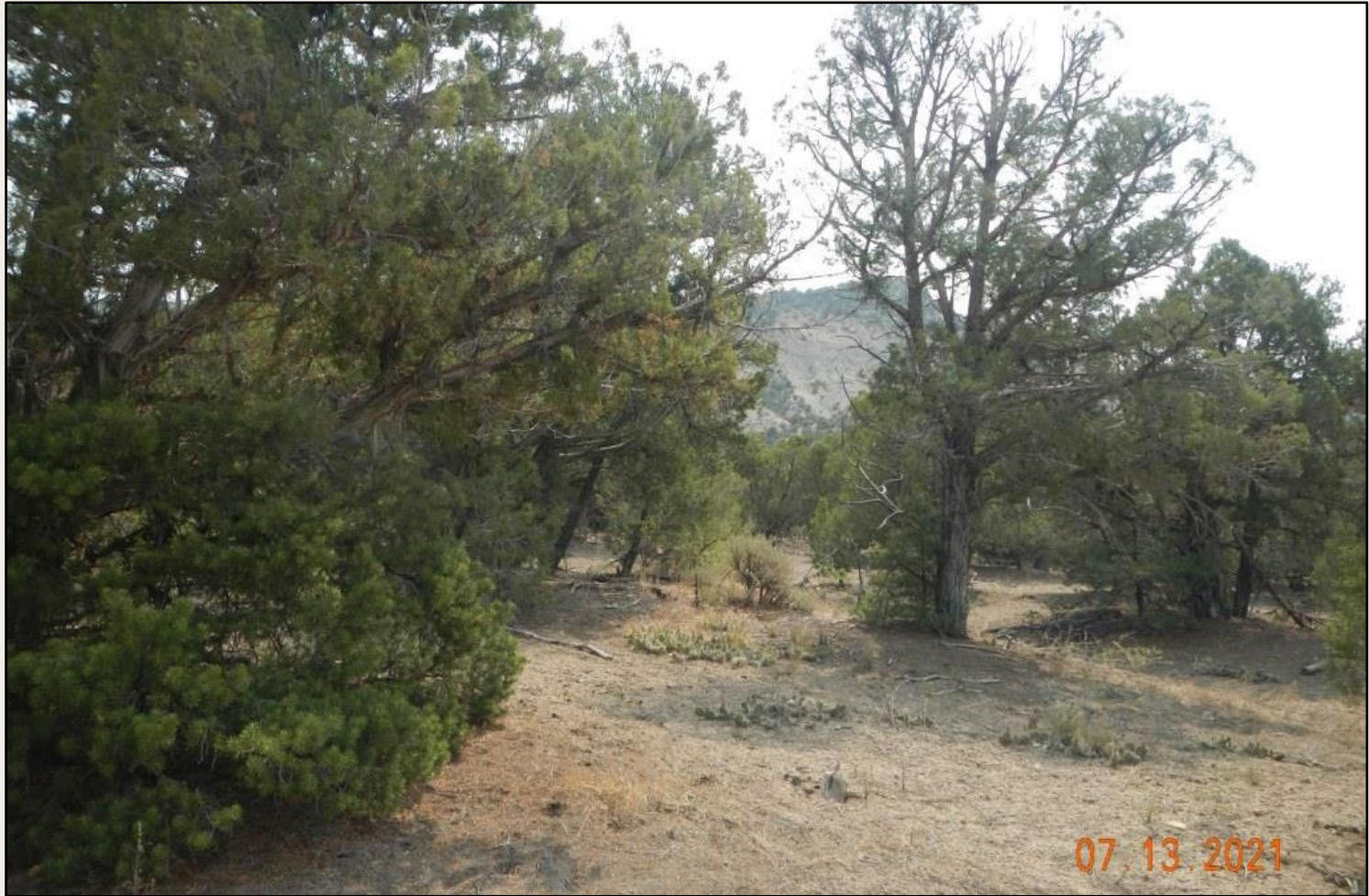
Photo 5. View the reference area comprised of pinyon and juniper woodland with understory of prickly pear, squirreltail, sagebrush, and gambel oak.