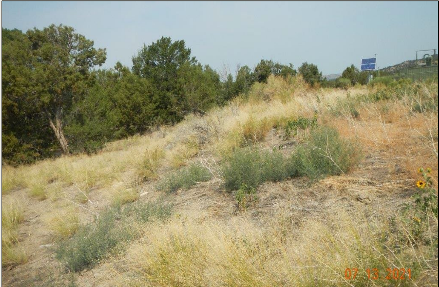
Photo 2. View of the western project area from the southwestern corner facing southward. Revegetation is progressing in portions with Indian ricegrass, rubber rabbitbrush, and crested wheatgrass. Other portions remain sparse and weedy and need to be monitored.