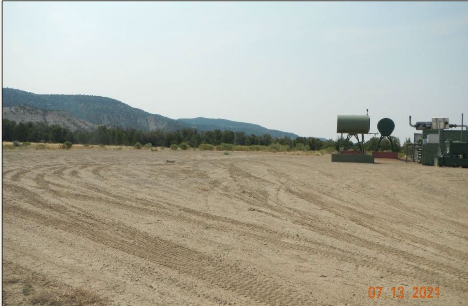
Photo 1. View the project area from the well pad entrance facing center.