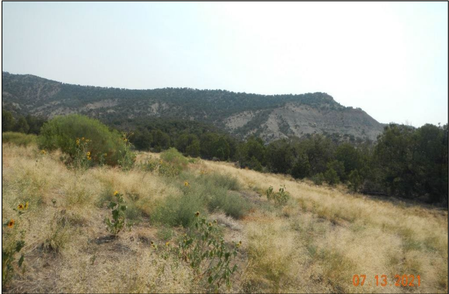
Photo 3. View the southern project area from the southwestern corner facing eastward.