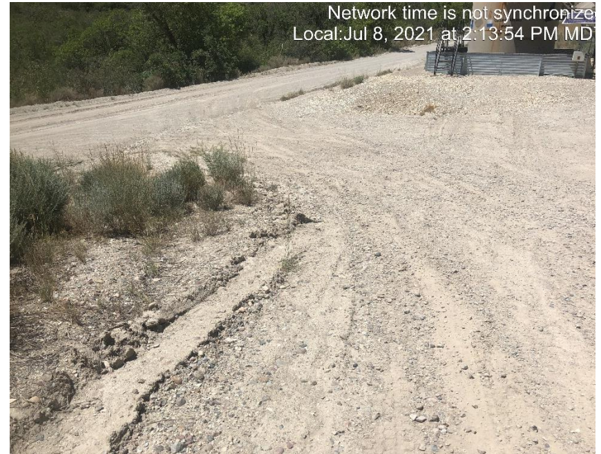
Photo #4368 No form of tracking BMP located at entrance to location.