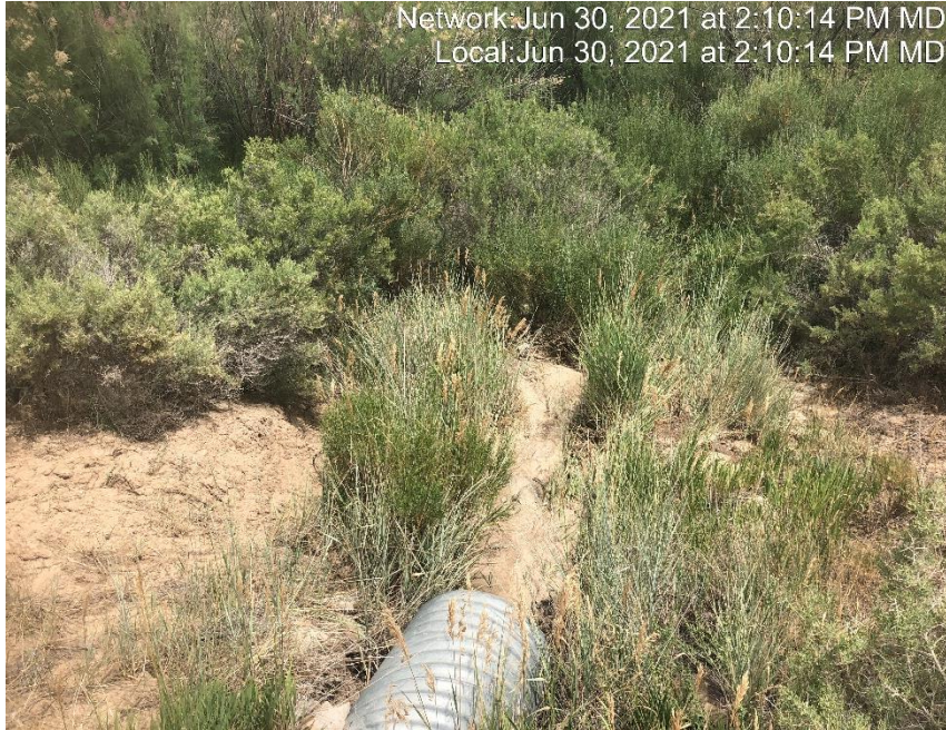
Photo #4260 Outlet of culvert that contributes to Parachute creek.