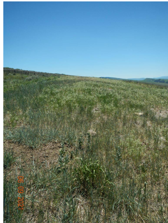
Photo#4: Top of slope, loafing area, Cheat grass established. note Curled (treated) Houndstongue in foreground.